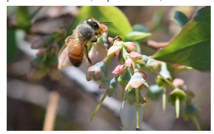
Figure 1. Apis mellifera , the European honey bee.

addition to managed colonies, which can be rented during bloom, feral colonies are widespread throughout Florida and can contribute to pollination. However, certain foraging behaviors of honey bees can make them less effective pollinators for blueberries. For instance, workers generally collect nectar but not pollen from blueberry flowers, and will sometimes "rob" nectar through slits in the petals, minimizing contact with the flower's anthers and stigmas required for successful pollination. More visits by nectarrobbing honey bees may thus be necessary to deposit an adequate amount of pollen as compared to other pollinators that make full contact with the flower's reproductive parts. Despite these behaviors, due to their high abundance in blueberry fields, honey bees can significantly increase pollination and fruit set (Sampson et al. 2004).