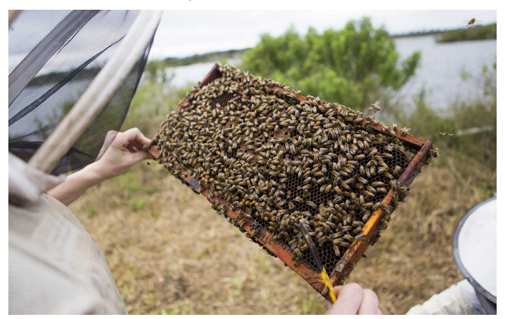
Figure 5. Honey bees on hive frame.

It is important to check the health of bee colonies upon delivery and throughout the bloom period. Of the typical ten frames in a honey bee hive, eight or more should have adults covering the frame, and six or more should have brood in the cells of the frame (Figure 5). The colonies should remain active during good weather, with steady flight into and out of the hive and bees active on the blueberry flowers. The grower may want to consider entering into a pollination contract with the beekeeper to define expectations and responsibilities (sample contract at http://edis.ifas.ufl.edu/aa169).