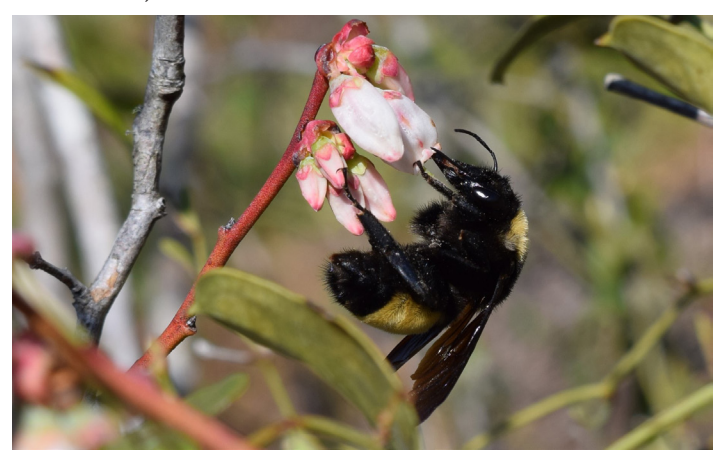
Figure 2. Bombus pensylvanicus , the American bumble bee.

There are five species of social bumble bees ( Bombus spp.) native to Florida (Figure 2), all of which can pollinate blueberry flowers. Bumble bees have annual colonies, with new queens initiating colony development and foraging for nectar and pollen in late winter/early spring coinciding with blueberry bloom. Workers are produced by colonies later in the season and are thus less likely to be found on blueberry blossoms. Bumble bees are more efficient pollinators of blueberry flowers than honey bees due to their ability to increase pollen shed through sonication (vibrating the flower by rapid wing movement), a phenomenon called "buzz pollination" (Thorpe 2000). They also actively collect blueberry pollen, deposit more pollen on the blueberry stigma per visit, and visit more flowers per period of time than do honey bees (Strubbs and Drummond 2001). Studies have shown that four visits by a honey bee are required to deposit the same amount of pollen as a queen bumble bee, and bumble bees can pollinate up to 6 flowers in the time it takes honey bees to pollinate one flower (Javorek et al. 2002). In addition, bumble bees are more active than honey bees during poor weather conditions (Tuell and Isaacs 2010).