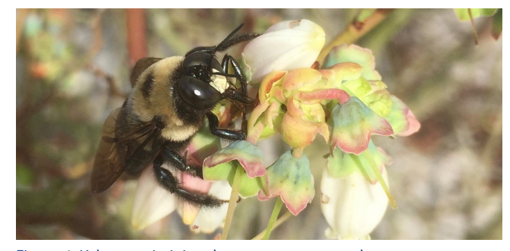
Figure 4. Xylocopa virginica , the eastern carpenter bee.

There are two species of large carpenter bees in Florida, Xylocopa virginica (black with yellow hairs) (Figure 4) and Xylocopa micans (all black or dark blue), both of which can be found on blueberry blossoms. These carpenter bees also resemble bumble bees but can be distinguished from them by their shiny, relatively hairless abdomens. They are solitary and nest above ground in wood tunnels that they excavate. Unlike bumble bees or the southeastern blueberry bee, carpenter bees are not particularly good pollinators for blueberries. Carpenter bees, like honey bees, rob nectar from blueberries by creating a slit in the petals, thereby avoiding contact with the flower's reproductive parts. However, studies have found that this behavior can still pollinate blueberry flowers (although to a lesser degree) (Sampson et al. 2004). Furthermore, these slits could encourage subsequent visits by honey bees, which additionally contribute to pollination, although again, to a lesser degree (Sampson et al. 2004).