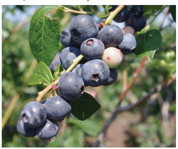
Figure 9. 'Springhigh'.

'Springhigh' (US Plant Patent 16,476) (Figure 9) was released by the University of Florida in 2004. It is somewhat popular as an earlier-ripening addition to mid-season cultivars such as 'Emerald' and 'Jewel', especially in central and south-central Florida. Fruit are large and have excellent flavor, but they have less waxy bloom, making them appear darker than average, and fruit are softer than most other commercial cultivars. The pack-out for 'Springhigh' has been reduced in some years because of a higher than average incidence of soft berries. Picking at frequent intervals during the harvest season is necessary to minimize the occurrence of soft fruit in packing and grading lines. Some packers may not accept 'Springhigh' fruit due to postharvest quality issues. Before planting 'Springhigh' growers should carefully evaluate the market potential for this cultivar.