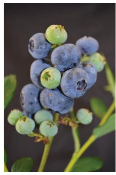
Figure 16. 'Indigocrisp'™. Credits: UF Blueberry Breeding Program

'Keecrisp'™ (US Patent 27,771) (Figure 17) is a mid- to late-season cultivar released by the University of Florida in 2016. It has an upright architecture and a high yield when it receives sufficient chilling, and it is best adapted to a hydrogen cyanamide management system. Leafing can be delayed, even with hydrogen cyanamide application. Berries are crisp with a small dry picking scar, although coloring at the stem end can be uneven. 'Keecrisp'™ has demonstrated suitability for machine harvesting for freshmarket production.