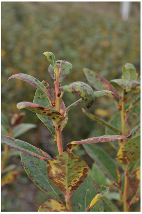
Figure 3. 'Jewel' showing symptoms of rust leaf spot disease.

'Jewel' fruit are slightly smaller and softer than 'Emerald', but they are acceptable for commercial packing and shipping. Yield potential is high, and internal berry quality is very good, although berries tend to remain tart until fully ripe. 'Jewel' is considered a mid-season cultivar for Florida. 'Jewel' typically flowers around February 16 in north-central Florida. The first commercial harvest date is usually before April 10, and harvest is typically finished by May 12.