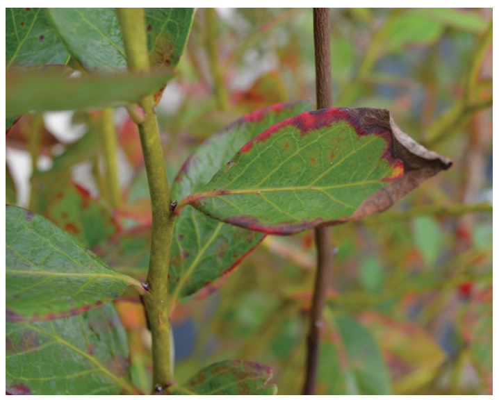
Figure 23. 'Star' showing symptoms of bacterial leaf scorch.