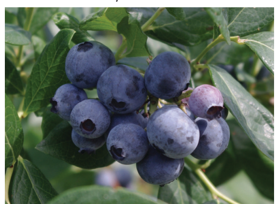
Figure 10. 'Snowchaser'.

the season when berry prices are typically high. Thus, very early season production is the main objective when growing this cultivar. 'Snowchaser' produces medium-sized fruit with excellent flavor and good postharvest characteristics. Its field survival is considered marginal because of its susceptibility to stem blight. Snowchaser has been grown by producers in South Florida with varying levels of success. It can be grown in an evergreen system in the right climate, but fruit could be too early for the Florida market window.