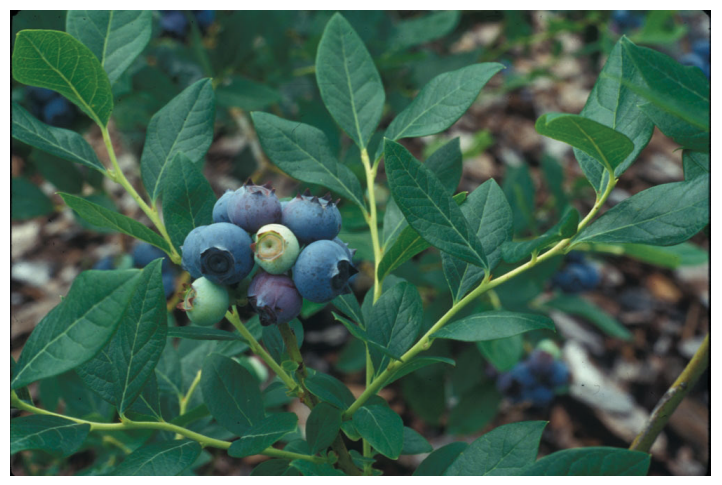
Figure 22. 'Star'.

Xylella fastidiosa and its apparent susceptibility to blueberry necrotic ring blotch virus (Figure 24). Due to marginal yields and a high incidence of bacterial leaf scorch, 'Star' is no longer recommended for new plantings in Florida.