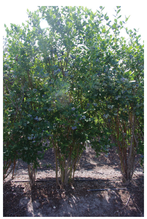
Figure 6. 'Meadowlark'™ has an upright growth habit.

'Meadowlark'<sup>TM</sup> has greater than average susceptibility to bacterial leaf scorch ( Xylella fastidiosa ), which is observed more frequently in areas prone to flooding and has resulted in a decline of some plantings in Florida.