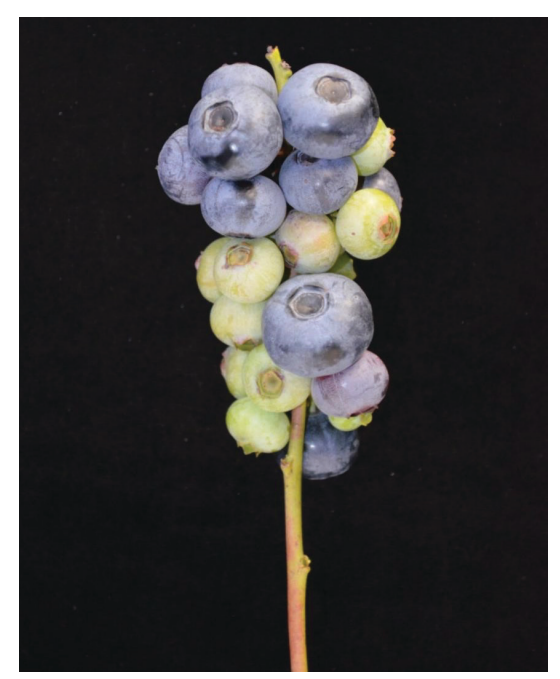
Figure 18. 'Patrecia'.