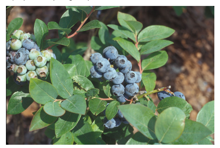
Figure 2. 'Jewel'.

'Jewel' (US Plant Patent 11,807) (Figure 2) was released from the University of Florida breeding program in 1998, and it is often planted in combination with 'Emerald' in central and north-central Florida. The plant is upright, vigorous, high-yielding, and survives well in commercial fields. However, 'Jewel' is highly susceptible to blueberry rust leaf spot (Figure 3), and a thorough summer spray program is usually necessary to prevent early fall defoliation. Under low chilling conditions, 'Jewel' is susceptible to injury from hydrogen cyanamide.