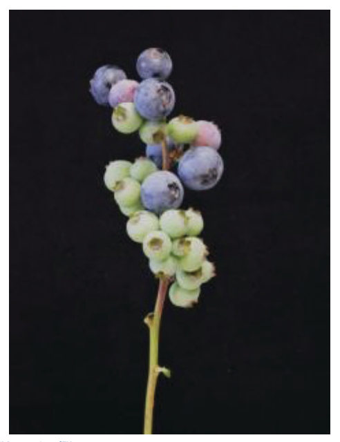
Figure 17. 'Keecrisp'™. Credits: UF Blueberry Breeding Program

'Keecrisp'™ (US Patent 27,771) (Figure 17) is a mid- to late-season cultivar released by the University of Florida in 2016. It has an upright architecture and a high yield when it receives sufficient chilling, and it is best adapted to a hydrogen cyanamide management system. Leafing can be delayed, even with hydrogen cyanamide application. Berries are crisp with a small dry picking scar, although coloring at the stem end can be uneven. 'Keecrisp'™ has demonstrated suitability for machine harvesting for freshmarket production.