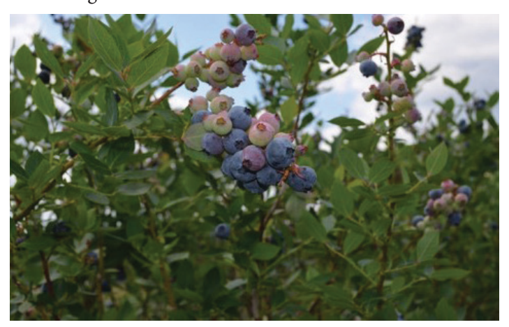
Figure 14. 'Avanti'™. Credits: UF Blueberry Breeding Program

'Avanti'™ (US Patent 26,312) (Figure 14) is a very early-ripening cultivar with a very low chill requirement, released by the University of Florida in 2015. Yield potential in an evergreen system is above average. The fruit are firm and high quality with a small dry picking scar, although fruit can be smaller than some other cultivars, particularly late in the season. Susceptibility to Botrytis fruit rot and bacterial wilt has been reported, and research into the susceptibility of 'Avanti'™ to bacterial wilt is ongoing. Mite, thrips, and gall midge infestations have also been reported. Early bloom may require longer periods of freeze protection in certain regions.