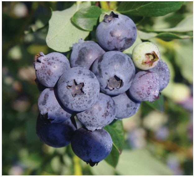
Figure 4. 'Farthing'.

'Farthing' is best adapted for planting in north-central and central Florida.