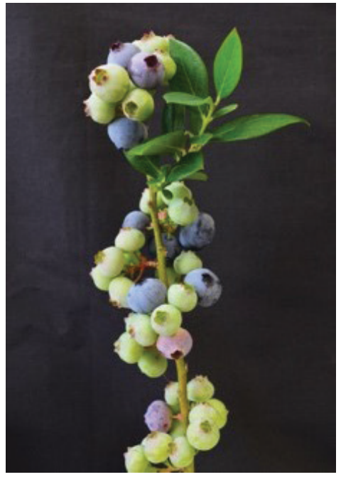
Figure 15. 'Endura'™. Credits: UF Blueberry Breeding Program

Due to somewhat higher chilling requirements, 'Indigocrisp' ^{\text{TM}} appears best adapted to regions with chilling similar to or greater than Gainesville, Florida.