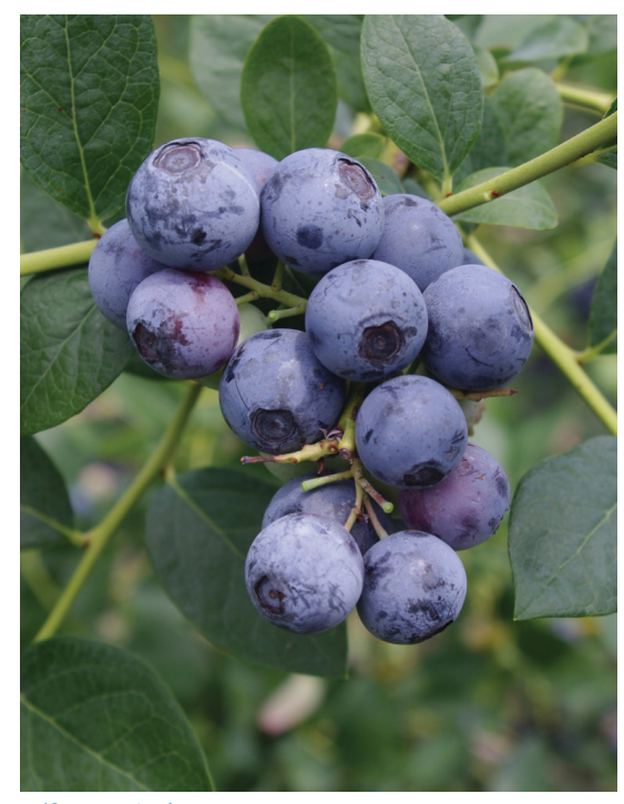
Figure 12. 'Sweetcrisp'.