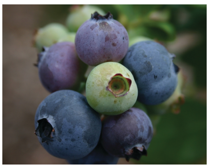
Figure 11. 'Primadonna'.

'Sweetcrisp' has a relatively high chilling requirement and is best adapted from Gainesville north into southeast Georgia.