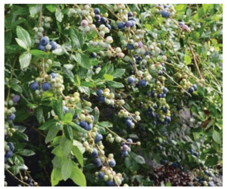
Figure 20. 'Optimus'.

'Wayne' (FL06-354) (Figure 21) is an early-maturing cultivar with high yields. Fruit is similar to 'Jewel' but firmer on average with earlier production—two weeks earlier than 'Jewel' when no hydrogen cyanamide is used. 'Wayne' has similar yield potential as 'Jewel'. Low doses