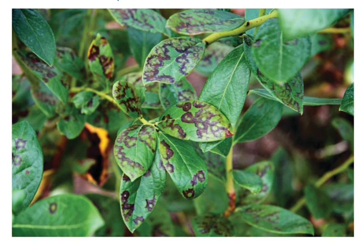
Figure 24. 'Star' showing symptoms of necrotic ring blotch.