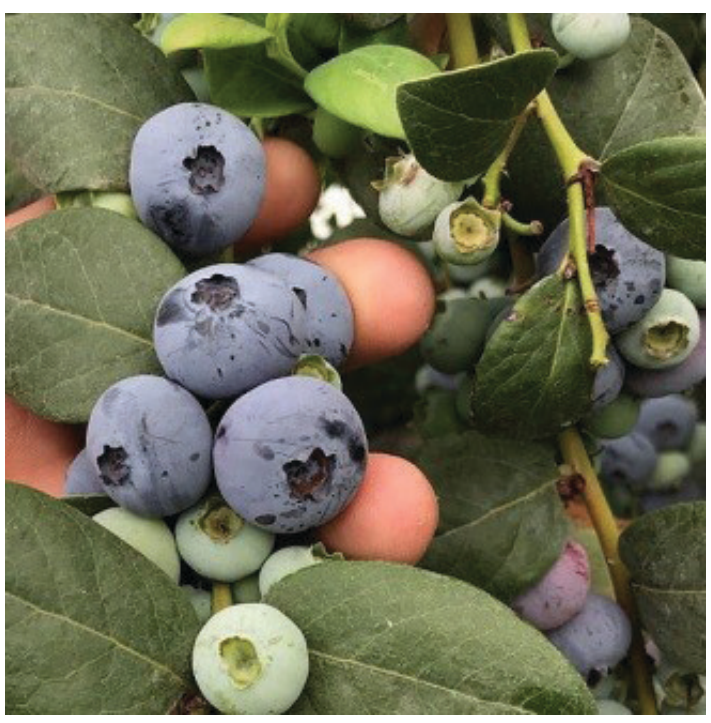
Figure 19. 'Magnus'. Credits: UF Blueberry Breeding Program

'Optimus' has produced well across all of Florida, with the best production in north Florida.