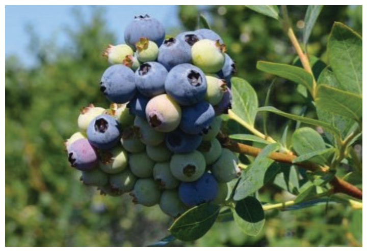
Figure 21. 'Wayne'.

Due to somewhat higher chilling requirements, 'Wayne' may be best adapted to the north-central Florida region; additional field data in central and south-central Florida is being collected.