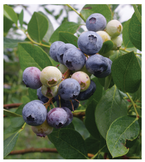
Figure 27. 'Scintilla'.

'Scintilla' (US Plant Patent 19,233) (Figure 27) was released by the University of Florida in 2007. It is a vigorous, semi-upright plant that produces a medium yield of large berries with excellent color, scar, firmness, and flavor. The berries are in loose clusters and easily harvested by hand. 'Scintilla' has a longer fruit development period, as it typically blooms before 'Star', while its harvest is considered mid-season in Florida. 'Scintilla' appears to have above-average susceptibility to Phytophthora root rot, leaf spots, and anthracnose, and its long-term field survival has been below average in numerous situations. 'Scintilla' is not widely grown in Florida.