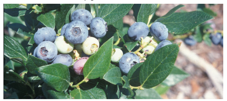
Figure 26. 'Windsor'.

'Star', and the berries are firm and have excellent flavor. Although 'Windsor' grows and fruits well, it has lost favor among growers because of the deep picking scar that can tear at harvest, which can increase packing costs and reduce postharvest fruit quality. There have been reports of greater-than-average susceptibility of 'Windsor' to hydrogen cyanamide injury. Because of these limitations, 'Windsor' is not widely grown in Florida.