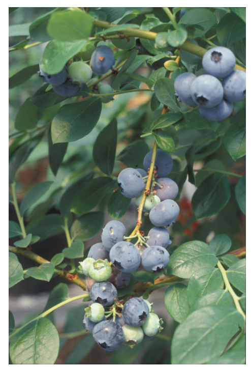
Figure 1. 'Emerald'.

'Emerald' is best adapted for planting in north-central and central Florida.