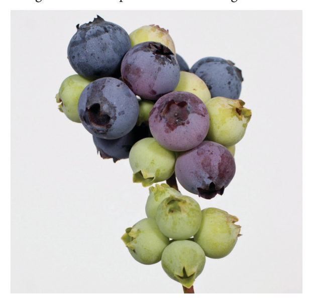
Figure 8. 'Chickadee'™.

'Chickadee'™ (US Plant Patent 21,376) (Figure 8) was released by the University of Florida in 2009. 'Chickadee'™ is a very early-ripening cultivar with a very low chilling requirement. The plant is upright with stout stems and twigs and has a narrow, almost monopodial base. Due to a weak root system, plants are prone to uprooting from either heavy ice loads during freeze protection or from strong storms. 'Chickadee'™ does not respond well to heavy pruning. The mean date of 50% open flowers in Windsor, Florida, is January 28, and the mean date of 50% ripe berries is April 15. The early bloom requires overhead freeze protection in most areas of Florida. Berries are large and sweet with low acidity and have a firm to semi-crisp texture. Berry quality is maintained on the bush for longer than most other cultivars grown in Florida. Yield potential has been only medium on 'Chickadee'™, but its low chill requirement and early maturity may find use in central Florida. The bush architecture, fruit firmness, and ability to hold fruit on the bush suggest potential for machine harvesting, but more experience and testing is needed.