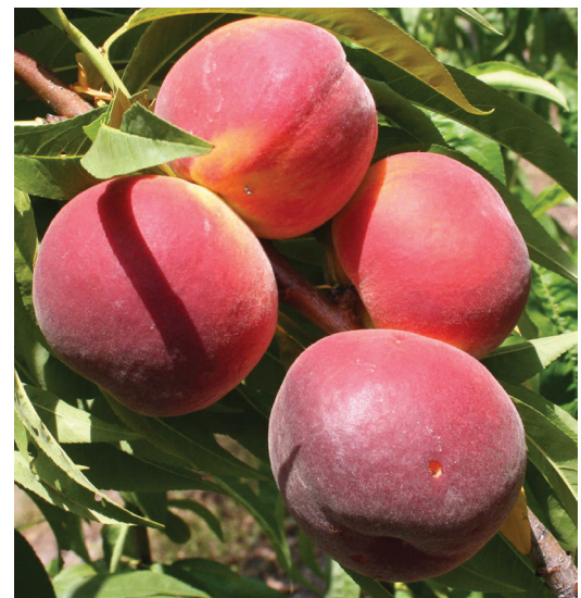
Figure 16. ‘UFBest’

‘UFBest’ released by the UF breeding program in 2012, this non-melting-flesh cultivar produces heavy annual crops of large fruit. ‘UFBest’ fruit develop 95–100% red skin over a yellow ground color, and the flesh is yellow with clingstone pits. ‘UFBest’ ripens 1 week earlier than ‘UFSun’ (mid-April) in Gainesville, Florida, with an FDP of 85 days (Figure 16).