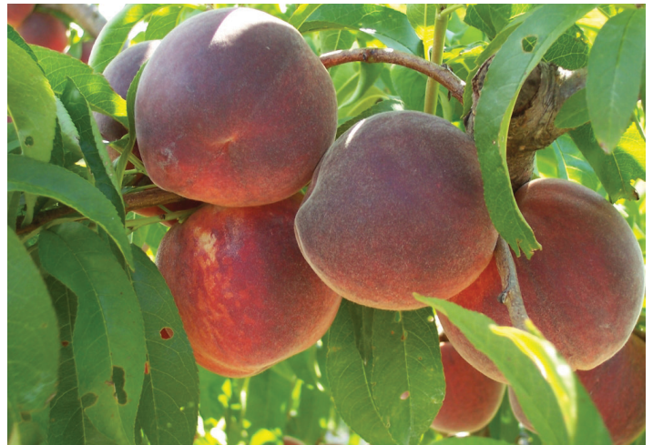
Figure 8. 'Gulfcrimson'

'Gulfcrimson' is the third in a series of cultivars released and patented by the joint UF, UGA, and USDA-ARS stone fruit breeding program, specifically in 2009 (Krewer et al. 2008). 'Gulfcrimson' fruit is large for an early-ripening cultivar and have a yellow ground color with 80–90% red skin. 'Gulfcrimson' ripens with the standard peach cultivar 'JuneGold' in Attapulgus, Georgia, with an FDP of 95 days and highly consistent cropping, making it a good mid-season replacement for 'JuneGold'. It also crops reliably in north Florida (Figure 8).