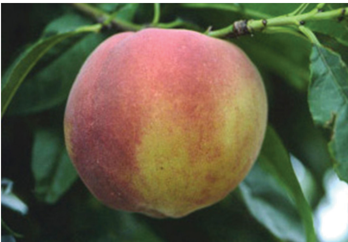
Figure 34. 'UFGold'

'UFGold' is a non-melting, yellow-flesh clingstone peach released by UF in 1996. 'UFGold' trees bear heavy annual crops of large fruit. Fruit are symmetrical in shape and develop 70–90% blush over an orange-yellow ground color. 'UFGold' fruit ripen approximately 80 days after bloom, in early May (Gainesville, FL) (Figure 34).