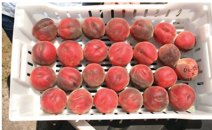
Figure 18. ‘UFGem’

‘UFGem’ was released in 2013 and is a good candidate for the northern part of central Florida. It is a commercial cultivar with near 100% blush, average fruit size of 2.5-inch diameter, and symmetrical fruit shape. It is a clingstone peach with non-melting, yellow flesh, and firm texture. The average FDP is 83 days and sets fruit well when minimum nighttime temperatures are above 57°F (14°C) (Figure 18).