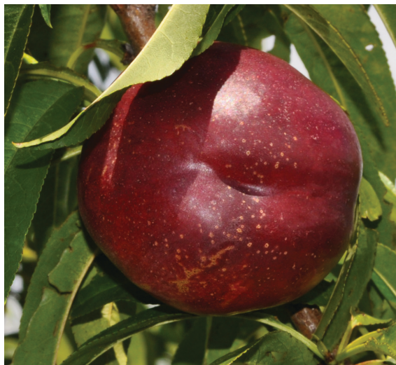
Figure 12. ‘Sunbest’

‘Sunbest’, released in 2001, is a patented nectarine cultivar with yellow, melting flesh, and a semi-freestone pit. It develops 90–100% bright red blush over a yellow ground color, and has a FDP of 85–90 days. ‘Sunbest’ ripens in early May (Gainesville, FL), about 3 days before the standard ‘Sunraycer’ nectarine cultivar. It is superior to and a good replacement for ‘Sunraycer’ nectarine (Figure 12).