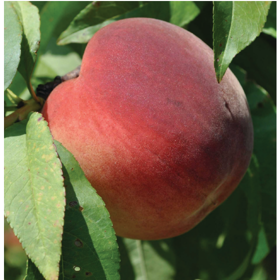
Figure 35. 'TropicSnow'

'TropicSnow' was jointly released by UF and Texas A&M in 1989. Its fruit has white, melting-flesh, semi-freestone pits. 'TropicSnow' fruit develop 40–50% red blush over a creamy white background and have very low acid combined with excellent sweetness. 'TropicSnow' has an FDP of 90–97 days (Figure 35).