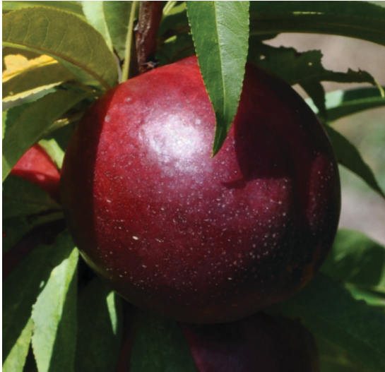
Figure 29. ‘Sunbest’

‘Sunbest’ is a patented melting-flesh nectarine cultivar released in 2001. ‘Sunbest’ trees are semi-upright and vigorous, responding well to open-center pruning systems. ‘Sunbest’ fruit develop 90–100% bright red blush over a yellow ground color, are semi-freestone, and resist bacterial spot well. ‘Sunbest’ is intended as a replacement for ‘Sunraycer’ nectarine because of its larger and more attractive fruit. ‘Sunbest’ has an FDP of 85–90 days, and fruit ripens approximately 3 days before ‘Sunraycer’ nectarine and ‘Flordaglo’ peach in Gainesville, FL (Figure 29).