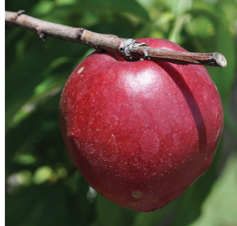
Figure 31. ‘Suncoast’

‘Suncoast’ is a non-patented melting-flesh nectarine cultivar released in 1995. ‘Suncoast’ trees are vigorous and semi-spreading. Fruit of ‘Suncoast’ have yellow flesh, develop 80–90% red blush over a yellow ground color, and are semi-clingstone. ‘Suncoast’ fruit are slightly oblong with no sharp tips or bulges and tend to be tart. ‘Suncoast’ leaves and fruit are resistant to bacterial spot. The FDP of ‘Suncoast’ fruit is 77 days, and fruit ripens in late April to early May in Gainesville, FL (Figure 31).