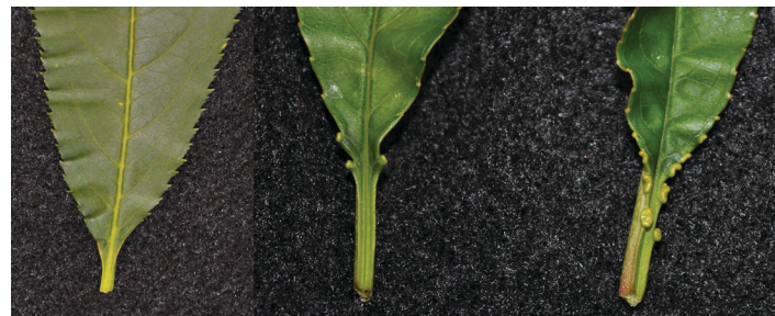
Figure 3. Eglandular (a), globose (b) and reniform (c) leaf glands on peach leaves.