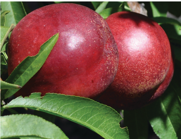
Figure 30. ‘Sunmist’

‘Sunmist’ is a patented melting-flesh nectarine cultivar released in 1994. ‘Sunmist’ trees are highly vigorous and have a spreading growth habit. Fruit of ‘Sunmist’ have white flesh, are semi-freestone, and are large for an early ripening cultivar. Fruit develop nearly 100% red blush and are uniformly symmetrical. ‘Sunmist’ trees and fruit are highly resistant to bacterial spot. The FDP is 85 days, and the fruit ripens in early May in Gainesville, FL (Figure 30).