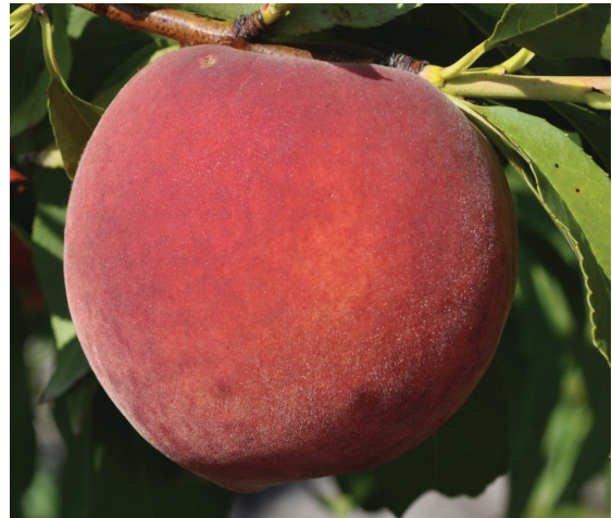
Figure 24. 'UFSharp'

'UFSharp' is a patented, non-melting-flesh clingstone peach cultivar that was released in 2006. 'UFSharp' trees are vigorous, semi-spreading in nature, and productive. 'UFSharp' fruit develop 60% red blush over a deep yellow to orange ground color. 'UFSharp' has reliable cropping with excellent fruit size, shape, and firmness, and an FDP of 105 days (Figure 24).