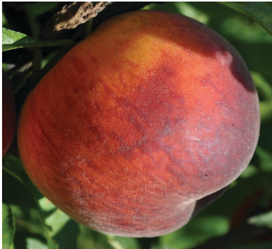
Figure 22. 'UFBlaze'

'UFBlaze' is a non-melting-flesh, clingstone peach cultivar released in 2002. Trees are highly vigorous, with a semi-spreading nature. 'UFBlaze' trees produce heavy annual crops of large, early ripening, attractive fruit with bright red skin over 80–90% of a bright yellow-orange background and yellow flesh. Fruit are uniform and symmetrical, and they ripen about 7 to 10 days after 'UFGold' in early to mid May in Gainesville, Florida with an FDP of 83 days (Figure 22).