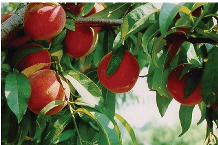
Figure 26. 'Gulfprince'

'Gulfprince' was jointly released by the University of Florida, University of Georgia, and USDA-ARS in 2002. Trees of 'Gulfprince' are large and vigorous with a spreading growth habit. 'Gulfprince' fruit are uniform and symmetrical and develop 45–55% solid red skin. Fruit have non-melting, yellow flesh with clingstone pits. 'Gulfprince' fruit has exhibited some slight browning due to oxidation on soft, ripe fruit. The FDP is 110 days (Figure 26).