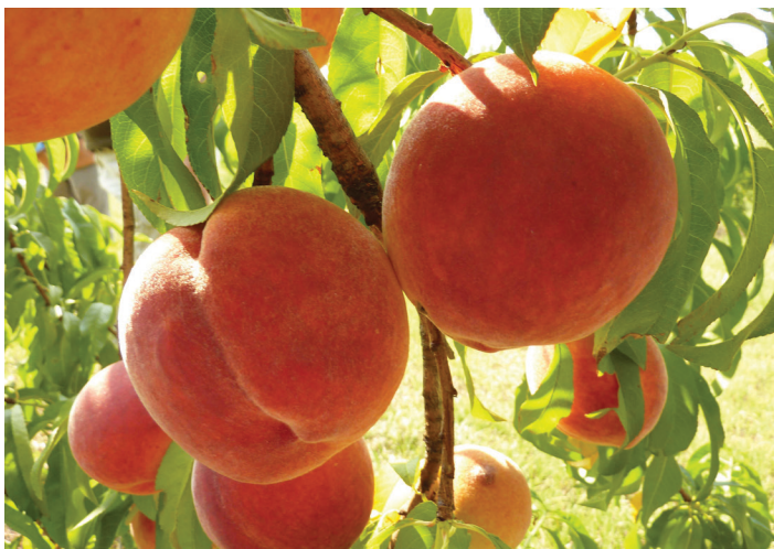
Figure 10. ‘GulfAtlas’

‘GulfAtlas’ is a 2014 release from the UF, UGA, and the USDA ARS joint breeding program. It is a late season variety, with an FDP of 120 days. The fruit has non-melting flesh with a clingstone pit and bright yellow flesh. Fruit is very large and round and ripens about 3 weeks after ‘Gulfcrimson’. Ripe fruit has a 75% blush, with some red pigmentation in the flesh under the skin. Trees are vigorous and semi-spreading with few blind nodes and good fruit set. ‘GulfAtlas’ is adapted to an area south of Attapulgus, GA, to Gainesville, FL (Figure 10).