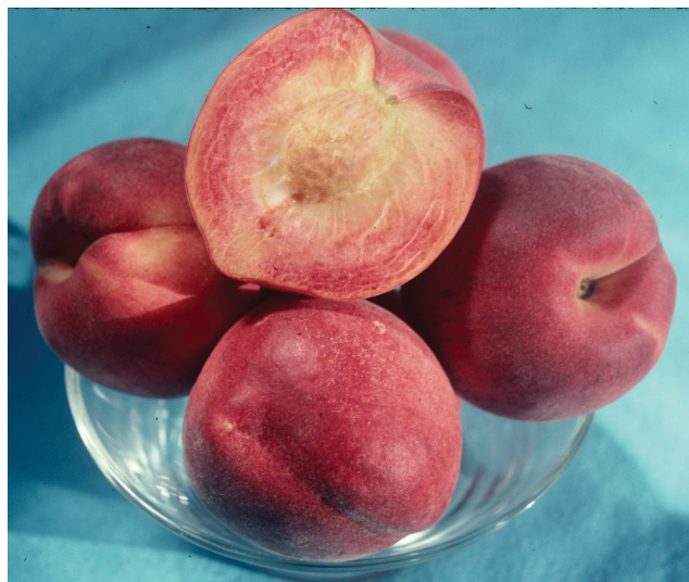
Figure 11. ‘Gulfcrest’

‘Gulfcrest’ is a 2004 release from the UF, UGA and the USDA-ARS joint breeding program. It has an FDP of 62–75 days and has non-melting flesh with a clingstone pit. Ripe ‘Gulfcrest’ fruit have 90–95% red color over a deep yellow to orange ground color and ripen in early to mid-May in southern Georgia. ‘Gulfcrest’ fruit can be variable in size on the tree and can produce “twiggy” branch growth. ‘Gulfcrest’ is adapted to extreme northern Florida and southern Georgia (Figure 11).