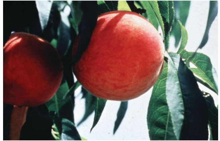
Figure 23. 'Flordadawn'

'Flordadawn' is a melting-flesh non-patented peach cultivar released in 1989. 'Flordadawn' trees are vigorous and produce large numbers of flowers with moderately high fruit set. The bloom period of 'Flordadawn' is extended, which can help with fruit set during early spring frosts. The FDP of 'Flordadawn' is 60 days, which is the shortest of any named peach variety. Fruit of 'Flordadawn' develop 80% red blush and have yellow flesh with a semi-clingstone pit. However, light crop loads have resulted in as much as 50% split pit incidence. 'Flordadawn' can often be found in large stores and nurseries for backyard plantings (Figure 23).