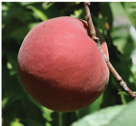
Figure 19. ‘UFBeauty’

‘UFBeauty’ is a peach cultivar released in 2002 with fruit that has non-melting-flesh, clingstone pits, and very symmetrical shape. The flesh of ‘UFBeauty’ fruit is yellow and very firm, and the skin color is near 100% red, with darker red stripes. ‘UFBeauty’ ripens 3 to 4 days after ‘UFGold’ in Gainesville, Florida, with an FDP of 82 days. Cropping of ‘UFBeauty’ has been unreliable in south Florida when night temperatures during the bloom period are higher than 57°F (14°C) (Figure 19).