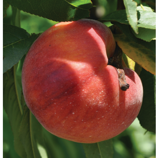
Figure 15. ‘UFSun’

‘UFSun’ fruit ripens with that of the standard peach cultivar ‘Flordaprince’ at Immokalee and Gainesville, Florida with an FDP of 80 days (Figure 15).