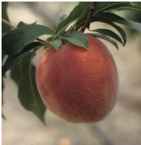
Figure 25. 'Flordacrest'