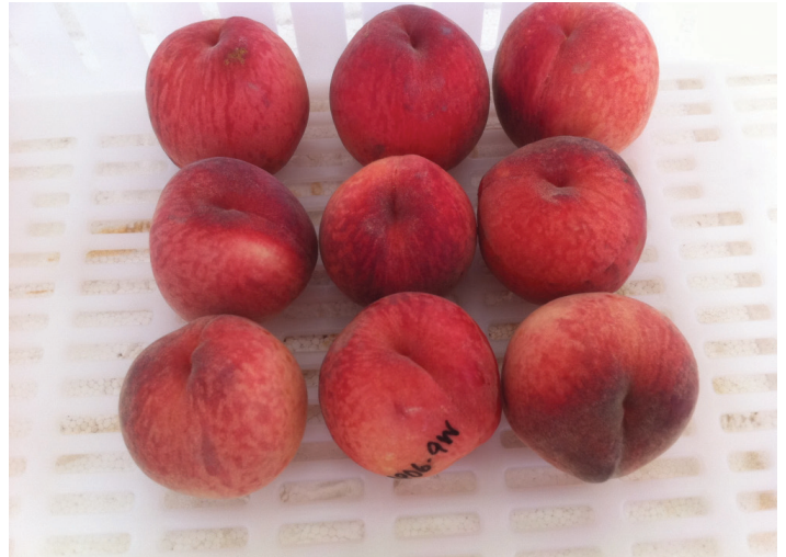
Figure 7. 'Gulfsnow'

a 50–60% blush over a cream background. The fruit is clingstone, with medium-sized, red pits and have an FDP of 110 days (Figure 7).