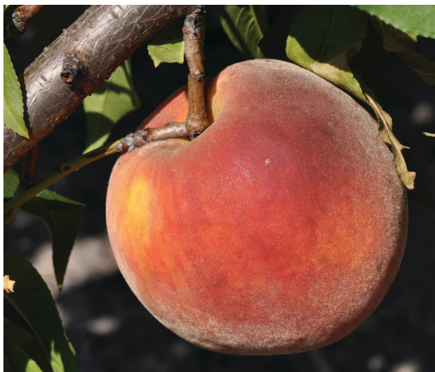
Figure 17. ‘TropicBeauty’

‘TropicBeauty’ ripens between ‘UFSun’ and ‘UFOne’ and has an FDP of 89 days (Figure 17).