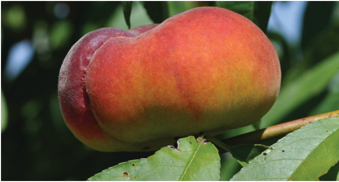
Figure 5. 'UFO'

FDP of 95 days. The skin develops 50–70% blush. This cultivar is particularly susceptible to ethylene that is released during dormant pruning, which can result in significant flower bud abortion. Thus, pruning is only recommended during the summer period (Figure 5).