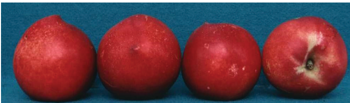
Figure 14. ‘UFQueen’

‘UFQueen’ is a regular bearer of early, large fruit in north central Florida, with an FDP of 95 days. ‘UFQueen’ trees are semi-upright and are easily pruned to an open vase system. The fruit has non-melting flesh with clingstone pits and yellow flesh color. The fruit is slightly oval with a slight tip and develops 80–100% red skin over a yellow background. ‘UFQueen’ fruit ripens about 1 week after the standard ‘Sunraycer’ nectarine cultivar in mid-May in Gainesville, Florida (Figure 14).