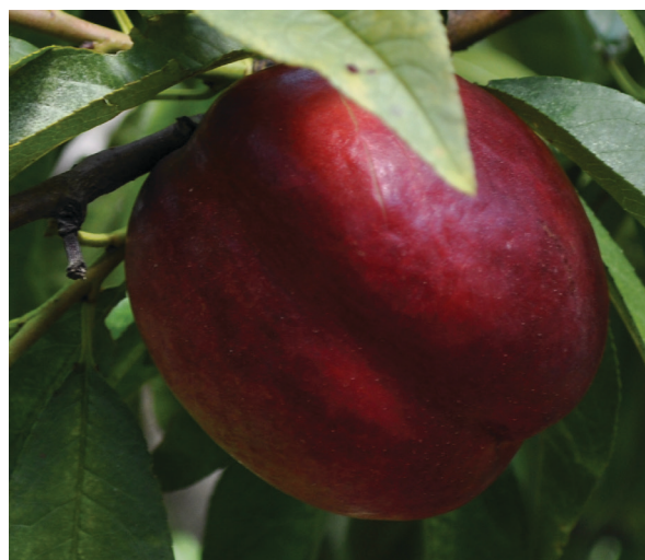
Figure 28. 'Sunraycer'

'Sunraycer' is a non-patented melting-flesh nectarine cultivar released in 1993. Trees are vigorous and semi-spreading, responding well to open-center pruning systems. 'Sunraycer' produces large, semi-clingstone fruit with good firmness resistance to bacterial spot. 'Sunraycer' fruit develop 80–100% brilliant red blush over a bright yellow ground color and are oval with no sharp tips or suture bulges. 'Sunraycer' has an 85-day FDP and ripens in early May in Gainesville, Florida (Figure 28).