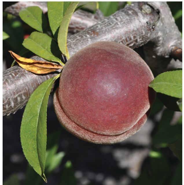
Figure 4. ‘Flordabest’

‘Flordabest’ was released and patented in 2009 and has a FDP of 82 days from fruit set to harvest. The fruit develop 90–100% blush, making them very attractive. The fruit is large, and have melting, but uniformly firm yellow flesh, and semi-clingstone pits. The fruit ripens about 7–10 days earlier than the standard peach cultivar ‘TropicBeauty’ in Gainesville, Florida. It is recommended for trial in Gainesville and south to Interstate 4 (Figure 4).