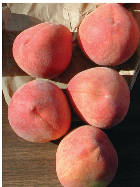
Figure 27. 'Flordaking'

fruit is high incidence of split pits when crop loads are low (Figure 27).