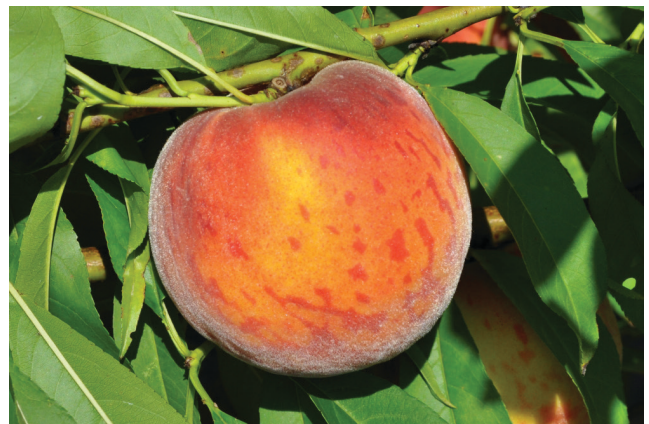
Figure 32. ‘Flordaprince’

‘Flordaprince’ was released by UF in 1982 and its fruit has melting flesh. It has been a standard low-chill peach cultivar worldwide and is one of the earliest ripening. The fruit develops 80% red blush with dark red stripes over a yellow ground color. ‘Flordaprince’ fruit are large, uniformly firm, and yellow, with semi-clingstone pits. The fruit ripens about 7–10 days earlier than ‘TropicBeauty’ in Gainesville, Florida, with an FDP of 78 days (Figure 32).