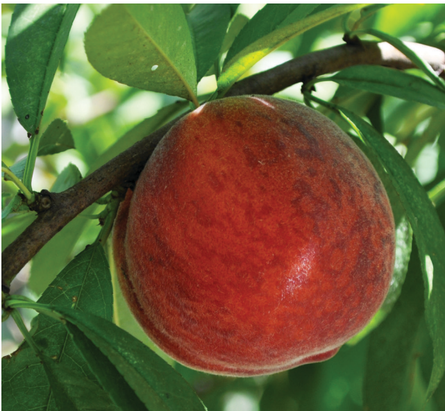
Figure 6. 'Gulfking'

'Gulfking' is a non-melting-flesh cultivar that was released and patented by the joint UF, UGA, and USDA-ARS breeding program in 2004 (Krewer et al. 2005). The fruit has exceptional color, with 80–90% red skin with stripes over a deep yellow ground color. The fruit is very firm with yellow flesh and is clingstone. The FDP is 77 days, and the fruit develops good size, shape, and color in north Florida (Figure 6).