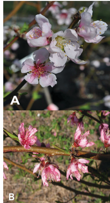
Figure 2. Showy (a) and non-showy (b) peach flowers.

vigorous (e.g., ‘Sunbest’) in canopy growth. Flowers on certain peach cultivars can be showy , with large, pink petals; flowers on other cultivars are non-showy , with smaller, redder petals (Figure 2). Leaf glands at the base of the leaf near the petiole can also be used in the identification process. Leaf glands may be absent ( eglandular ), or they may be globose (round) or reniform (kidney-shaped) (Figure 3).