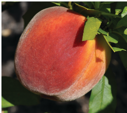
Figure 20. ‘UFOne’

‘UFOne’ is a non-melting-flesh cultivar released by UF in 2008. ‘UFOne’ fruit is medium-large, and the trees regularly bear large crops of marketable fruit. ‘UFOne’ fruit is very firm with yellow flesh and semi-clingstone pits and develop 40% red blush over a yellow ground color. ‘UFOne’ fruit has a fairly long FDP of 95 days and ripen with ‘UFBeauty’ (early May) in Gainesville, Florida (Figure 20).