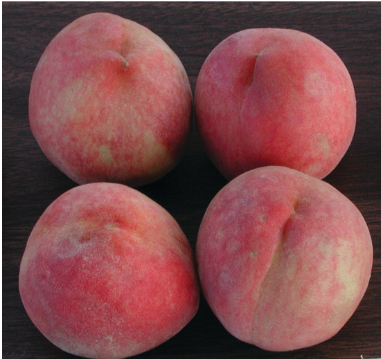
Figure 33. 'Flordaglo'

'Flordaglo' is a melting-flesh cultivar released by UF in 1988. The fruit develops 50–60% red blush with stripes, over a white ground color. 'Flordaglo' fruit are early ripening, semi-clingstone, and are bacterial spot resistant. Fruit ripens in early May, approximately 78 days after full bloom. 'Flordaglo' fruit is ideal for backyard or u-pick operations due to the melting flesh texture and its tendency to show bruises and abrasions easily (Figure 33).