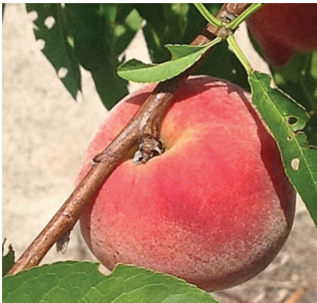
Figure 9. ‘UFGlo’

cultivar ‘Flordaking’ does well, and it complements ‘UFSharp’ peaches in north central Florida. It produces consistent crops with good yields in north Florida (Figure 9).