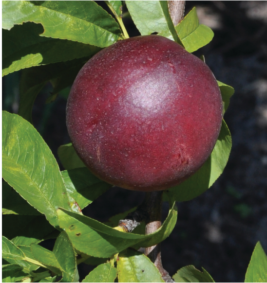
Figure 13. ‘UFRoyal’

‘UFRoyal’ is a yellow flesh, non-melting nectarine, with an FDP of 85 days. ‘UFRoyal’ fruit is large, with 100% red skin, and a semi-clingstone pit. Fruit are symmetrically oval and ripen approximately 1 week before ‘UFQueen’ (below) in early May (Gainesville, FL). ‘UFRoyal’ fruit have excellent firmness and flavor, with excellent shipping potential (Figure 13).