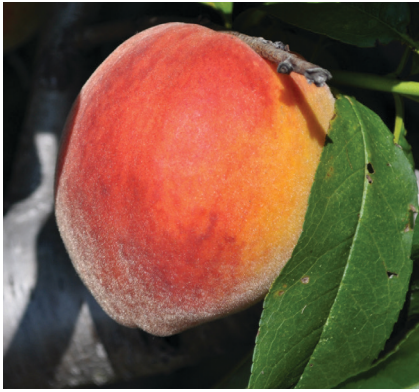
Figure 21. 'UF2000'