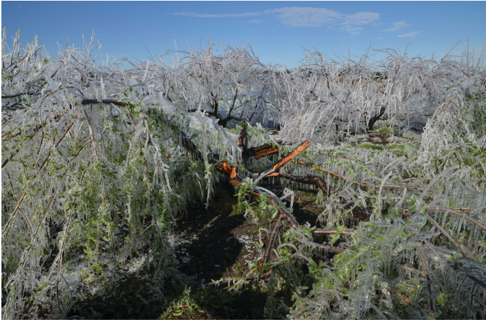
Figure 12. Freeze protection with over-head irrigation, showing bent and split limbs from ice load.

investment in large wells with diesel power, which is more reliable than electric power. A more thorough discussion of freeze protection can be found in Protecting Blueberries from Freezes in Florida at http://edis.ifas.ufl.edu/HS216 .