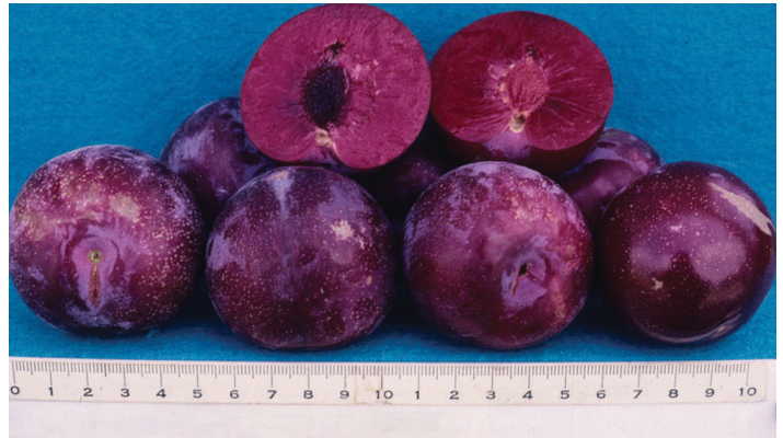
Figure 8. 'Gulfrose' fruit showing flesh color and pit freestone.

'Gulfruby' originated at the University of Florida breeding program but was not released by the university because of its susceptibility to bacterial canker. It was first propagated along with 'Gulfgold' in 1982 by Grand Island Nursery in Umatilla, Florida. It is not patented and is, therefore, a public variety. Bacterial canker readily occurs on leaves and small twigs of 'Gulfruby' and is aggravated by frequent summer rains. Generally, the tree may survive from 5 to 8 years and provide several crops of early ripening plums. Fruit are medium in size, up to 2 inches in diameter, and are round in shape (Figure 9). The flesh is sweet, yellow in color with a greenish tinge, and adheres to the small pit at soft ripe. Skin color is red to purple with sour characteristics. Fruit will hang on the tree 3–5 days after full red skin color develops and will ripen 7 to 10 days before 'Gulfblaze'. The tree is not as vigorous nor does it possess as much of the strong upright shooting tendencies of 'Gulfbeauty'. 'Gulfruby' has more problems with bacterial canker than the other low chill cultivars recommended for trial. It can cause cankers on the wood and significant leaf damage leading to defoliation, which can result in sunburn on the fruit due to leaf loss.