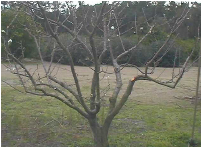
Figure 11. Pruned tree with some center limbs removed, reduced height, and lower limbs removed.