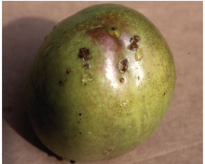
Figure 16. Multiple cuts for egg laying.