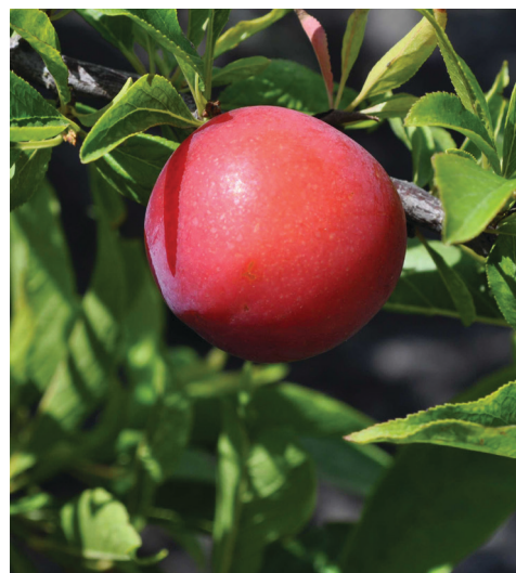
Figure 5. Young ‘Gulfblaze’ fruit. Credits: M. Olmstead, UF/IFAS

‘ Gulfblaze ’ was released and patented by the University of Florida (Figure 5). Fruit ripen in the middle of the Florida plum season. The chilling requirement for ‘Gulfblaze’ is about 250 hours. Bloom and cross-pollination occur with all other ‘Gulf’ series plums. Fruit set is good with flowers formed on spurs and the previous season’s shoots. Fruit are very firm, average in size (1 ⅞ to 2 in. in diameter), and weigh 70 to 80 grams. Fruit is round and semi-freestone with flesh weakly attached to the pit when ripe. Fruit color is dark red to purple and the flesh is orange, sweet, and sub-acid (Figure 6). The skin is sour, although overall fruit quality is good. Fruit ripen 8 to 14 days after ‘Gulfbeauty’ with a fruit developmental period of 95 days. Bloom, pollination, fruit set, and ripening characteristics are the same as for ‘Gulfbeauty’. The leaves, stems, and fruit have similar resistance to bacterial canker and plum leaf scald as ‘Gulfbeauty’.