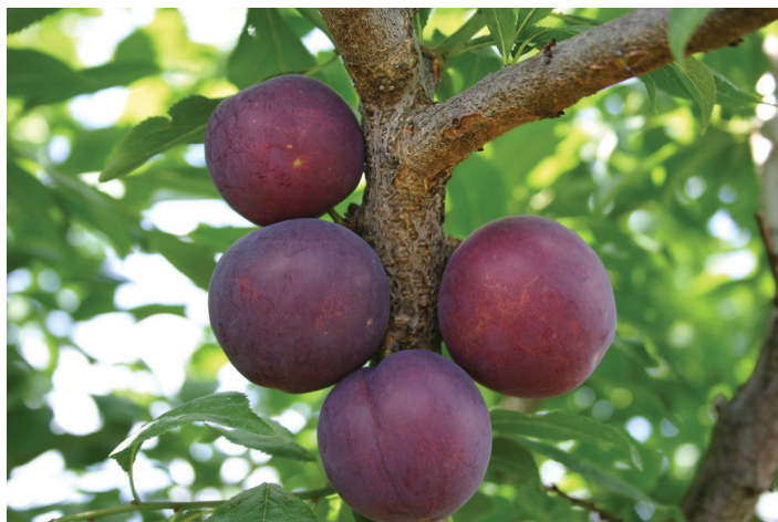
Figure 3. ‘Gulfbeauty’ before final ripening color.

‘ Gulfbeauty ’ was released in 1998 and patented by the University of Florida. Its chilling requirement is about 225 hours. Fruit color is dark reddish purple, and the flesh is yellow with a green hue (Figure 3). The skin is sour, which is common in Japanese plums, but the flesh is sweet, sub-acid, and firm when ripe. The fruit is clingstone and clings to the stone even when soft ripe. Fruit are round and medium-sized (1¾ in. in diameter), and weigh from 55 to 70 grams. Bloom and cross-pollination occur with all other ‘Gulf’ series plums. Fruit set is good with flowers formed on spurs and the previous season’s shoots. ‘Gulfbeauty’ is the earliest plum to ripen from the University of Florida breeding program, with a fruit developmental period of 75 days.