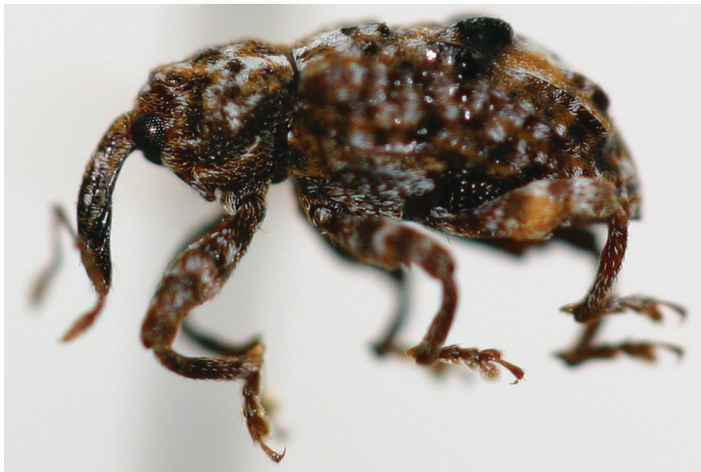
Figure 13. Adult female plum curculio.