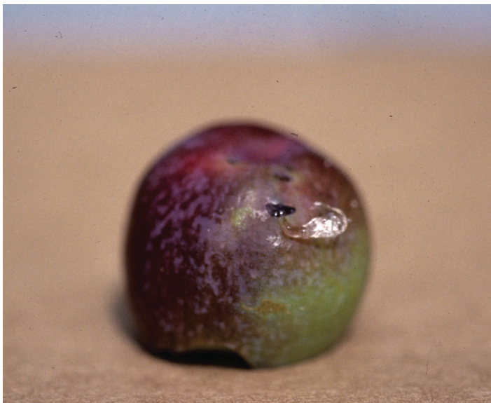
Figure 14. Half-moon cut on fallen fruit with gummosis.