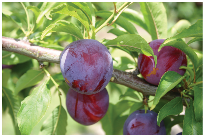
Figure 9. 'Gulfruby' fruit.

'Gulfruby' originated at the University of Florida breeding program but was not released by the university because of its susceptibility to bacterial canker. It was first propagated along with 'Gulfgold' in 1982 by Grand Island Nursery in Umatilla, Florida. It is not patented and is, therefore, a public variety. Bacterial canker readily occurs on leaves and small twigs of 'Gulfruby' and is aggravated by frequent summer rains. Generally, the tree may survive from 5 to 8 years and provide several crops of early ripening plums. Fruit are medium in size, up to 2 inches in diameter, and are round in shape (Figure 9). The flesh is sweet, yellow in color with a greenish tinge, and adheres to the small pit at soft ripe. Skin color is red to purple with sour characteristics. Fruit will hang on the tree 3–5 days after full red skin color develops and will ripen 7 to 10 days before 'Gulfblaze'. The tree is not as vigorous nor does it possess as much of the strong upright shooting tendencies of 'Gulfbeauty'. 'Gulfruby' has more problems with bacterial canker than the other low chill cultivars recommended for trial. It can cause cankers on the wood and significant leaf damage leading to defoliation, which can result in sunburn on the fruit due to leaf loss.