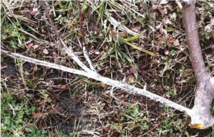
Figure 18. Heavy population of white peach scale. Notice the snow-like appearance.

in diameter, with a dark center dot. This insect can be debilitating to plums. The best control is the use of dormant spray oil during the winter months, as discussed in the San Jose scale section.