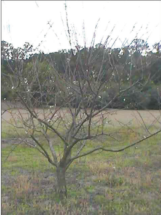
Figure 10. Unpruned tree showing cluttered center, unrestricted height, and low hanging limbs.

may be subject to “late drop”, sometimes called “June drop” in northern climates, which results in fruit aborting from the tree. This occurs due to incomplete pollination, and thus no seed forms.