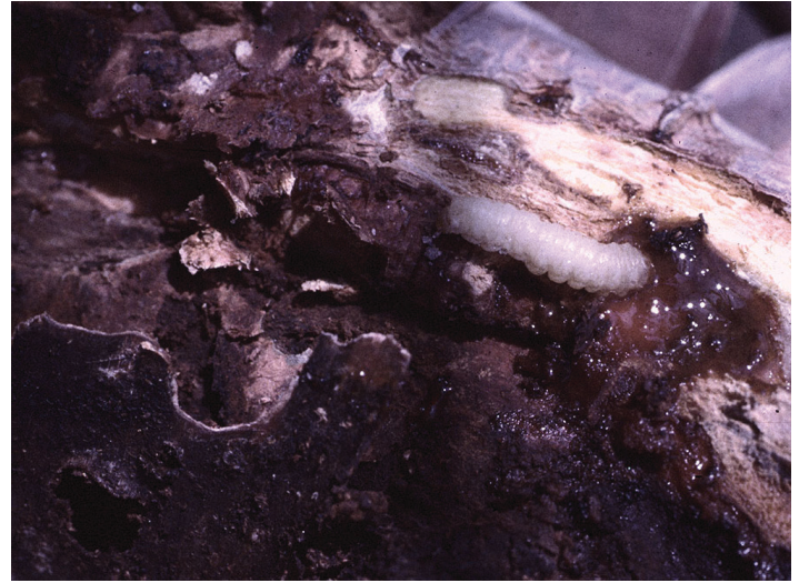
Figure 19. Lesser Peach Tree Borer with tunnels and gummosis containing frass.

recommendations can be found in Insect Management in Peaches at https://edis.ifas.ufl.edu/pdffiles/IG/IG07500.pdf or the Southeastern Peach, Nectarine and Plum Pest Management and Culture Guide ( https://secure.caes.uga.edu/extension/publications/files/pdf/B%201171_10.PDF ).