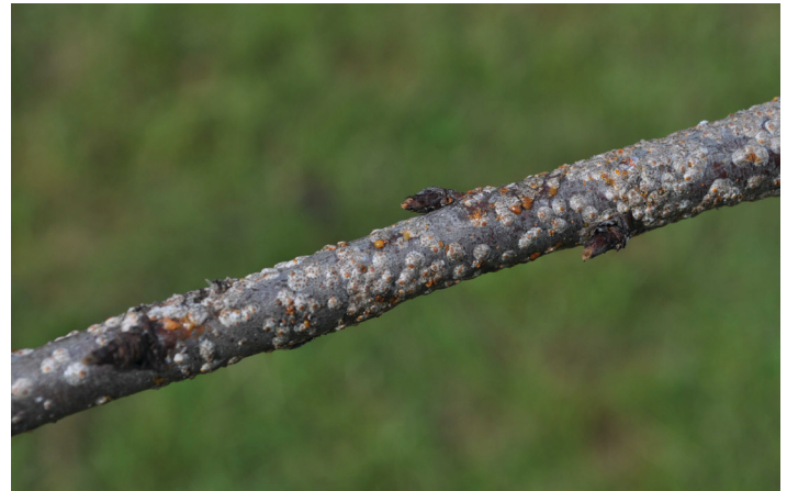
Figure 17. San Jose scale on the bark with exposed red coloration where the female has probed and is feeding in the cambium.

even when first established. The best method of spraying is to use a hand gun at 300–500 psi and thoroughly soak all areas of the tree. The spray should penetrate into crevices of the bark and be applied to runoff. Air blast sprayers are often used in large orchards, but it is important to have windless conditions, slow ground speeds (125–150 gal/acre), large nozzles, and good spray patterns. Oil applications should not be made if the night temperatures will fall below 28°F during the succeeding 4-day period. Similarly, oil should not be applied if day temperatures will exceed 85°F. Oil spreads and applies easiest when temperatures are above 60°F. Apply oil when rainfall is unlikely for the next 24 hours.