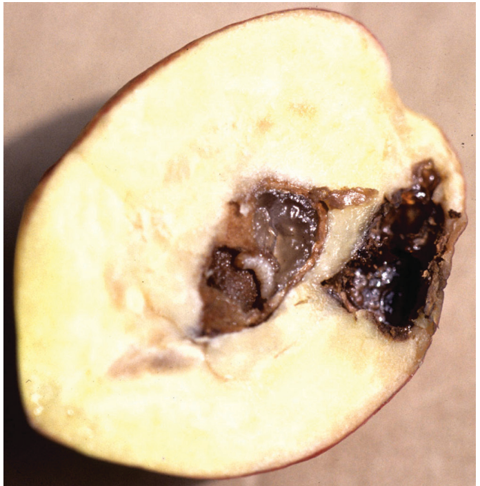
Figure 15. Curculio larvae eating the embryo. Rotting at the point of entry, with gummosis.

Generally, plum curculio has the potential to eliminate the entire crop of plums. The female will make a cut on the small plum fruit and deposit an egg in the flesh. The cut is crescent-shaped and heals over, forming a light brownish scar within 12 hours (Figure 14). The egg rapidly hatches and the small, whitish worm eats its way toward the pit of the fruit. If the pit or stone has not hardened but is still soft, the worm will enter the gelatinous material of the seed's embryo and feed (Figure 15). The small plum will then turn reddish and drop from the tree. If the worm did not reach the seed before pit hardening, it will tunnel around the pit and then emerge. The tunnel will hold brown frass and the injury will increase chances of the fruit ripening prematurely and rotting. When the worm exits the fruit, it will pupate in the ground and emerge as an adult in as soon as 60 days and continue the cycle. Worms of succeeding generations can continue the cycle in harvested fruit rendering it unsaleable (Figure 16).