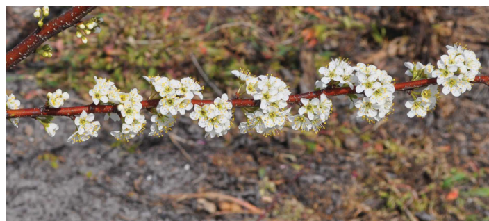
Figure 2. Plum bloom.

The ‘Gulf’ series plums, like most Japanese plums, are not self-fruitful and require cross-pollination for fruit set (Figure 2). Generally, any cultivar will be pollinated by a different cultivar as long as their bloom period overlaps and pollinating insects, such as honey bees, are active. The two species of native plums, P. angustifolia (Chickasaw plum) and P. umbellata (hog plum) or their hybrids can serve as pollinators, but they usually bloom earlier than the ‘Gulf’ series and their fruit quality is poor. Trees for pollination are planted in a ratio of 1 pollinator for every 5–8 cropping trees. Cropping ability in the ‘Gulf’ plums is very high and fruit thinning must be done in order to obtain large fruit and keep limbs from breaking. Fruiting occurs both on spurs and along the previous season’s shoots. These plums are precocious, often fruiting in the second year after planting.