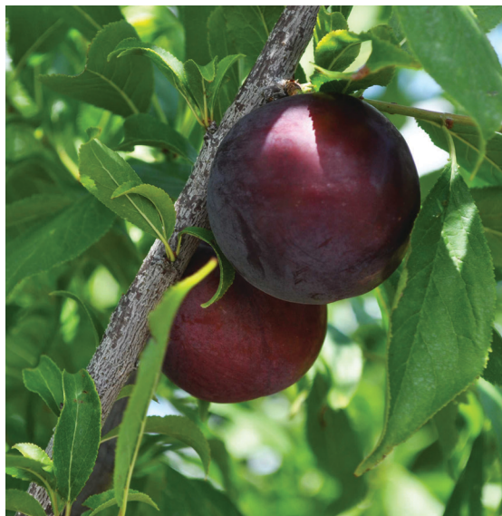
Figure 4. ‘Gulfbeauty’ showing ripening color.

Ripening occurs about 5 days before ‘Gulfruby’ and about 8–12 days before ‘Gulfblaze.’ As the fruit approach full ripe, their color becomes noticeably darker (Figure 4). Ripe fruit will hang on the tree for 7–10 days. Quality is good, especially for an early ripening plum. During its season, no other fresh plums are available. Trees are vigorous with tall upright shoots and semi-spreading. In the absence of freezing conditions, thinning is required to obtain adequate size and prevent limb breakage. Trees are very resistant to bacterial canker and moderately resistant to plum leaf scald.