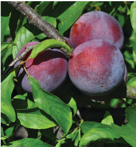
Figure 7. Young 'Gulfrose' fruit.

'Gulfrose' is also patented by the University of Florida and ripens about one week later than 'Gulfblaze', with a fruit developmental period of 95 days (Figure 7). The chilling requirement is about 275 hours. The fruit are nearly round, semi-freestone, average in size (1 7/8 to 2 in. in diameter), and weigh 70 to 80 grams. The skin is dark reddish purple, and the flesh is blood red in color (Figure 8). Fruit quality is high with good firmness and shelf life. The fruit have a sweet, aromatic flesh and a moderately sour skin. There is no bitter aftertaste common in other blood plums such as 'Mariposa'. Bloom, pollination, fruit set, and ripening qualities are the same as for those of 'Gulfbeauty'. Trees are moderately vigorous, semi-spreading, and precocious, bearing the second year after planting. 'Gulfrose' has similar resistance to bacterial canker as 'Gulfbeauty'; however, it is less tolerant to plum leaf scald than 'Gulfblaze' with similar susceptibility to 'Gulfgold', limiting tree longevity.