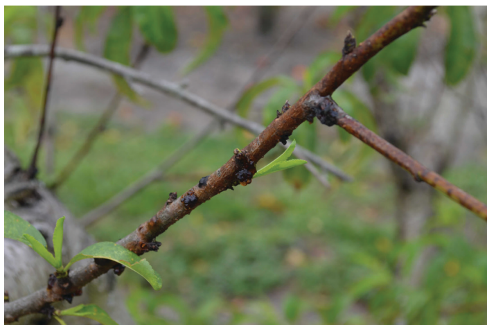
Figure 20. Gummosis on peach caused by Botryosphaeria dothedia .

Fungal gummosis is caused by Botryosphaeria spp. and is a fungal disease that causes gummosis on the trunk and major limbs (Figure 20). This disease can be minimized by maintaining good sanitation. Remove all fruit at harvest and remove all pruning wood from the orchard environment because this organism can sporulate from decaying plant tissue. For more information on fungal gummosis in peach, see Fungal Gummosis in Peach at http://edis.ifas.ufl.edu/pdffiles/HS/HS126500.pdf .