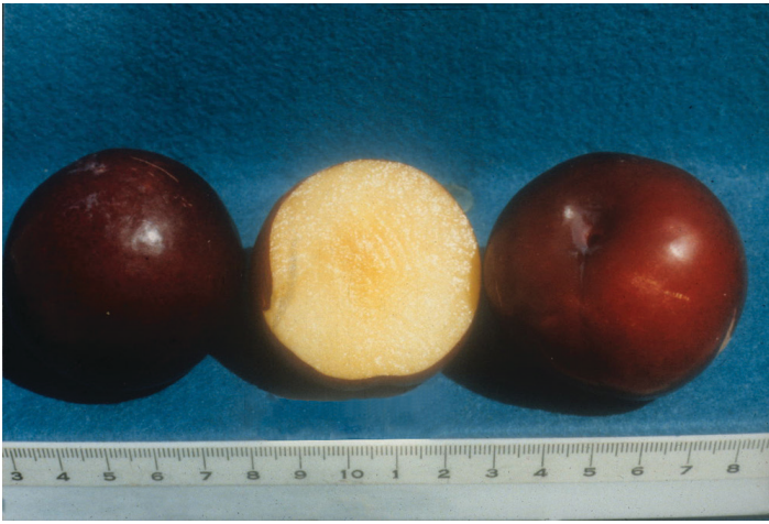
Figure 6. 'Gulfblaze' fruit showing flesh color. Scale in centimeters.

'Gulfrose' is also patented by the University of Florida and ripens about one week later than 'Gulfblaze', with a fruit developmental period of 95 days (Figure 7). The chilling requirement is about 275 hours. The fruit are nearly round, semi-freestone, average in size (1 7/8 to 2 in. in diameter), and weigh 70 to 80 grams. The skin is dark reddish purple, and the flesh is blood red in color (Figure 8). Fruit quality is high with good firmness and shelf life. The fruit have a sweet, aromatic flesh and a moderately sour skin. There is no bitter aftertaste common in other blood plums such as 'Mariposa'. Bloom, pollination, fruit set, and ripening qualities are the same as for those of 'Gulfbeauty'. Trees are moderately vigorous, semi-spreading, and precocious, bearing the second year after planting. 'Gulfrose' has similar resistance to bacterial canker as 'Gulfbeauty'; however, it is less tolerant to plum leaf scald than 'Gulfblaze' with similar susceptibility to 'Gulfgold', limiting tree longevity.