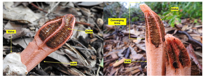
Figure 4. Lysurus mokusin (Lantern Stinkhorn) emerging from leaf litter. Left photo shows white volva; right photo shows pointed lantern shape of converging arms at the tip of the mushroom. This photo shows a specimen from Australia but the species has been introduced to the United States.

Lysurus mokusin in its egg stage is white in color and 0.4–1 inches (1–3 cm) in diameter. The stalk is spongy and hollow, and each mushroom can vary in color between white, pink, and red. The stalk is 4–6 inches (10–15 cm) tall and 0.6–1 inch (1.5–2.5 cm) wide. The stalk is indented by four to six grooves that run from the volva to the tip of the mushroom lengthwise. The stalk ends in an angular fusion of four to six arms that arise from the grooved indentations of the stalk in an apical lantern-like shape that is smooth and cylindrical at the tip (Gogoi and Parkash 2015). The converging arms of Lysurus mokusin contain a brown, slimy spore mass that smells like rotting flesh (Chen et al. 2014).