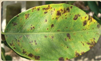
Young greasy spot lesions