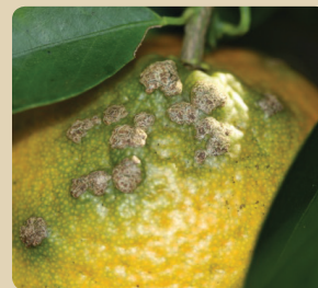
Corky or warty scab lesions on mature fruit