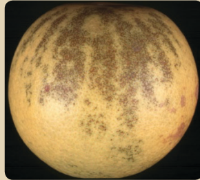
Greasy spot rind blotch on grapefruit