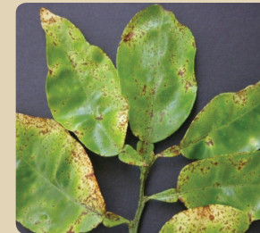
Early season Melanose