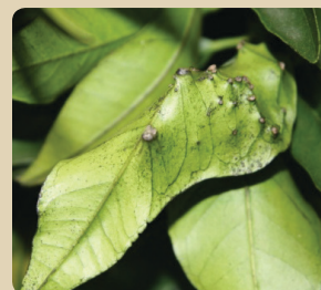
Late season scab lesions on leaves