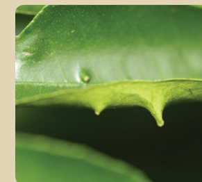
Young scab lesions forming finger-like structures on leaf