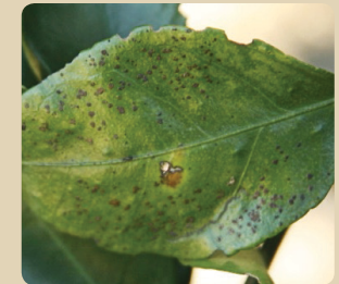
Late season Melanose