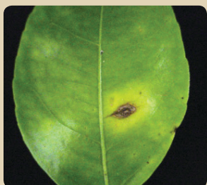
Young Alternaria lesion on leaf