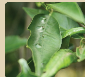
Late season scab lesion