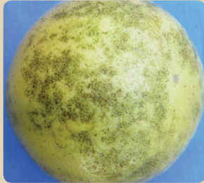
Greasy spot rind blotch on grapefruit