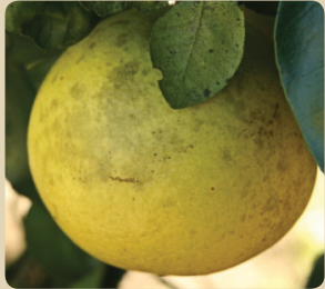
Early greasy spot rind blotch on grapefruit