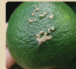
Scab lesions on immature fruit