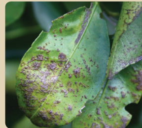
Late season Melanose