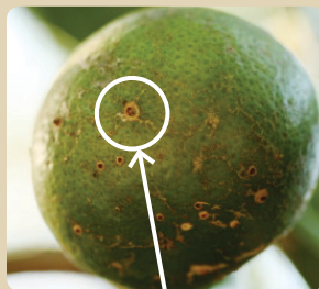
Alternaria lesions on immature fruit