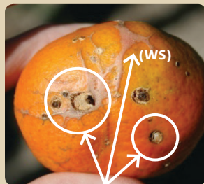
Alternaria lesions and wind scar (ws) on mature fruit. Note corky eruptions and craters