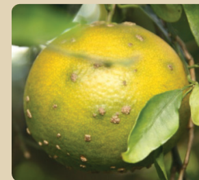
Scab lesions on mature fruit