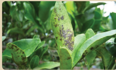
Older greasy spot lesions