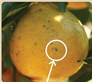
Alternaria lesions on mature fruit