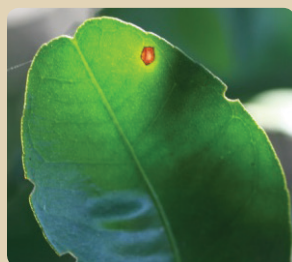
Late season Alternaria lesion on leaf