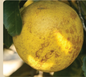
Tear stain Melanose