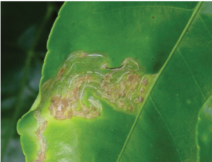
Figure 2. Canker lesions in leafminer galleries on upper side of leaf.