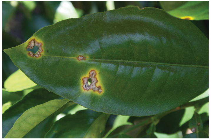
Figure 5. Old lesions of citrus canker displaying the shot hole effect.

Stem and Twig Lesions. Stem lesions often indicate infection has been present for at least a year. They serve as a reservoir for persistent inoculum and are able to produce inoculum for up to four years. When they occur on woody tissue, they are the same color as the branch but have a raised, wart-like surface (Figure 6a). Symptoms on twigs and fruit are similar and consist of dark brown or black raised corky lesions surrounded by oily or water-soaked margins. As the lesions mature, they appear scabby or corky (Figure 6b).