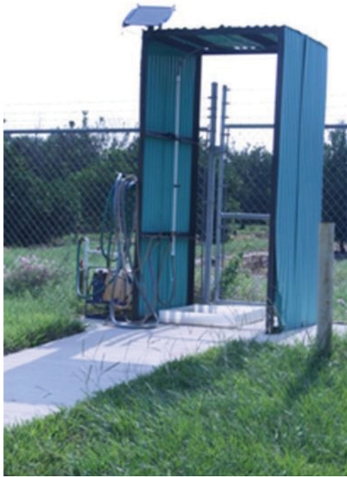
Figure 11a. Automatic personnel decontamination station.