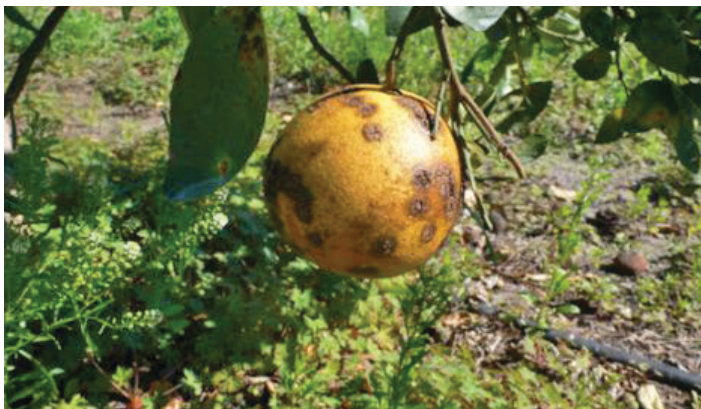
Figure 8. Old lesions of citrus canker on grapefruit.