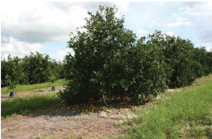
Figure 9. Fruit drop caused by severe canker outbreak.