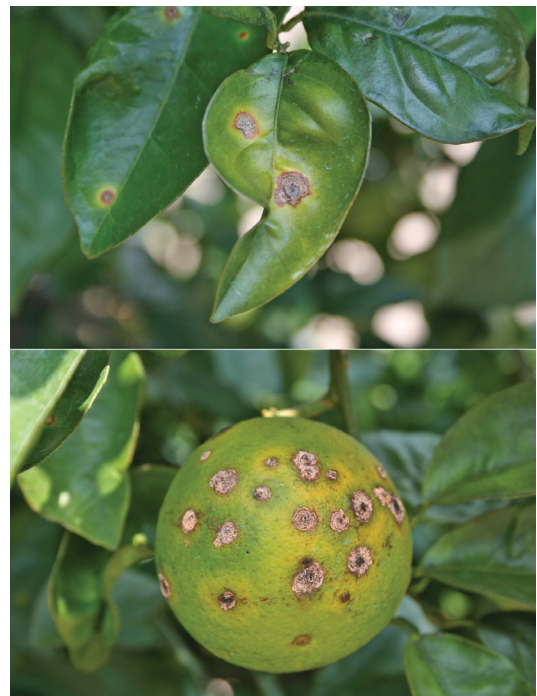
Figure 1. Necrotic canker lesions on grapefruit stems, leaves, and fruit.

the yellow halo is most prominent (Figure 4). As the lesions age, they turn tan to brown, and a water-soaked margin appears surrounded by a yellow ring or halo. The center of the lesion becomes raised and corky. The lesions are usually visible on both sides of the leaf. The leaf lesions sometimes fall out, leaving holes. This is known as the shot hole effect and is most common with old grapefruit lesions (Figure 5).