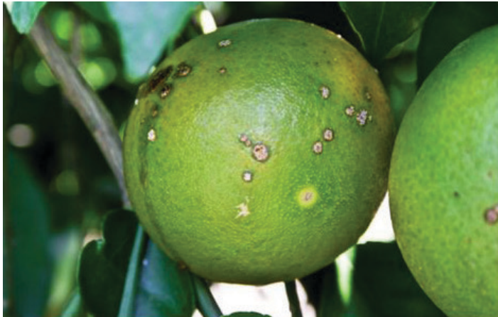
Figure 7. Young, blister-like canker lesions on fruit.

Fruit Lesions. Young lesions are raised, blister-like, tan, and can be surrounded by yellow halos, depending on fruit maturity (Figure 7). As lesions age, they become dark brown to black with brown to black sunken, corky centers, and they may have yellow halos (Figure 8). Old lesions often have a gray appearance. Generally, the lesions are circular and vary in size. Lesions cause blemishes and early fruit drop, thereby reducing fruit yield (Figure 9). The internal quality of the fruit is not affected.