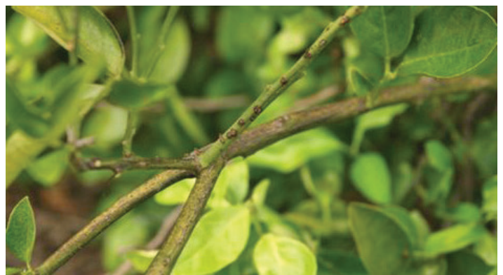
Figure 6b. Citrus canker lesions on young twig.