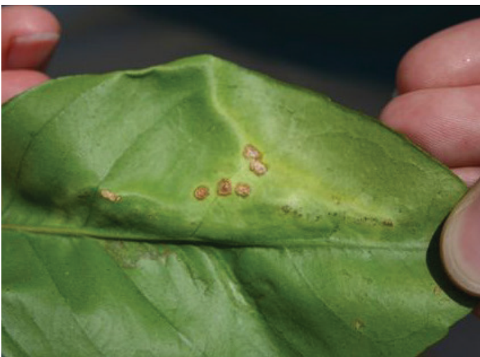
Figure 3. Young, blister-like lesions of citrus canker. Credits: UF/IFAS