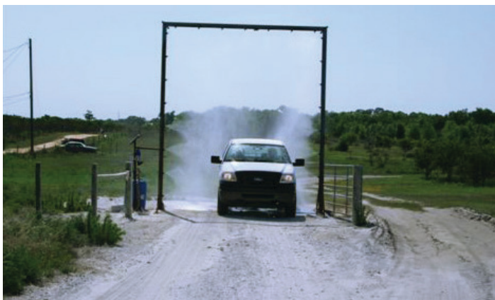
Figure 11b. Automatic vehicle and equipment decontamination station.

According to the Florida Department of Agriculture and Consumer Services citrus compliance agreements, decontamination training is required annually for grove workers and harvesters. Training can be scheduled through local UF/IFAS Extension offices. Personnel are required to decontaminate upon exiting a grove. The exception to this rule applies to harvesters. Harvesters are required to decontaminate upon entering and exiting a grove regardless of whether an infection is known to exist. State regulations require all vehicles and equipment exiting citrus groves to be decontaminated. A grove owner/caretaker may also require decontamination upon entering groves. If you suspect citrus canker, provide a digital photo to your local UF/IFAS Extension office or an Extension citrus agent for assistance with identification and management options. You may send a sample to the UF/IFAS Southwest Florida Research and Education Center Plant Disease Clinic in Immokalee, a branch of the Florida Plant Diagnostic Network.