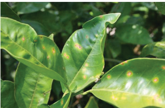
Figure 4. Young lesions of citrus canker with yellow halo.