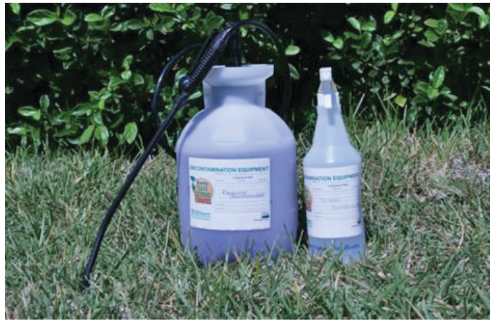
Figure 12. Types of spray bottles.

To decontaminate vehicles and equipment, a one-gallon garden sprayer is simple and lightweight for storage and transport. When applying, begin spraying at the top of the vehicle and/or equipment and move downward until the spray material is running off. Other areas to spray include, but are not limited to, the tops of tool boxes, tires, and wheel wells. Unless it is designated as a two-in-one solution, the decontamination solutions are intended for either personnel or equipment. Do not use the solution designated for equipment on your skin as it is harsher than the personal solution. Equipment decontamination solutions should be checked monthly for quaternary ammonium chloride (QAC) concentration to ensure effectiveness.