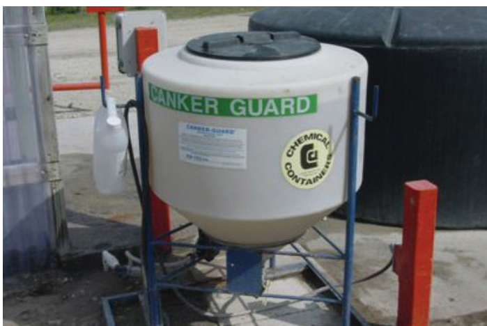
Figure 11c. Large tank used for storage of decontaminant for automatic systems.