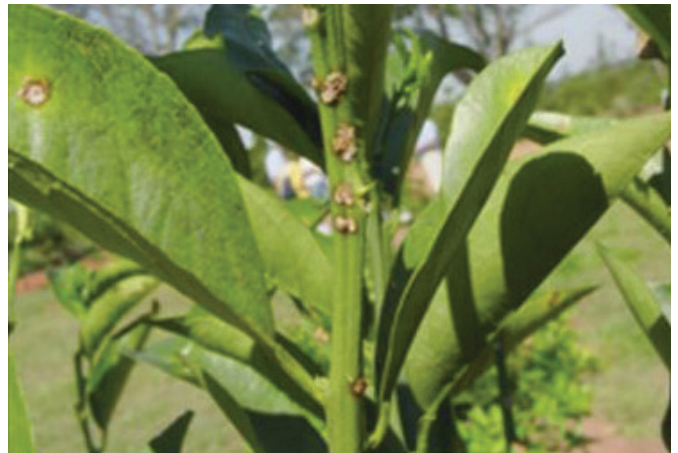
Figure 6a. Young lesions of citrus canker on young twig.

Stem and Twig Lesions. Stem lesions often indicate infection has been present for at least a year. They serve as a reservoir for persistent inoculum and are able to produce inoculum for up to four years. When they occur on woody tissue, they are the same color as the branch but have a raised, wart-like surface (Figure 6a). Symptoms on twigs and fruit are similar and consist of dark brown or black raised corky lesions surrounded by oily or water-soaked margins. As the lesions mature, they appear scabby or corky (Figure 6b).