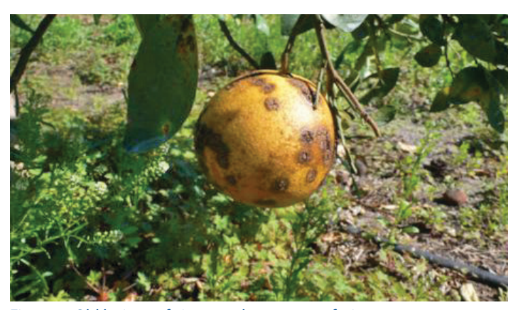
Figure 8. Old lesions of citrus canker on grapefruit.