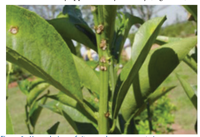
Figure 6a. Young lesions of citrus canker on young twig.

Stem and Twig Lesions. Stem lesions often indicate infection has been present for at least a year. They serve as a reservoir for persistent inoculum and are able to produce inoculum for up to four years. When they occur on woody tissue, they are the same color as the branch but have a raised, wart-like surface (Figure 6a). Symptoms on twigs and fruit are similar and consist of dark brown or black raised corky lesions surrounded by oily or water-soaked margins. As the lesions mature, they appear scabby or corky (Figure 6b).