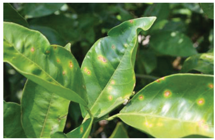
Figure 4. Young lesions of citrus canker with yellow halo.