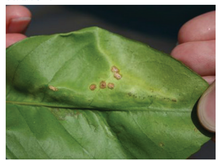
Figure 3. Young, blister-like lesions of citrus canker.