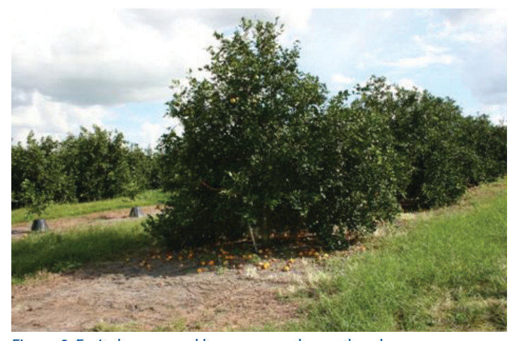
Figure 9. Fruit drop caused by severe canker outbreak.