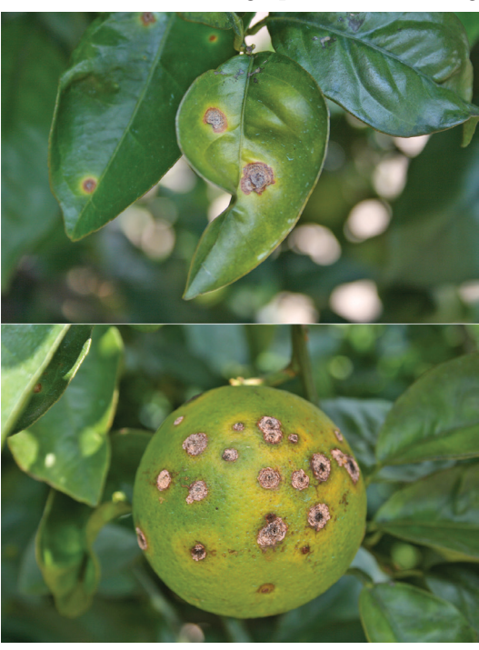
Figure 1. Necrotic canker lesions on grapefruit stems, leaves, and fruit.

the yellow halo is most prominent (Figure 4). As the lesions age, they turn tan to brown, and a water-soaked margin appears surrounded by a yellow ring or halo. The center of the lesion becomes raised and corky. The lesions are usually visible on both sides of the leaf. The leaf lesions sometimes fall out, leaving holes. This is known as the shot hole effect and is most common with old grapefruit lesions (Figure 5).