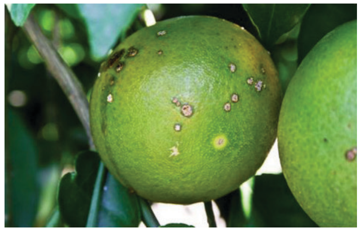
Figure 7. Young, blister-like canker lesions on fruit.

Fruit Lesions. Young lesions are raised, blister-like, tan, and can be surrounded by yellow halos, depending on fruit maturity (Figure 7). As lesions age, they become dark brown to black with brown to black sunken, corky centers, and they may have yellow halos (Figure 8). Old lesions often have a gray appearance. Generally, the lesions are circular and vary in size. Lesions cause blemishes and early fruit drop, thereby reducing fruit yield (Figure 9). The internal quality of the fruit is not affected.