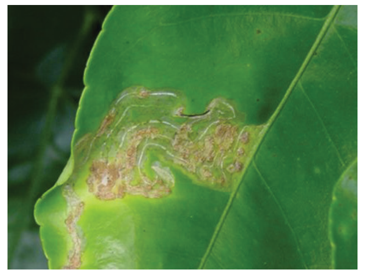
Figure 2. Canker lesions in leafminer galleries on upper side of leaf.