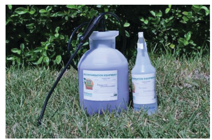
Figure 12. Types of spray bottles.

To decontaminate vehicles and equipment, a one-gallon garden sprayer is simple and lightweight for storage and transport. When applying, begin spraying at the top of the vehicle and/or equipment and move downward until the spray material is running off. Other areas to spray include, but are not limited to, the tops of tool boxes, tires, and wheel wells. Unless it is designated as a two-in-one solution, the decontamination solutions are intended for either personnel or equipment. Do not use the solution designated for equipment on your skin as it is harsher than the personal solution. Equipment decontamination solutions should be checked monthly for quaternary ammonium chloride (QAC) concentration to ensure effectiveness.