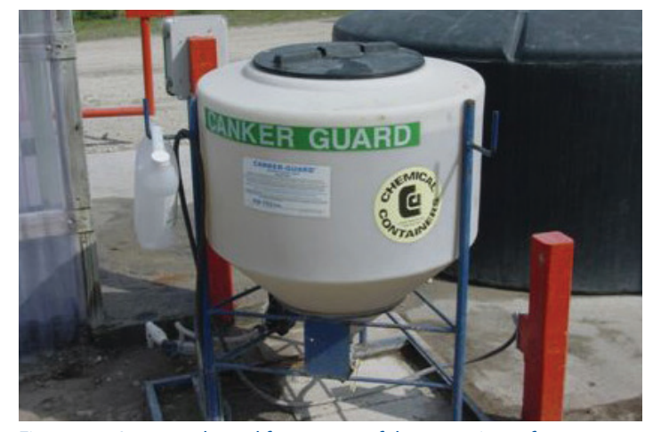
Figure 11c. Large tank used for storage of decontaminant for automatic systems.