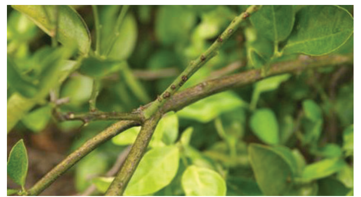
Figure 6b. Citrus canker lesions on young twig.