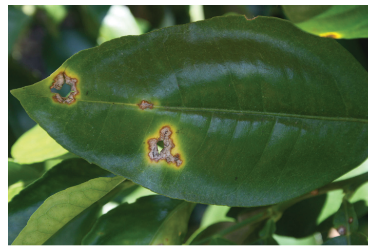
Figure 5. Old lesions of citrus canker displaying the shot hole effect.

Stem and Twig Lesions. Stem lesions often indicate infection has been present for at least a year. They serve as a reservoir for persistent inoculum and are able to produce inoculum for up to four years. When they occur on woody tissue, they are the same color as the branch but have a raised, wart-like surface (Figure 6a). Symptoms on twigs and fruit are similar and consist of dark brown or black raised corky lesions surrounded by oily or water-soaked margins. As the lesions mature, they appear scabby or corky (Figure 6b).