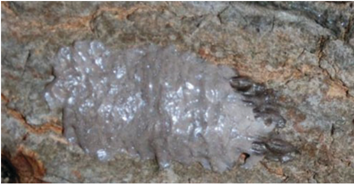
Figure 2. Egg mass of Lycorma delicatula (White).

The majority of eggs are laid on the lower portions of the tree (Tomisawa et al. 2013); however, eggs were observed 1 to 3 m up the tree and are laid as far up as 13 m on Prunus with rough lower bark (Kim et al. 2011). Eggs have also been observed at a height of as low as 1 cm (L. Donovall and M. Park, personal observation), but laying eggs at breast-height on woody trees with a diameter larger than 15 cm was most frequently observed. In Korea, an average of 3.4 egg masses were laid on each tree; however, the concentrations can be dramatically higher in Pennsylvania, with up to 197 egg masses per tree (Lee et al. 2014).