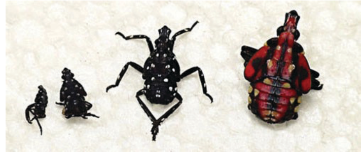
Figure 3. Four instars of Lycorma delicatula (White).

In Korea, eggs hatch in May, with nymphs ascending up the host plant after emerging in the early morning from the operculum, an oblong opening at the end of the ootheca (Han et al. 2008; Anderson et al. 2016). Large groups of nymphs feeding on the same host will cause the affected area to wilt and eventually die (Han et al. 2008).