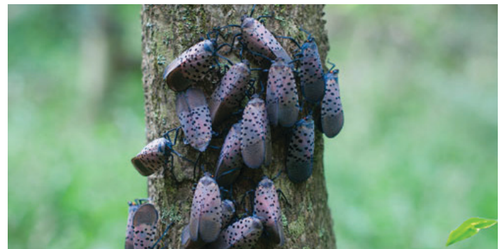
Figure 4. Cluster of spotted lanternfly, Lycorma delicatula (White).

Adult Lycorma delicatula have light brown forewings dotted with black spots, and the base color darkens along the tips of the wing. The cryptic coloration allows for Lycorma delicatula to blend against the branches of the host plant (Figure 4) (Frantsevich et al. 2008). The hindwings are brightly colored, red with black spots. They also have a white band separating the red from the black tips of their hindwings. Females are slightly larger than males, having a body length of 20 to 25 mm versus 17 to 20 mm (Barringer et al. 2015). Another account measures females at 22 to 27 mm and males at 21 to 22 mm from head to tip of the wings (Dara et al. 2015). Females have longer legs as well, ranging from 18 to 22 mm while the male leg length is between 15 and 18 mm (Barringer et al. 2015).