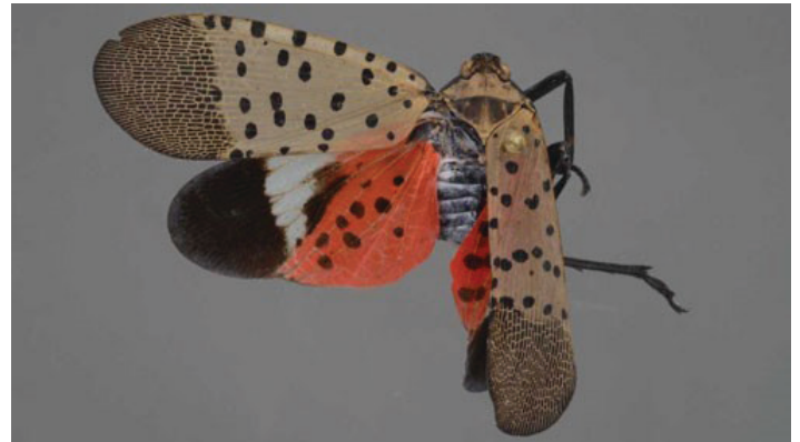
Figure 1. Adult Lycorma delicatula (White).

The native range of Lycorma delicatula includes China, India, and Vietnam. It was first reported outside these countries in South Korea in 1932 and has since become abundant there. Scientists have modeled potential distributions in different regions including Australia, America, and Europe. These models help regulatory agencies determine the potential distribution of this insect and establish plans to prevent the pest from spreading into areas where it could thrive (Jung et al. 2017). In the United States., it has currently (July 2018) been found in Delaware, New Jersey, New York, Pennsylvania, and Virginia, but its wide host range makes it likely to establish a wider distribution.