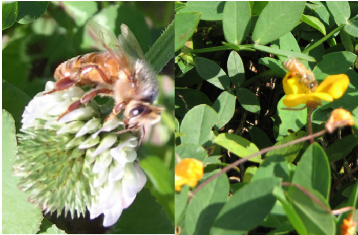
Figure 1. Honeybee on white clover flower in Citra, FL (left) and rhizoma peanut ( Arachis glabrata Benth.) flower in Marianna, FL (right).