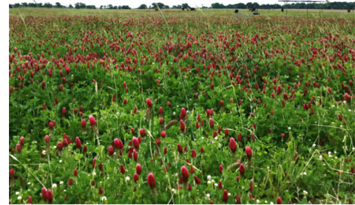
Figure 3. Grass-legume pastures in Marianna, FL. On the top, warm-season mixture with Argentine bahiagrass and Ecoturf rhizoma peanut; on the bottom, cool-season mixture with cool-season grasses and clovers.

Results from the grazing trial indicate that it is possible to reduce N fertilization from 200 lb N/acre/year to 30 lb N/acre/year when legumes are integrated into the system. The grass-legume system produced 70 lb more livestock gain using only 15% of the N fertilizer that the grass system used (Table 1). This demonstrates the viability of adding legumes to replace N fertilizer, resulting in greater livestock gains and reduced environmental impact.