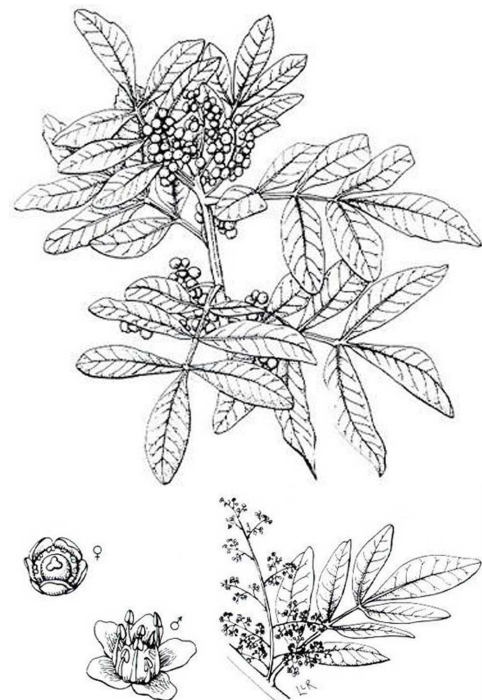
Figure 5. Brazilian peppertree fruiting and flowering.