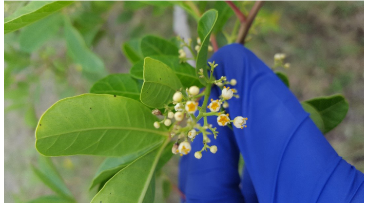
Figure 4. White flowers of the Brazilian peppertree.