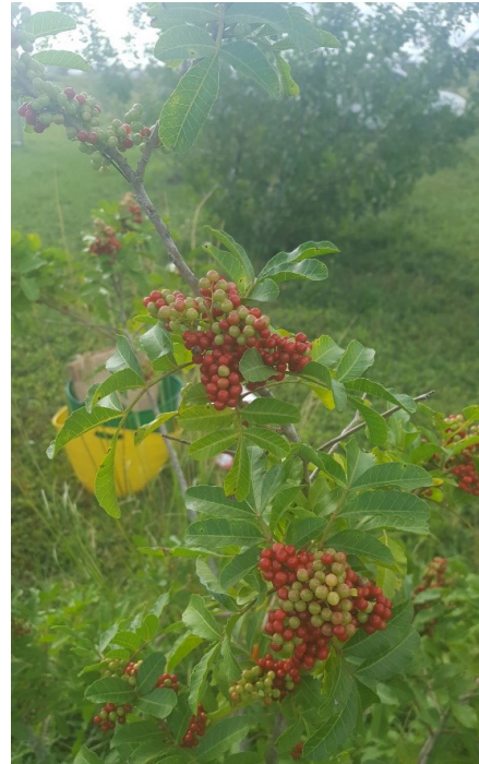
Figure 1. Brazilian peppertree with berries.

The invasion of many non-native species is harming Florida's natural ecosystems. Invasive plants are a major component of this phenomenon. Brazilian peppertree is one of the worst offenders (Cuda et al. 2006). This plant is encroaching upon nearly all terrestrial ecosystems in central and south Florida. Brazilian peppertree is the most widely distributed and abundant invasive species in the Florida Everglades, occupying 30,379 ha (Rodgers, Pernas, and Hill 2014). Brazilian peppertree is native to Brazil, Argentina, and Paraguay (Langeland et al 2008). It is thought to have been introduced to Florida in the 1840s as an ornamental plant (Figure 1) (Barkley 1944).