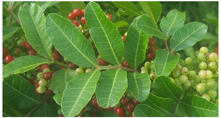
Figure 3. Brazilian peppertree winged midrib.

Brazilian peppertree is a shrub or small tree that grows to 10 m (33 ft) tall with a short trunk which is usually hidden in a dense head of contorted, intertwining branches. The leaves have a reddish and sometimes winged midrib (Figure 3), and three to 13 sessile, oblong or elliptic, finely toothed leaflets, 2.5 to 5 cm (1 to 2 in) long. Leaves smell of turpentine when crushed. The plants have separate male or female flowers. Each sex occurs on separate plants (Figure 5). The male and female flowers are white (Figure 4) and consist of five parts with male flowers having 10 stamens in two rows of five (Figure 5). Petals are 1.5 mm (0.6 in) long. The male flowers also have a lobed disc within the stamens. The fruits are found on female plants in clusters. These fruits are glossy, green, and juicy at first. They become bright red on ripening and grow to 6 mm (2.4 in) wide. The mature fruit is a small, bright red, spherical drupe (Langeland et al. 2008). Seeds measure 0.3 mm in diameter and are dark brown in color (UF/IFAS Center for Aquatic and Invasive Plants 2018).