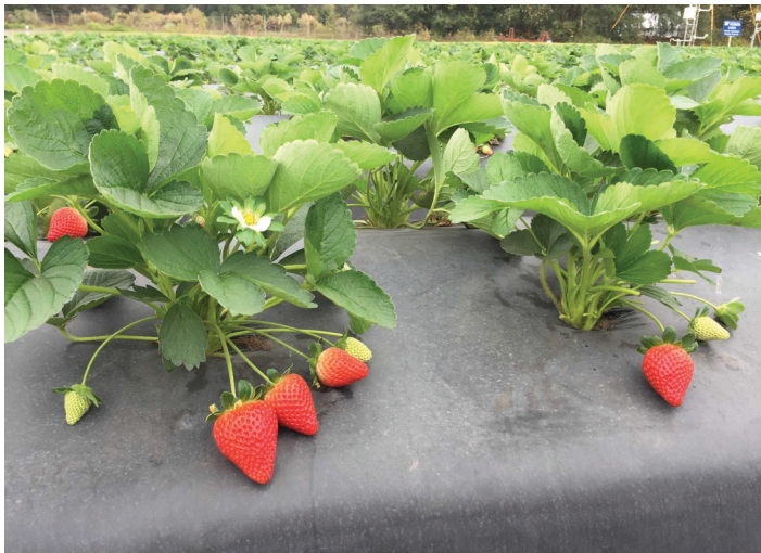
Figure 2. Plants and fruit of ‘Florida Brilliance’ at the Florida Strawberry Growers Association in Dover, Florida in December 2016.

The fruit of ‘Florida Brilliance’ are firmer than other University of Florida cultivars, with excellent shelf life and juicy texture. The soluble solids content (°Brix) of the fruit in central Florida ranges from 6%–9%, depending on the harvest date, which is similar to ‘Florida Radiance’ and slightly lower than ‘Florida Beauty’ and ‘Florida127’. The titratable acidity is similar to or slightly lower than ‘Florida Radiance’, depending on the harvest date. Thus, its flavor has been rated slightly better than ‘Florida Radiance’ on some harvest dates, with slightly higher sweetness and lower sourness. The average fruit size of ‘Florida Brilliance’ is approximately 20 grams, which is larger than ‘Florida Radiance’ but not as large as ‘Florida127’. It also is very efficient to harvest due to its open yet robust plant and long stems (Figure 2).