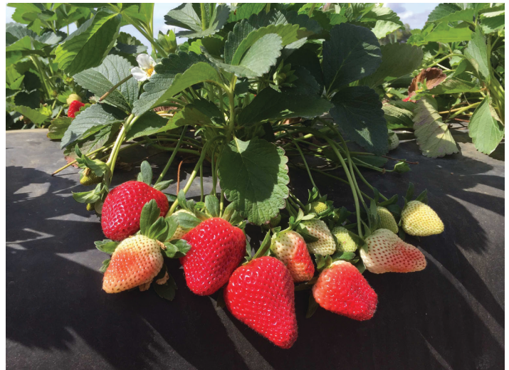
Figure 1. 'Florida Brilliance' on a commercial farm near Plant City, Florida in late February 2018.

'Florida Brilliance' is so named for its attractive fruit, which are glossy and conical in shape (Figure 1). The gloss of the fruit is accentuated by the position of the achenes which are recessed below the fruit surface, creating curvatures that reflect light in many directions. This cultivar maintains a very consistent shape and does not produce any elongated fruit early in the season, which is a weakness of 'Florida Radiance' in Florida.