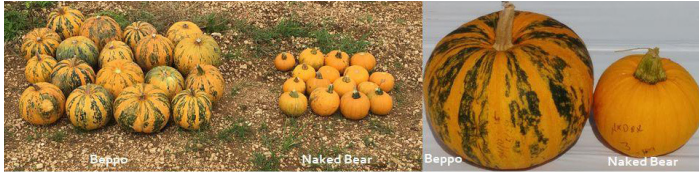
Figure 3. Differences in fruit rind color and fruit size between 'Beppo' and 'Naked Bear' cultivars.

'Beppo' had round fruits with orange-colored skin that were heavily ridged with contrasting green stripes (Figure 3). Fruits of 'Naked Bear' were small and round with a solid orange skin color (Figure 3).