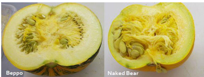
Figure 4. Differences in flesh color between 'Beppo' and 'Naked Bear' cultivars.

Flesh of 'Beppo' fruits was cream-white in color, while 'Naked Bear' had a light yellow flesh (Figure 4).