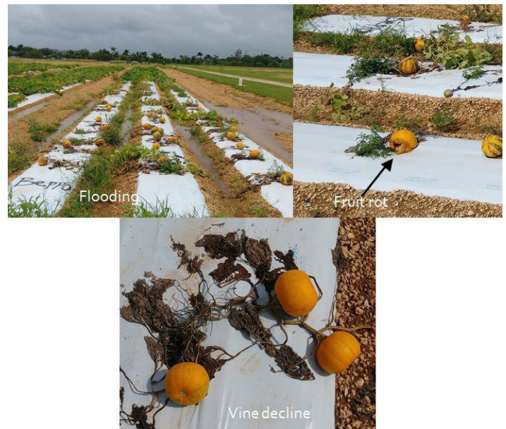
Figure 5. Fruit rot and vine decline caused by flooding resulting from heavy rainfall.

flavorful; however, their flesh lacked desirable flavor. Flesh quality in both cultivars may have been affected by a 10–15 days earlier harvest than was recommended. However, an early harvest was necessary in the current study due to heavy rainfall in the months of May and June 2018, which led to vine decline and fruit rot (Figure 5).