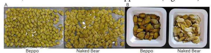
Figure 2. Freshly harvested seeds (A) and dried seeds (B) of ‘Beppo’ and ‘Naked Bear’ pumpkin cultivars.

At harvest, seeds of both cultivars appeared to have similar physical characteristics (Figure 2A). However, upon drying at room temperature for 4 days, the majority of ‘Naked Bear’ seeds had a thin coat (Murovec 2015) surrounding them, that was not observed on ‘Beppo’ seeds (Figure 2B).