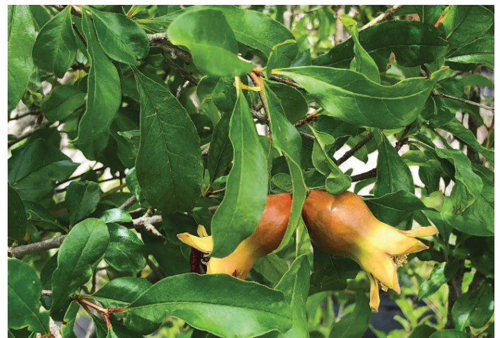
Figure 5. Pomegranate leaves and young fruit.

Pomegranate is an attractive ornamental plant and there are some varieties available for ornamental purposes, which do not produce fruit (Figure 4).