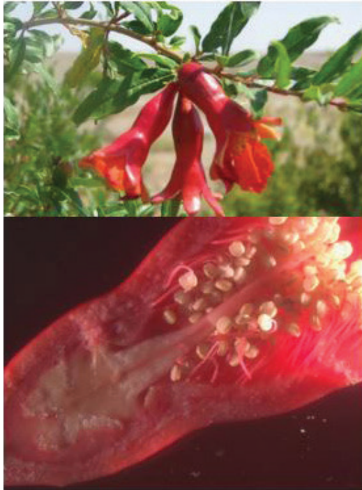
Figure 6. Female flower (productive flower).

calyx (Figure 8). The calyx may be 1.5-2.5 in (1-6 cm) long. Numerous seeds are each surrounded by a pink to purplish-red, juicy, sub-acid pulp (aril), which is the edible portion. The pulp is somewhat astringent. Pomegranates grown in North Florida mature from July to November, but may produce year-round in South Florida.