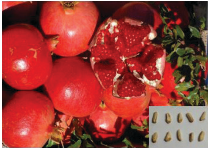
Figure 8. Pomegranate fruit, aril, and seed.