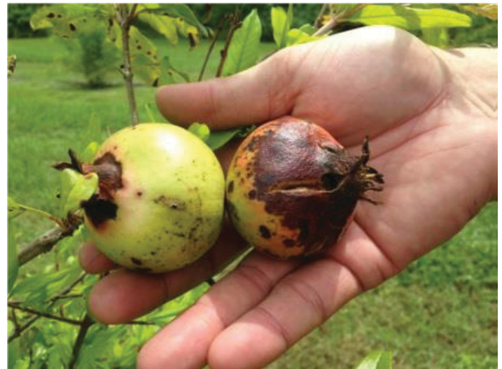
Figure 15. Anthracnose caused by Colletotrichum sp. to pomegranate fruit.

The most destructive disease observed in Florida is anthracnose caused by Colletotrichum sp. (Figure 15). It can affect leaves, stems, flowers, and fruit. Leaf symptoms include small, circular to angular, dark, reddish-brown to black areas, 0.25 in (4–5 mm) in diameter. Infected leaves are pale green and fall prematurely. Fruit symptoms are small, conspicuous, dark brown spots, initially circular, becoming irregular. At least three sprays per year of neutral copper fungicide can reduce the disease impact.