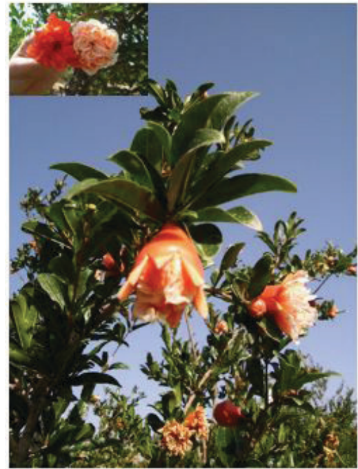
Figure 4. Ornamental pomegranate.