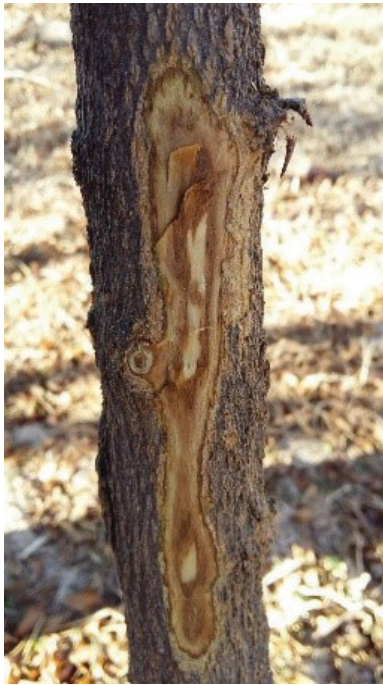
Figure 2. Freezing damage (12°F) to a dormant tree.