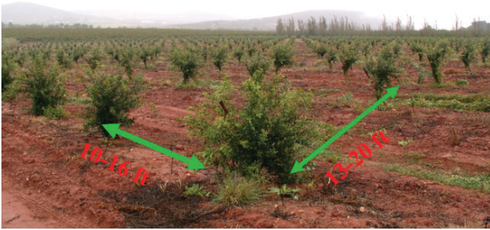
Figure 12. Tree spacing.

removed frequently around the main trunk(s). Prune to produce stocky, compact framework in the first 2 years of growth. Cut trees back to 2–2.5 ft (60–75 cm) at planting and develop three to five symmetrically spaced scaffold limbs by pinching back new shoots, the lowest at least 8–10 in (20–25 cm) from the ground. Shorten branches to 3/5 of their length during the winter following planting. Remove interfering branches and sprouts leaving two or three shoots per scaffold branch.