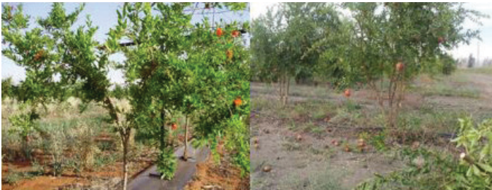
Figure 13. Training system; left: single trunk, right: multi-trunks.

Light, annual pruning of established trees encourages production of good quality fruit. Remove dead or damaged wood during late winter. Remove sprouts and suckers as they appear.