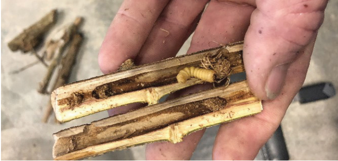
Figure 16. Damage by flat-headed borer to pomegranate tree in Cross City, FL.

Scale and mites occasionally attack the plant, but these do little damage. Sulfur dust applied in early June offers good mite control. Scale insects can be controlled by an application of 3% oil spray during the winter when the leaves are not present. Tree borers can also infest and kill trees (Figure 16).