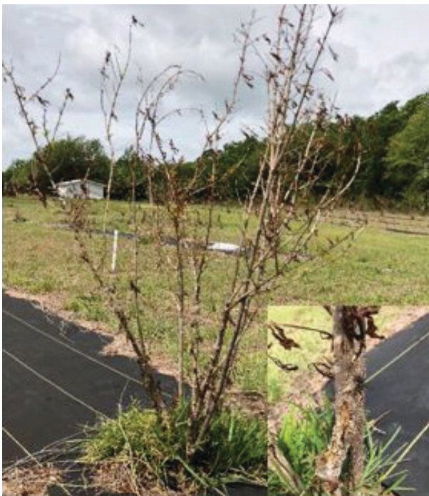
Figure 3. Late freeze damage (28°F) to a non-dormant tree in Cross City FL, March 2018.