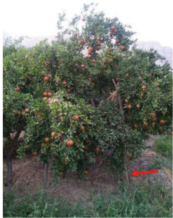
Figure 14. Pomegranate tree branch supported due to heavy fruiting.

Pomegranate trees are self-pollinating. Severe fruit drop during the plant's juvenile period (3–5 years) is not uncommon. Fruit drop is aggravated by practices favoring vegetative growth, such as over-fertilization and excess irrigation. Avoid putting young trees under stressful conditions. Fruit drop is less severe on mature trees than on younger trees.