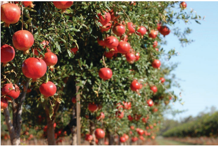
Figure 1. Pomegranate tree (Wonderful cv.).