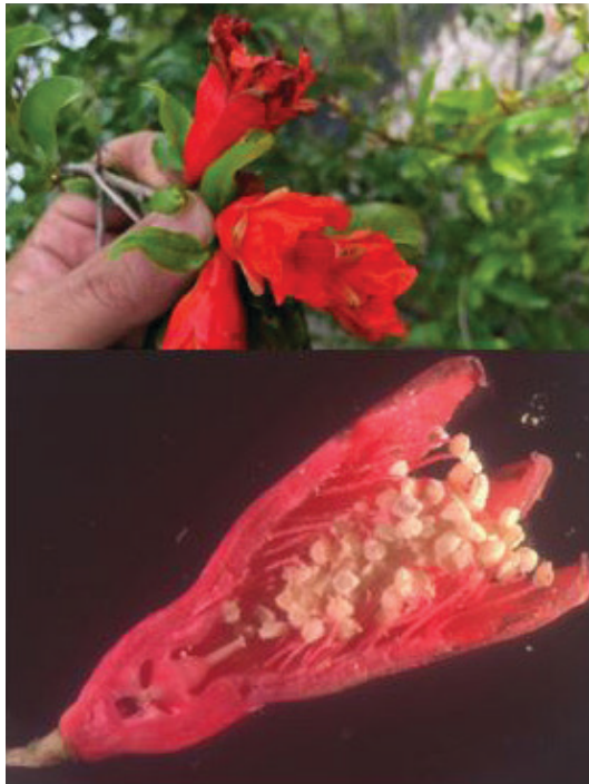
Figure 7. Male flower (non-productive flower).