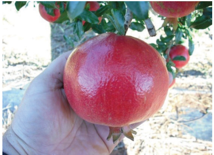
Figure 9. The ‘Wonderful’ pomegranate variety.

‘Wonderful’ cultivar (Figure 9) is grown commercially in California from cuttings from Florida. Florida’s wet season, accompanied by hot weather, are factors that reduce the fruit quality of late-season fruiting of pomegranate varieties such as ‘Wonderful’. Therefore, the late-ripening ‘Wonderful’ variety might not be the suitable cultivar for Florida. Also, earlier-ripening cultivars that mature in July and August will avoid marketing competition with California pomegranates. However, the economic potential for growing pomegranate trees commercially in Florida is currently unknown at this time.