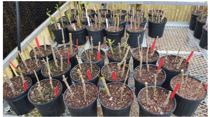
Figure 11. Hardwood propagation.

Trees are easily propagated during winter from hardwood cuttings 6–8 in (15–20 cm) in length and pencil size or larger in diameter (Figure 11). In Florida, hardwood cuttings should be taken in January or February and placed vertically in soil with the 2–4 top nodes exposed. Cuttings may be left in nursery rows for 1 to 2 years. Seed-propagated plants do not come true-to-type, but seeds will germinate in 45–60 days. Layering is also successful but more labor-intensive.