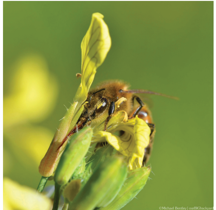
Figure 2. Honey bee on wild mustard.

While many plants are acceptable pollen producers for honey bees, fewer yield enough nectar to produce a surplus honey crop. The tables in this document list the nectar-bearing plants that are present to some degree in each region and the plants' respective bloom times. Please note, any nectar plants that are considered invasive in Florida have been excluded from this list.