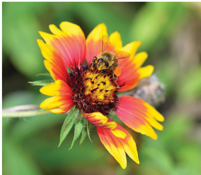
Figure 4. Honey bee on Indian blanket flower.