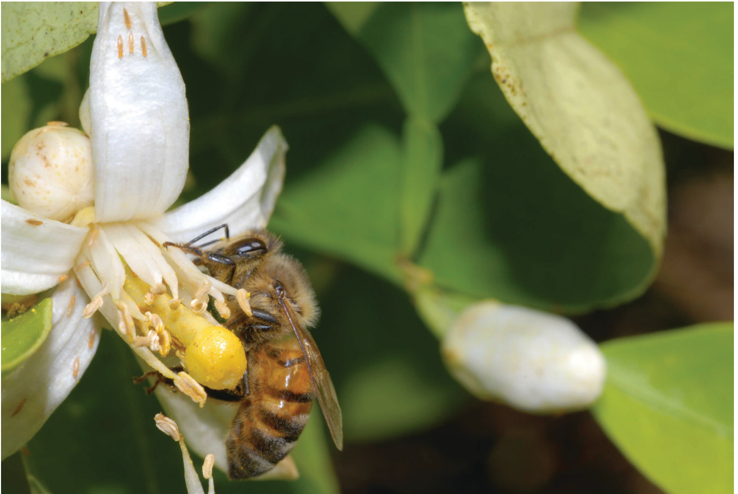
Figure 3. Honey bee on citrus.