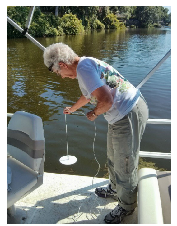
Figure 2. A Lakewatch volunteer in Lakeland, FL, demonstrates how to take a Secchi disk sample.

load can lead to blooms of microalgae that increase water turbidity.