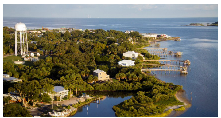
Figure 1. Example of coastal waterfront properties

This publication focuses on the studies conducted in Florida since 2000 that focused specifically on the potential effect of water quality on property values. The studies were identified through Google Scholar searches. The studies found and reviewed in this paper focus on four urban regions: the Jacksonville area (properties along the St. Johns River and its tributaries in Duval county), the Orlando area (properties around lakes in Orange County), and coastal Martin County and Lee County (properties along the Caloosahatchee River, the St. Lucie Estuary and River, the Loxahatchee Estuary, and the Indian River Lagoon).