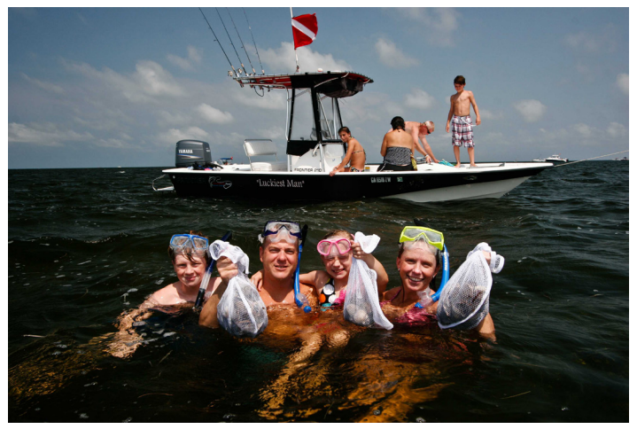
Figure 2. When searching for scallops, try not to venture too far from the boat.