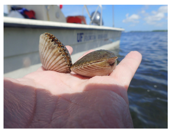
Figure 1. Freshly harvested scallops can be a great addition to a summertime meal.

Recreational harvest of bay scallops is only allowed in specific Gulf Coast counties during limited seasons. This information changes from year to year. Before planning your trip, be sure to check specific locations, bag limits, and season dates, which can be found on the Florida Fish and Wildlife Conservation Commission (FWC) website: http:// myfwc.com/fishing/saltwater/recreational/bay-scallops/.