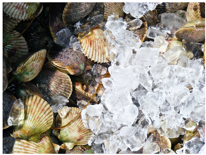
Figure 4. Once scallops are collected, be sure to place them on ice.