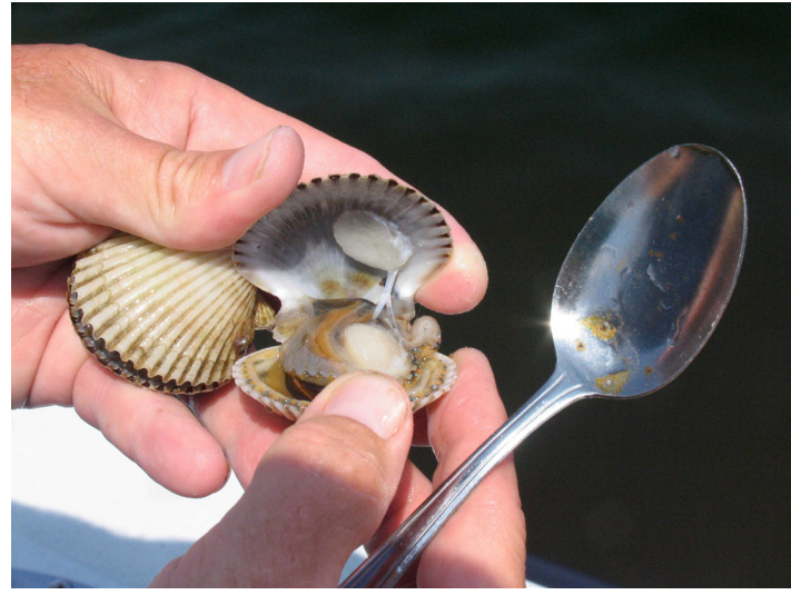
Figure 5. A spoon or butter knife can be used to clean scallops.