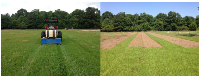
Figure 1. Glyphosate application to prepare strips prior to planting rhizoma perennial peanut.

Strip-planting RPP can reduce establishment cost, because only 50% of the total area is planted. Matching the width of the RPP strip with the equipment width (e.g., spriggers, sprayers, haying equipment) is a practical option. At the UF/IFAS North Florida Research and Education Center in Marianna, researchers planted 9-ft wide RPP strips between 9-ft wide bahiagrass strips. If bahiagrass pastures are already established, the existing sod must be killed with glyphosate prior to planting the RPP (Figure 1). This can be done during the previous fall; if needed, glyphosate can be reapplied prior to planting in the spring. If bahiagrass and RPP are being established at the same time, it is important to make sure soil moisture is adequate, then prepare the seedbed and plant both species in early spring. Commercial strip-planting services are available because of the specialized equipment needed. Equipment for planting includes a digger and sprigger (Figure 2).