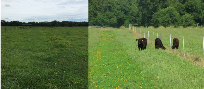
Figure 4. Established strip-planted Ecoturf rhizoma perennial peanut-Argentine bahiagrass pastures under grazing at UF/IFAS NFREC in Marianna, FL.

average daily gain (ADG) was significantly greater for BG-RPP pastures (Table 1). These results indicate that BG-RPP pastures could also be an option for heifer development grazing systems, especially in combination with overseeded cool-season forages.