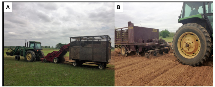
Figure 2. Rhizoma perennial peanut sprig digger (A) and sprig planter (B).

Once RPP is established, it is critical to suppress weed competition. Strip-planted RPP allows for the use of RPP-labeled herbicides while minimizing potential damage to the neighboring grass strips. Imazapic is labeled for use