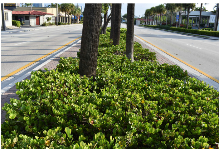
Figure 21. The same plants four years later and maintained at 20 inches tall.