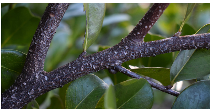
Figure 13. Mature branch with prominent, lighter-colored lenticels.