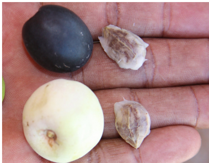
Figure 15. Single-seeded, round to oblong fruits with white to purple skin and sweet, white flesh.