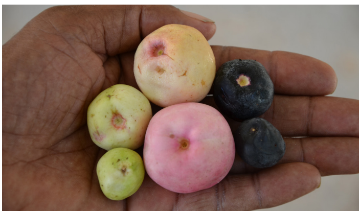
Figure 12. Typically appearing fruits. Left: 'Green Tip,' Center: 'Horizontal,' Right top: 'Green Tip,' Right bottom: 'Red Tip'.