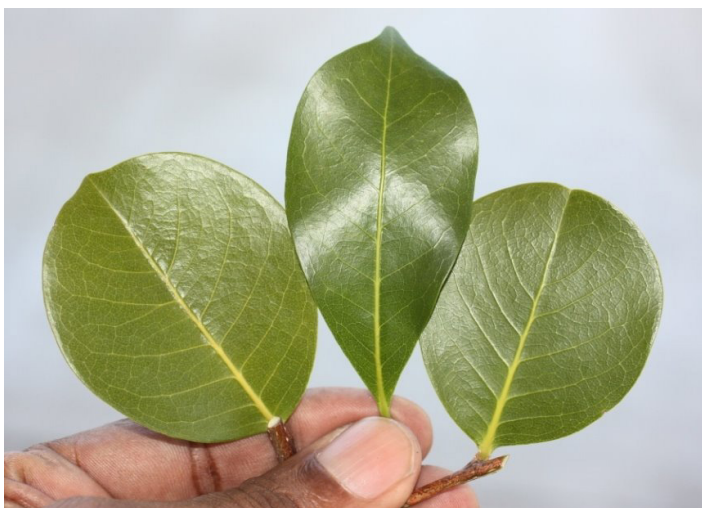
Figure 7. Leaf blades are broadly elliptic, obovate (center), or nearly round. Apices are rounded, abruptly pointed, or notched.