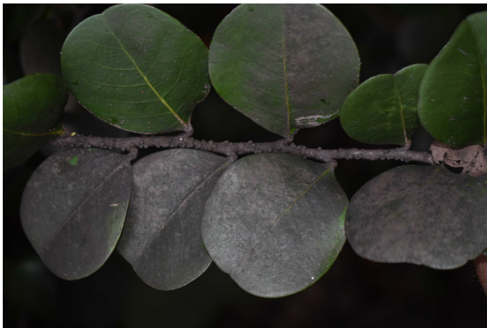
Figure 23. Residual lobate lac scales and accompanying sooty mold.

The little leaf notcher ( Artipus floridanus ) makes shallow notches along the leaf blades sometimes so uniform that they appear to be natural leaf serration rather than feeding damage. The Sri Lanka weevil ( Mylloderes undecimpustulatus undatus ) chews both shallow and deep notches along the leaf margins. The feeding pattern is very noticeable.