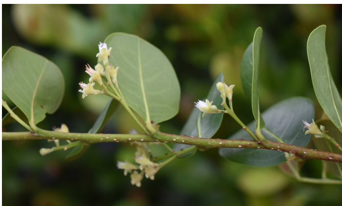
Figure 8. Axillary cymules hidden amongst the foliage.

Flowering is mostly from January to August, but the main flowering period is usually late spring. The flowers occur in rather inconspicuous, short, axillary, and terminal clusters called cymules (few-flowered, poorly branched inflorescences in which the central flower matures first). Each flower is perfect (with both male and female sexual organs), and measures about 0.25 inch long. The five distinct (unfused), spreading, pale greenish-to-yellowish sepals and five narrow, white petals are borne atop a conical receptacle (flower base or axis). The stamens vary in number from 12 to 25, and are irregularly fused into an erect, densely hairy tube in the center of the flower. The ovary is also shaggy and hairy, but the hairs are lost as the fruit develops.