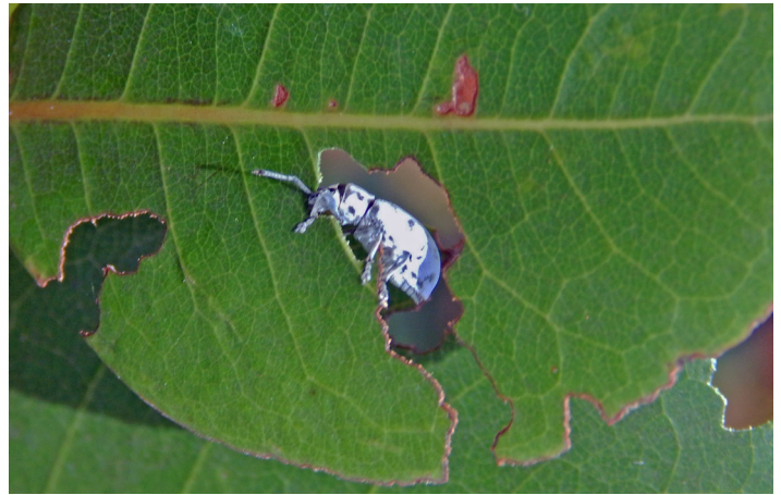
Figure 25. Sri Lanka weevil feeding on cocoplum.