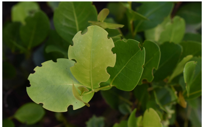
Figure 26. Damage to cocoplum caused by Sri Lanka weevil.