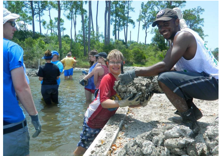
Figure 3. For living shorelines projects, oyster shell must be contained using mesh bags.

NWP 54 was made effective in March 2017 (US Army Corps of Engineers 2017f). NWP 54 complements NWP 13 and 27 to provide general permit authorization for a living shoreline approach to bank stabilization. This NWP authorizes structures and work in navigable waters of the United States and discharges of dredge or fill material into waters of the United States for the construction and maintenance of living shorelines. The permit defines living shorelines as consisting mostly of native material and incorporating vegetation or other “soft” elements alone or in combination with “hard” shoreline structures such as