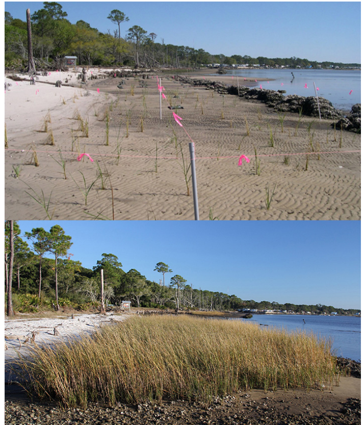
Figure 1. Living shorelines use natural materials like salt marsh grasses to prevent coastal erosion. In just four years, the progress of a living shoreline project in Franklin County, FL is substantial.

Living shorelines in Florida are typically constructed in the navigable waters of the United States, in state waters, and over sovereign submerged lands. Therefore, federal, state, and sometimes local agencies have regulatory authority over their construction (Pace 2017). Because living shorelines are considered to be beneficial to the environment, these agencies have undertaken coordinated efforts to reduce the regulatory burden required to construct them,