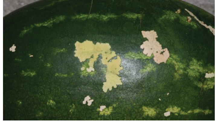
Figure 5. Feeding damage from the soybean looper, Chrysodeixis includens (Walker), on a watermelon rind.

has an unusual defoliation pattern, feeding from the lower, inside canopy and then moving up and outwards (Smith et al. 1994). When scouting for pests, this type of feeding pattern can be easily overlooked, as the outer canopy appears undamaged until the top of the plant is defoliated. During early instars when Chrysodeixis includens is small, foliage is not consumed in large amounts as it is by later instars. Most foliage is consumed by the fourth to sixth instars, during the last 4–5 days of the larval stage (Reid and Greene 1973; Trichilo and Mack 1989; Smith et al. 1994).