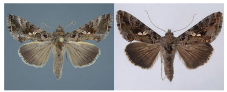
Figure 4. Adult soybean loopers, Chrysodeixis includens (Walker), with differing color patterns.

The adult moth is small, with a wingspan ranging 1 to 1.5 inches (2.54–3.81 cm), and is mottled brown to black in color. Forewings are darker in color than the hindwings and possess silvery white spots. Presence of these spots can be used to distinguish the soybean looper from many other crop feeding pests, though it should be noted that the adult cabbage looper also has similar markings.