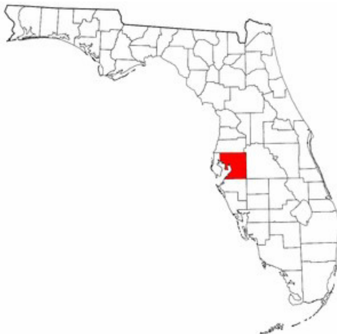
Figure 1. Map showing relative location of Hillsborough County.

Hillsborough County is in central-west Florida and includes the cities of Tampa, Temple Terrace, and Plant City (Figures 1 and 2). According to the 2010 US Census, 51% of residents are white alone, 27% are Hispanic or Latino, 17.7% are black, 4.1% are Asian, 0.5% are American Indian or Alaskan Native, 0.1% are Native Hawaiian or Pacific Islander, and 2.6% are two or more races. Also, 51.3% of the population are female, 87.5% are high school graduates, 30.6% have at least a bachelor’s degree, and the median household income is $50,579.