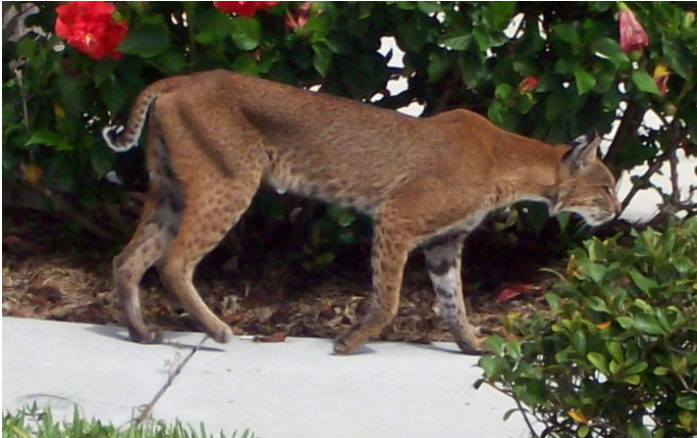
Figure 3. Bobcat.

on their fur. In contrast, bobcats have a red tinge to their fur. Their bellies tend to be white, and they have a spotted pattern on their fur even when they're adults (Figure 3). A very distinct difference between panthers and bobcats is the shape of their tails. A panther's tail is as long as its body and nearly touches the ground. By contrast, a bobcat's tail is shorter than the length of its body and often curls upward at the end, exposing a white underside that panthers do not have.