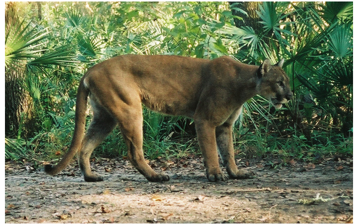
Figure 2. Florida panther.

Panthers can sometimes be confused with bobcats, dogs, and coyotes. Below are some photos to help you determine whether you have seen a panther.