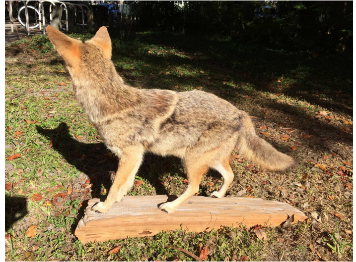
Figure 4b. Coyote.

more slender face compared to the Florida panther, and a medium-length bushy tail.