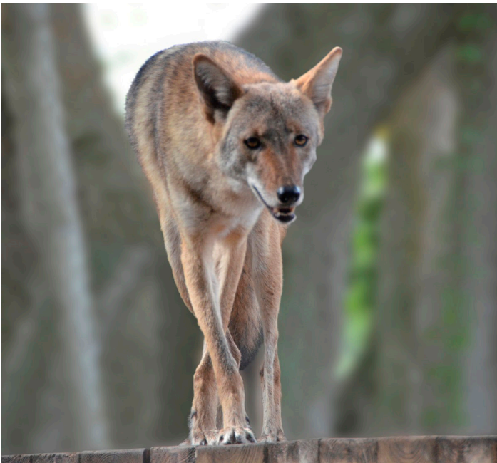
Figure 4a. Coyote.

While coyotes are a part of the canid (dog) family, they can still be confused with the Florida panther. They are more similar in size to bobcats, weighing between 20 to 35 pounds. Coyotes tend to have grey fur, with patches of tan or brown (Figure 4a and 4b). The coyote has a longer,