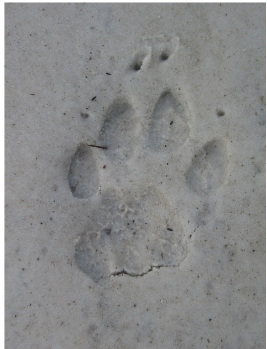
Figure 9. Panther track.

arrangement of the toes is asymmetrical around the pad. Panther tracks (Figure 9) are most commonly confused with the tracks of dogs and coyotes (Figures 10 and 11). Panthers have retractable claws while dogs and coyotes do not. As a result, dog and coyote tracks typically include the imprints of claws, whereas panther prints usually do not have claw marks. The presence of claw marks for panther prints depends on what surface the animal was crossing and whether the animal was running at the time.