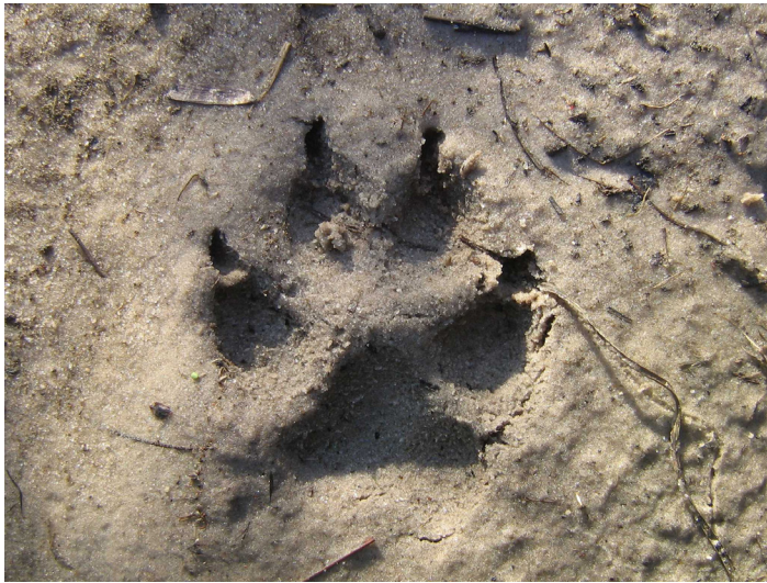
Figure 10. Dog track.

Credits: Florida Fish and Wildlife Conservation Commission