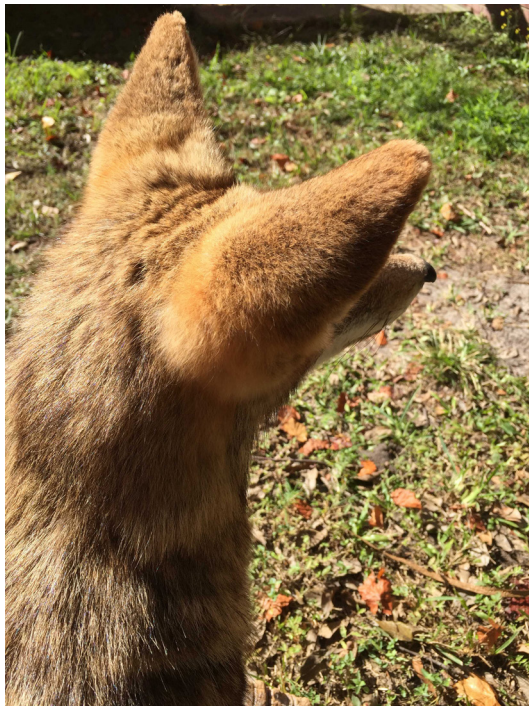
Figure 7. Coyote ears.