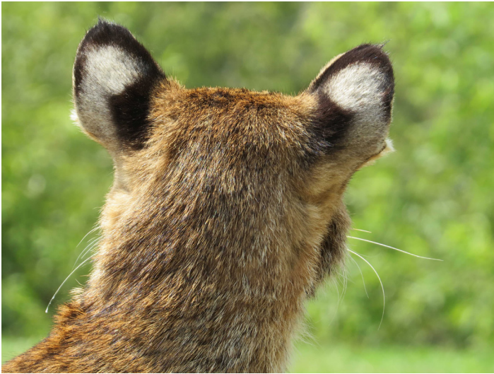
Figure 6. Bobcat ears. Credits: Florida Fish and Wildlife Conservation Commission