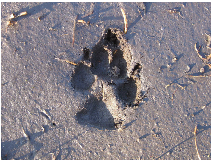
Figure 11. Coyote track.