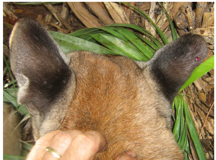
Figure 5. Panther ears.

If you only catch a glimpse of the animal from behind, a good way to differentiate between a panther, a bobcat, and a coyote is by looking at the shape and color of the ears. The back of a panther ear is black (Figure 5), while bobcats have distinct white spots on the back of the ear (Figure 6). The fur on the back of a coyote ear closely matches the rest of its coat (Figure 7).