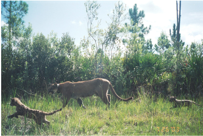
Figure 1. Adult Florida panther with two kittens.