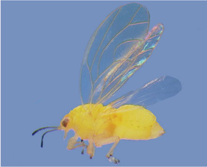
Figure 6. Female of Calophya latiforceps Burckhardt.

wind currents. Groups of adults feed and search for mates on new leaf flushes, and copulation occurs a few hours after emergence; mating lasts 3 to 5 min. Adults live on average 9.3 \pm 0.6 d (range 6.3 to 12 days).