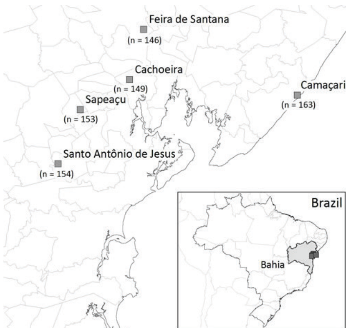
Figure 2. Distribution of Calophya latiforceps Burckhardt. Credits: Abhishek Mukherjee, Indian Statistical Institute, Kolkata, India