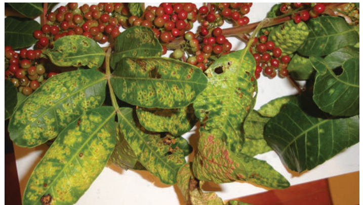
Figure 1. Leaves of Brazilian peppertree, Schinus terebinthifolia , attacked by developing nymphs Calophya latiforceps Burckhardt.

galls (Burckhardt and Basset 2000). These authors showed that several Calophya spp. are monophagous, meaning they are restricted to a single host plant species.