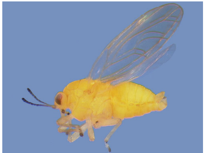
Figure 5. Male of Calophya latiforceps Burckhardt.

Adults are bright yellow and are found on new flushes of Brazilian peppertree. Females are larger in size than males; 1.59 \pm 0.01 mm in length compared to 1.48 \pm 0.01 mm. The eyes are greyish in color. The antennae are dirty yellowish basally and gradually become darker towards the apex. The tibiae and tarsi are greyish brown. The forewing has yellow or light brown veins, and the membrane is colorless and transparent. The sex of the adults can be distinguished by the shape of the tip of the abdomen, which is pointed in females (Figures 5 and 6).