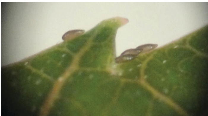
Figure 3. Eggs of Calophya latiforceps Burckhardt.

Eggs are laid along the margins and veins of new leaf flushes. Newly laid eggs are oblong in shape, white in color (< 3 days old) and turn black before nymphal hatching (Figure 3). Egg length is probably similar to that of Calophya terebinthifolii Burckhardt & Bassett, which is 0.212 \pm 0.002 mm (Christ et al. 2013).