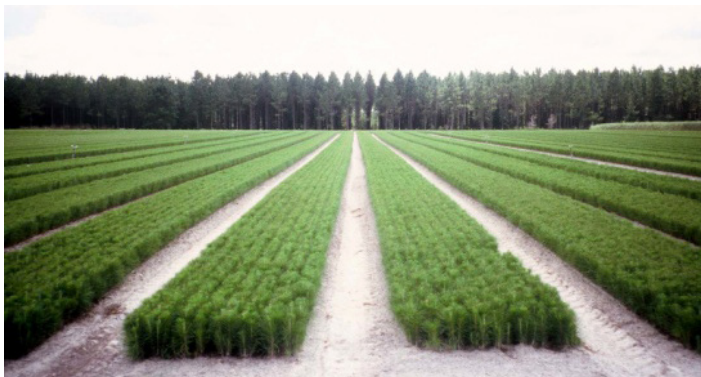
Figure 4. Improved bare root slash pine seedlings growing in a Florida forest tree nursery.

A first-generation or first-cycle seed orchard is one in which the clones are grafted from first-generation selections. If the clones are from second-generation selections, then the seed orchards developed are called second-generation or second-cycle seed orchards, etc. Collectively, seed orchard clones are called the production population.