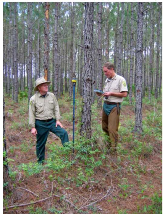
Figure 5. Tree-improvement foresters measuring height, diameter, disease, and tree form on a slash pine plus-tree seedling in order to determine the genetic worth of its parents.

To quantify the genetic superiority of each plus-tree, it is necessary to create several field tests (named progeny tests), to measure the performance of a plus-tree's progeny (offspring) and analyze that performance to judge the genetic value and ranking of the parent tree (Figure 5). Simply put, if a plus-tree's seedlings perform well in several progeny tests having, perhaps, different soil and climatic conditions, it reflects well on the genetic value of the plus-tree.