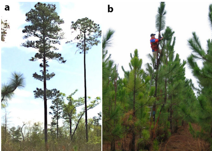
Figure 1. a) A large, straight and healthy first-generation Florida loblolly pine plus-tree selection. b) Collecting scion from a third-generation slash pine forward selection. This selection was made in a second-generation slash pine progeny test.