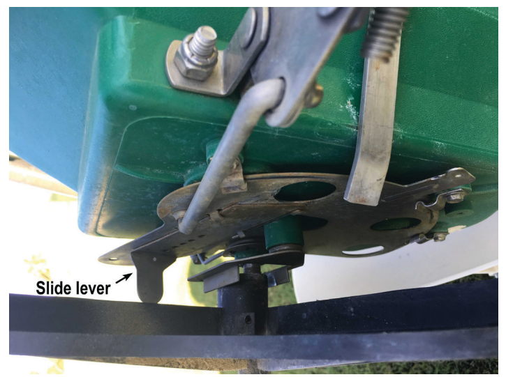
Figure 4. The slide lever on rotary spreaders can be adjusted so that the fertilizer is spread uniformly on both sides.

lever reduces the amount of fertilizer distributed on the right side (operator's side) of the spreader compared to the left.