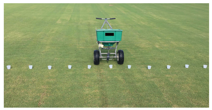
Figure 5. Catch cans are used to determine spread uniformity and swath width.