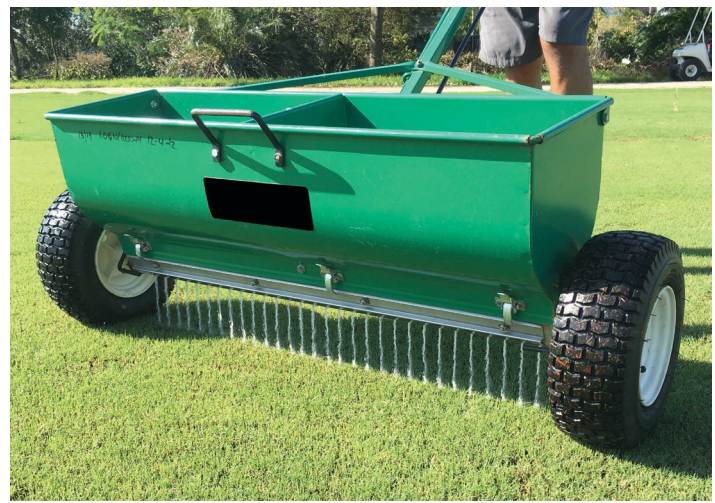
Figure 3. Drop spreaders distribute product uniformly between the wheels.

Drop spreaders are designed to uniformly distribute fertilizer only between the wheels (Figure 3). Thus, an adjustment of the spread pattern is not necessary for drop spreaders.