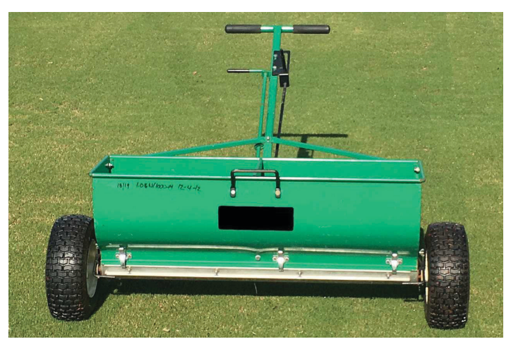
Figure 1. Drop spreader.

The rotary spreader has a wider distribution pattern compared to a drop spreader, and therefore can cover a larger area in a shorter time. The application pattern of a rotary spreader also gradually diminishes away from the machine, reducing the probability of an application skip. The uneven, wide pattern of the rotary spreader is initially harder to calibrate, and heavier fertilizer particles tend to sling farther away from the machine.