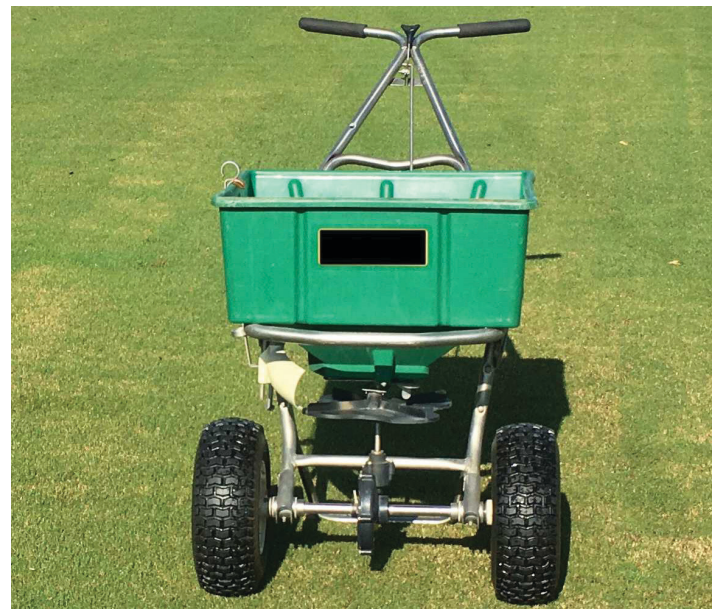
Figure 2. Rotary spreader.