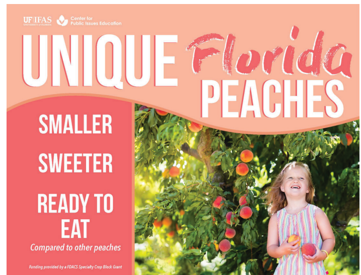
Figure 1. Florida peach characteristics.

The growing conditions in Florida have given Florida peaches unique characteristics that make them an ideal springtime snack. In this document, we will discuss the unique Florida peach, including its smaller size, seasonality, tree-ripened sweetness, and health benefits. Lastly, we will leave you with recommendations to keep your Florida peaches fresh as long as possible.