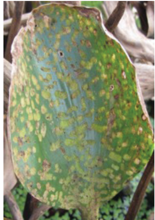
Figure 4. Weevil feeding damage on waterhyacinth.

that require higher rates and grow back much more rapidly following herbicide applications.