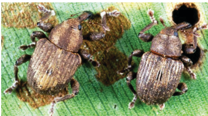
Figure 1. The waterhyacinth weevils. Left: Neochetina bruchi Hustache. Right: N. eichhorniae Warner.