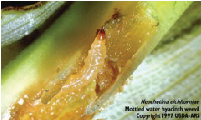
Figure 3. Larva of N. eichhorniae .

The eggs, larvae, and pupae of both species are very similar and virtually indistinguishable from one another. Identification of the immature stages is difficult. Eggs are whitish, ovoid, and about 0.75 mm in length. Because they are embedded in the plant tissue, they can usually only be found by carefully dissecting the plant. Pupae are white. The pupa is enclosed in a cocoon formed among the lateral rootlets and attached to the main root axis below the water surface. These appear as small balls or nodules about 5 mm in diameter on the roots and are usually near the stem.