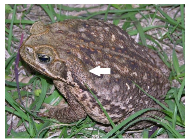
Figure 2. Invasive cane toads have very large poison glands on their shoulders (indicated with arrow)—these glands are somewhat triangular, usually tapering back to a point. They also have a ridge around their eyes and over their nose.

Adult cane toads measure between three and six inches long, and some individuals reach eight or nine inches. Males and females can be distinguished by differences in coloration and the texture of their back skin; females have smooth, mottled, brown and white backs, whereas the