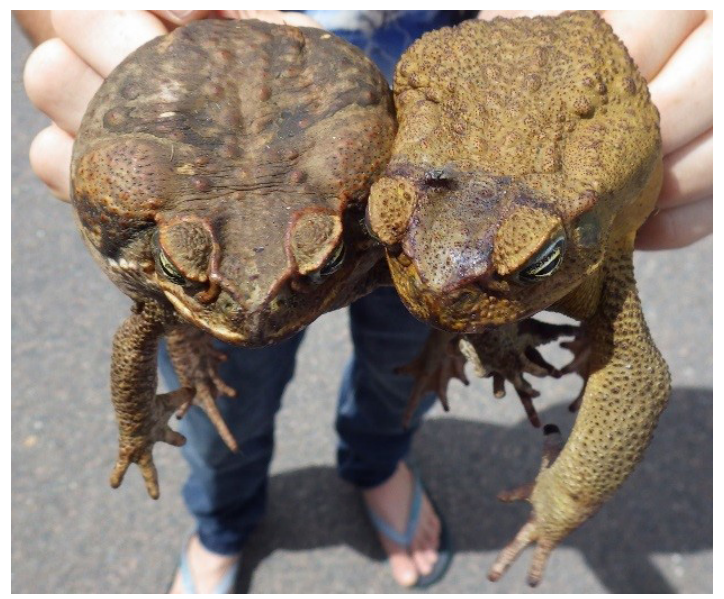
Figure 3. Cane toad female on left and male on right. Note differences in skin color and texture.