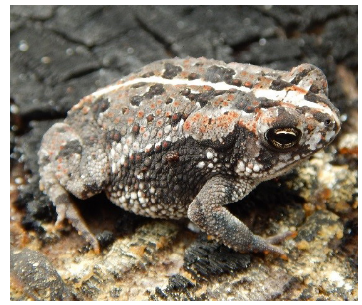
Figure 5. Native oak toads are little and have small, oval glands on their shoulders. Paired crests on top of their heads are indistinct.

Cane toads are highly adaptable and found in a variety of habitat types. In their native range, they live everywhere from savanna to open forest, but dense vegetation appears to act as a barrier to their movement. Where they occur in Florida, they are particularly common in yards, golf courses, school campuses, agricultural areas, and other human-modified habitats. Even in their native range, they are found in greater densities in human-modified areas than in natural habitat. Their affinity for disturbed habitat, tolerance of a wide range of conditions, and ability to adapt to new conditions are important factors enabling successful colonization in many different places. For example, cane toads thrive in acidic and saline water bodies. In Australia,