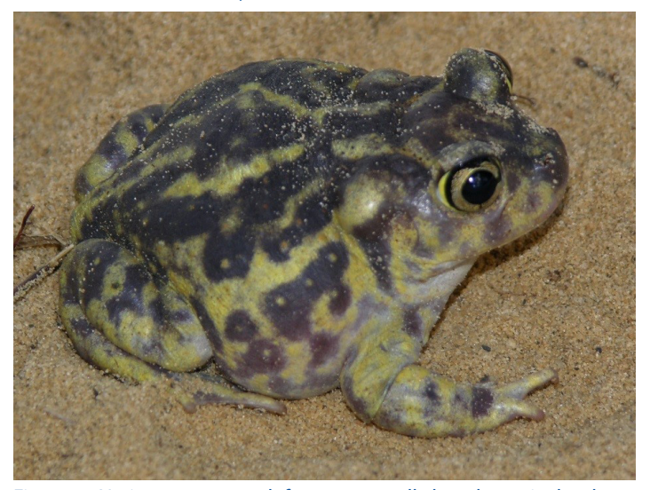
Figure 6. Native eastern spadefoots are usually less than 2 inches long and may have numerous yellow markings.

cane toads have even adapted to deserts, and toads at the front of the invasion evolved longer limbs and the tendency to move in straighter lines than toads in places where they have been established longer. Longer limbs and moving in a straight line increases the speed at which they can spread Down Under.