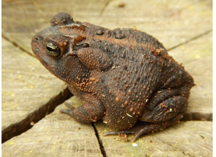
Figure 4. Native southern toads have small, oval glands on their shoulders and a pair of raised ridges or crests on top of their heads.