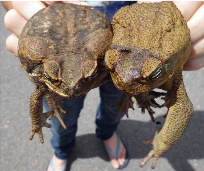
Figure 3. Cane toad female on left and male on right. Note differences in skin color and texture.