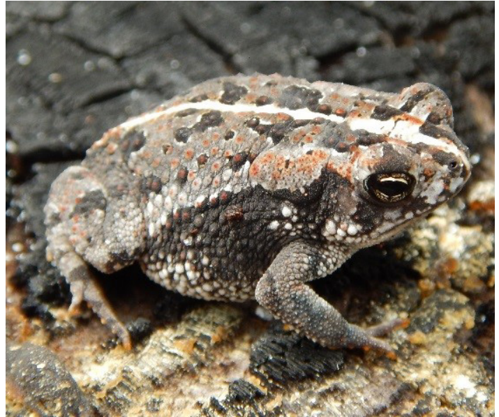
Figure 5. Native oak toads are little and have small, oval glands on their shoulders. Paired crests on top of their heads are indistinct.