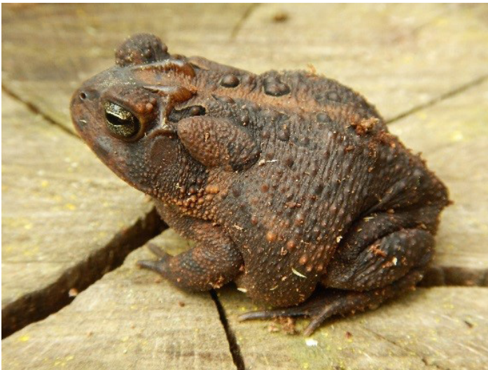
Figure 4. Native southern toads have small, oval glands on their shoulders and a pair of raised ridges or crests on top of their heads.