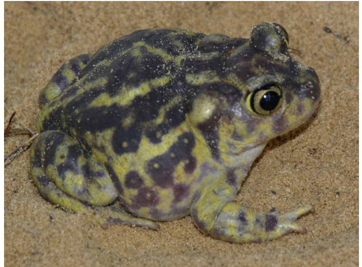
Figure 6. Native eastern spadefoots are usually less than 2 inches long and may have numerous yellow markings.