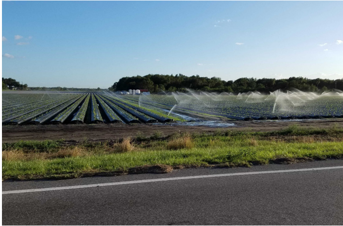
Figure 7. Overhead irrigation in strawberry field.

Foliar nematodes can be disseminated in many ways. Infestation is most easily accomplished by rain or irrigation water washing the nematodes into the plant buds. Water is a major factor in helping the spread of foliar nematodes in a field because a thin film of water must be present for foliar nematodes to move across leaves and stems. Actively, nematodes will only travel slowly from plant to plant, but in fields that are irrigated overhead or inundated, their spread can become more rapid (Figure 7). Water from splashing rain and irrigation readily moves the nematodes from leaf to leaf and plant to plant.