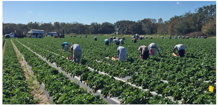
Figure 8. Harvest crew picking strawberries, moving up and down planting rows, Plant City, FL, 2017.

Foliar nematodes can also infest new plants by swimming up stems and moving along moist plant tissue surfaces. In some hosts they may also enter the leaves through stomata, but this has not been observed on strawberries. Foliar nematodes can mature from egg to adult in about 2 weeks, allowing many generations to develop during one growing season. Another potential means by which foliar nematodes are spread is through the harvesting process. Especially when plants are still wet from morning dew, the nematodes can easily be spread by the harvesting crew as they drag their hands through the planting rows while picking the berries (Figure 8).