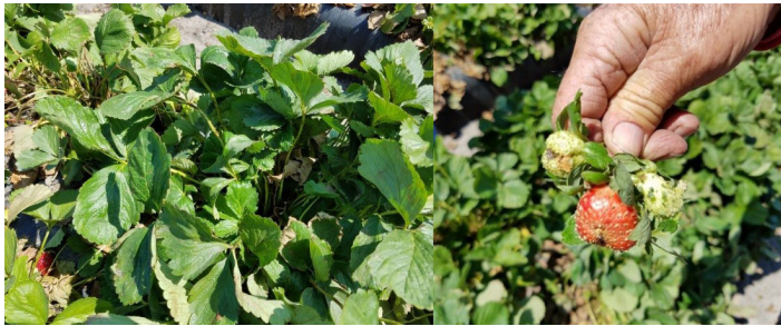
Figure 4. Aphelenchoides besseyi symptoms on strawberry. Left: twisting, crinkling and curling of strawberry leaves; right: abnormally shaped “broccoli” fruit. Plant City, FL, 2016–17 season.

foliage or flowers. In strawberry, young plants are often dwarfed and present a spider-like appearance. Leaves appear crimped, twisted, or crinkled and are a darker green than normal (Figure 4, left). A reddish color may appear on the leaf edges and veins, and leaves tend to become more brittle, with tips of young leaves and stipules of older plants drying up and turning brown. Petioles are often short, thick, less pubescent than those of unaffected plants, and have a reddish cast. Damaged plants put on fruit late, and it is often of inferior quality, sometimes showing “phyllody” or “broccoli fruit” (Figure 4, right).