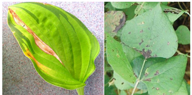
Figure 6. Aphelenchoides besseyi symptoms on a monocot (left) Hosta (interveinal lesions) and a dicot (right) bean (“angular leaf spot”).

In other plants, foliar nematode symptoms often include localized chlorotic or purplish angular lesions that are delineated by leaf veins (it is difficult for the nematodes to move across the veins). This often creates a patch-like appearance on dicots and a stripe-like pattern with monocots (because monocots have parallel veins, discoloring on them looks like streaks) (Figure 6.) Discoloring typically starts near the leaf base and spreads outward. The symptoms of angular spots are often mistaken for bacterial leaf spots or fungal pathogens such as downy mildew which are also commonly confined between the leaf veins. In Costa Rica, A. besseyi has been reported to cause a disease of bean called angular leafspot (Figure 6).