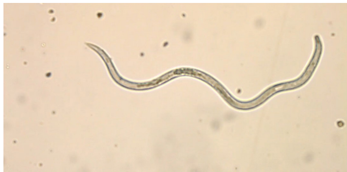
Figure 1. Aphelenchoides besseyi from strawberry. Plant City, 2016.

From the 1930s until the 1960s, crimp was frequently observed in commercial Florida strawberry nurseries. Years when crimp did not show up were linked to low spring temperatures, setting of plants in new ground, and careful selection of nursery plants. There is no certainty about which species of Aphelenchoides caused crimp in Florida during those days. During the early years they were identified as A. fragariae , but in later reports starting around the 1950s there is no more mention of A. fragariae . Instead, the nematodes were now identified as A. besseyi . A. besseyi was first described in 1942 by J.R. Christei, so possibly the earlier reports were misidentifications. Very few reports exist on bud nematodes in FL strawberries after the 1970s. In 2014 the nematodes were reported from one farm (Noling, personal communication), and in 2016–17 they were found on six farms. The 2016–17 foliar nematodes were identified as A. besseyi (Inserra, personal communication) (Figure 1).