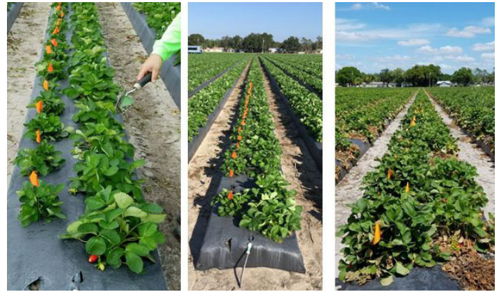
Figure 5. Foliar nematode symptoms on strawberry throughout the growing season; orange flags indicate nematode infection; same row is shown at different times; left, November 2016; middle, December 2016; and right, March 2017. Plant City, FL.

poiretii ), in which the nematode was found to increase inflorescences (EPPO, 2016).