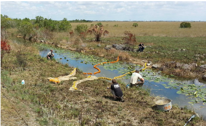
Figure 9. University of Florida and partners responded rapidly and persistently to sightings of a Nile crocodile. The animal was removed using block nets.

EDRR programs have to be persistent as well as rapid. Our success with Nile crocodiles and Nile monitors demonstrated the effectiveness of persistence.