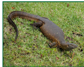
Photo above: Nile Monitor ( Varemus niloticus ) spotted in SW Ranches