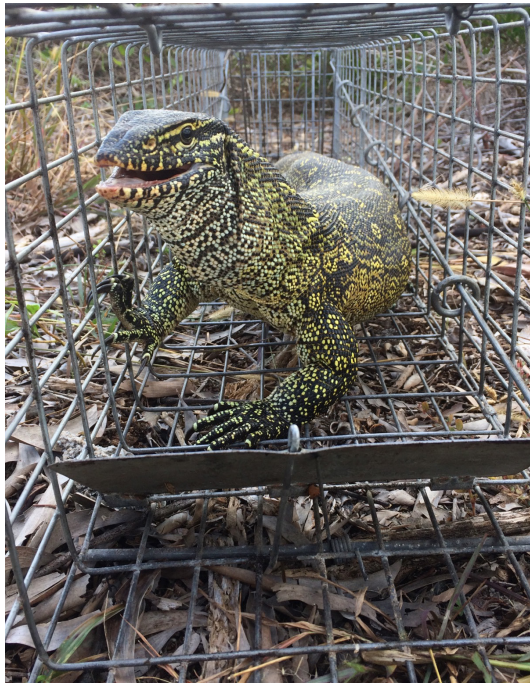
Figure 5. Nile monitor ( Varanus niloticus ) in trap.