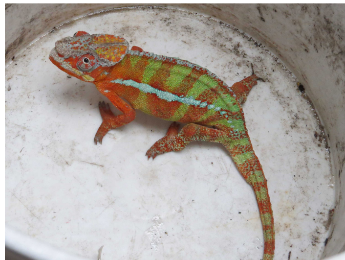
Figure 4. Panther chameleon ( Furcifer pardalis ).