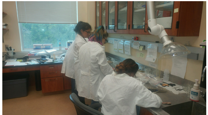
Figure 7. University of Florida biologists conducting a necropsy of a Burmese python ( Python molurus bivittatus ).