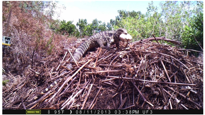
Figure 6. Argentine black and white tegu ( Salvator merianae ) removing an alligator egg from a nest.

on an American crocodile nest but without evidence of depredation.