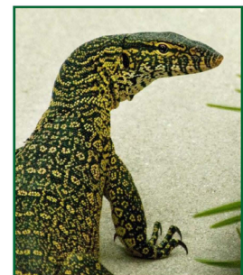
Figure 11. Outreach door-hanger that led to the removal of a Nile monitor in Southwest Ranches, Florida.