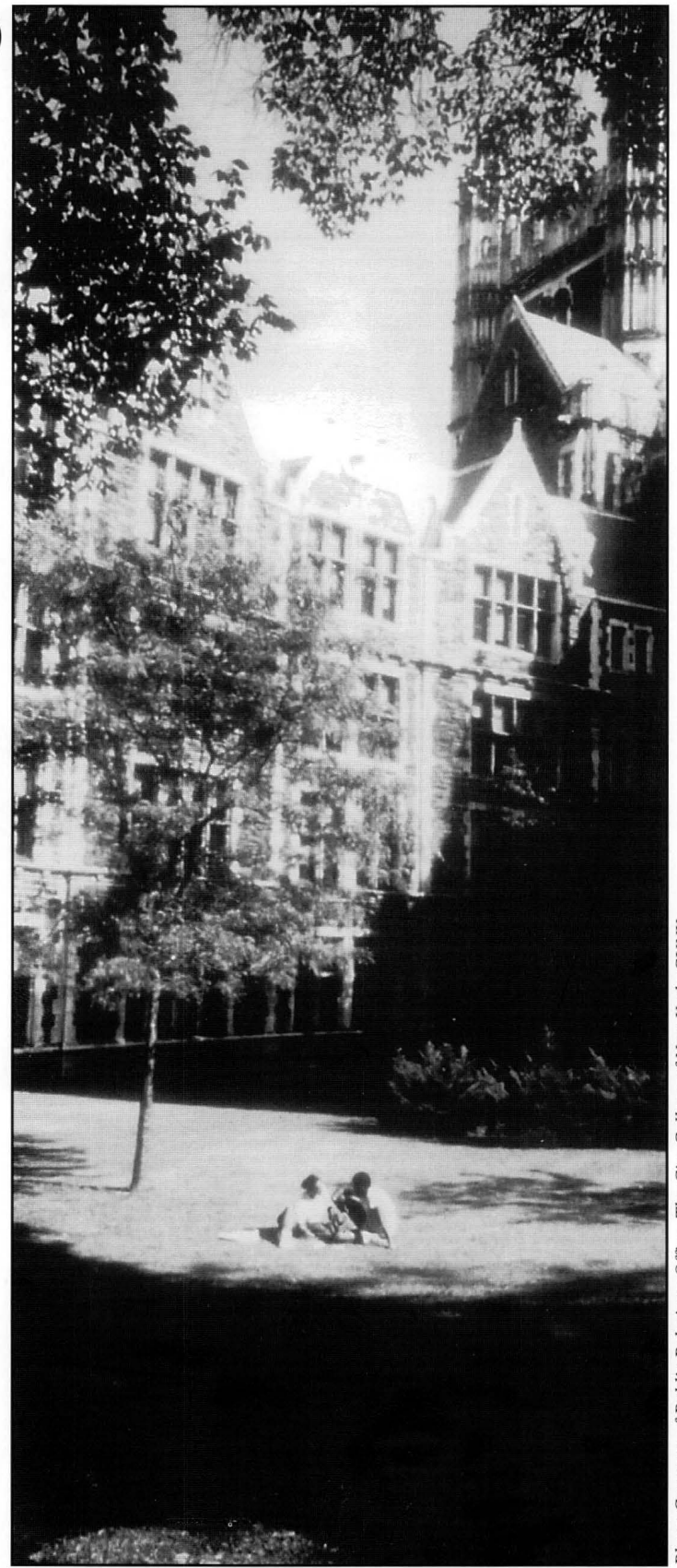
The bucolic City College campus contrasts with bustling New York City.