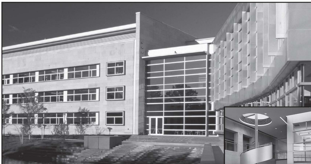
◀ Henry M. Rowan Hall, home of the Chemical Engineering Department.