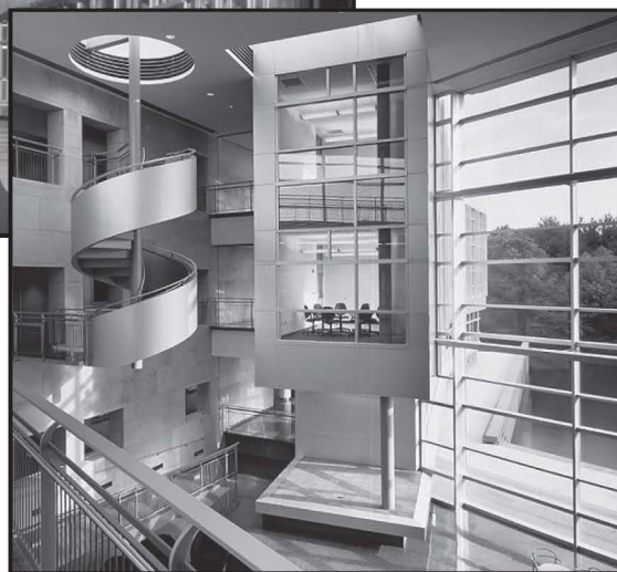
View of the atrium and spiral staircase in Henry M. Rowan Hall. ▼