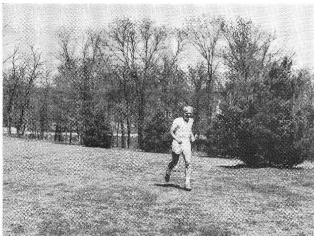
"Running—the best sleeping pill I've ever found."