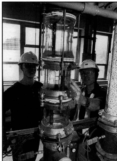
The undergraduate unit ops lab emphasizes planning and execution of experiments, analysis of results, technical communication, and teamwork.

Achievements such as the National Science Foundation's designation of the Center for Advanced Engineering Fibers and Films as an NSF Engineering Research Center hold great promise for the future.