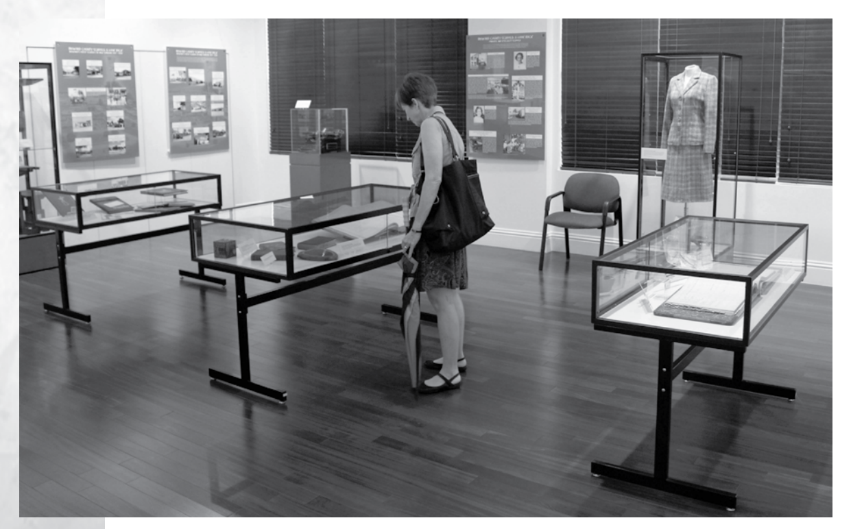
Gallery at West Side School

This exhibit, Broward County Schools: A Look Back was created by the Broward County Historical Commission as part of the 2nd Annual Broward County Heritage Celebration in honor of National Historic Preservation Month. The theme of the 2012 heritage celebration, Broward's Education History: A Path to the Future, was presented to bring focus to this part of the County's rich heritage.