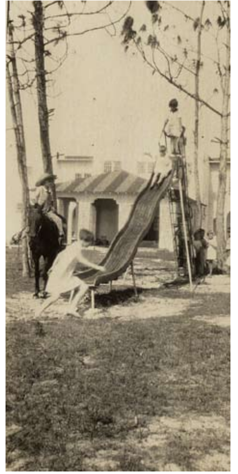
West Side Grade School in Fort Lauderdale

This beautifully presented look back is captured in fourteen large panels with historic images and informative text. Glimpses of history are represented in this exhibit on these panels depicting: Broward County Schools: In The Beginning, Broward Schools 1915-1938, African-American Schools in Broward County, Rosenwald Schools, Gone But Not Forgotten: School Namesakes, First Schools in New Suburbs: 1951-1990, and Private and Specialty Schools. Augmented by interesting and well-preserved artifacts, the exhibit is something to experience.