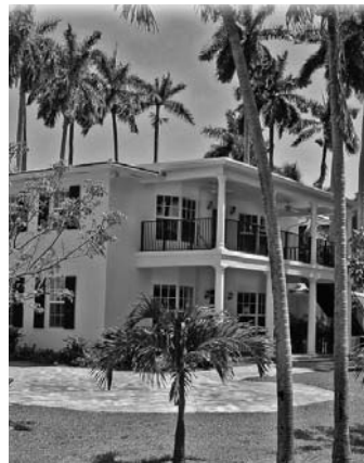
Richardson Historic Park and Nature Preserve Page 34