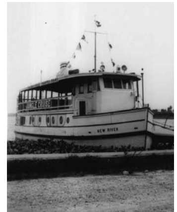
On the Cover: New River