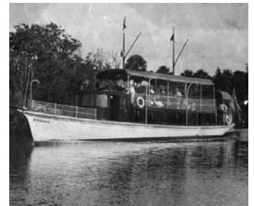
Sight-Seeing Boats in Mid-Twentieth Century Broward County By Denyse Cunningham Page 41