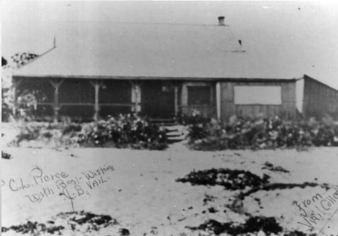
House of Refuge.