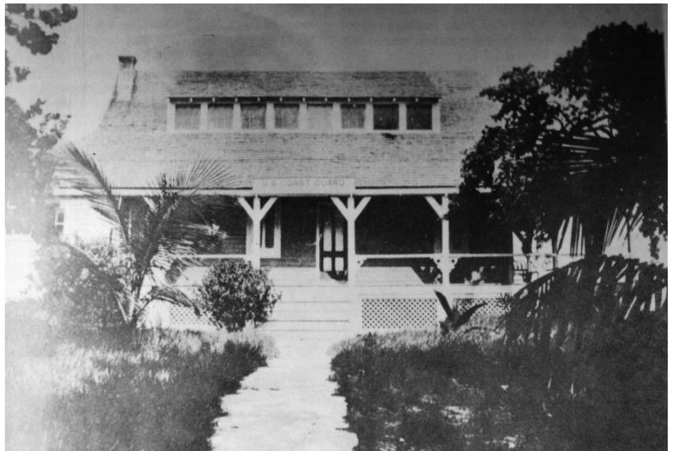
The House of Refuge was taken over by the Coast Guard during WW I.

Anyone wishing to view an accurate, detailed replica of the House of Refuge may view the model on display at the Fort Lauderdale