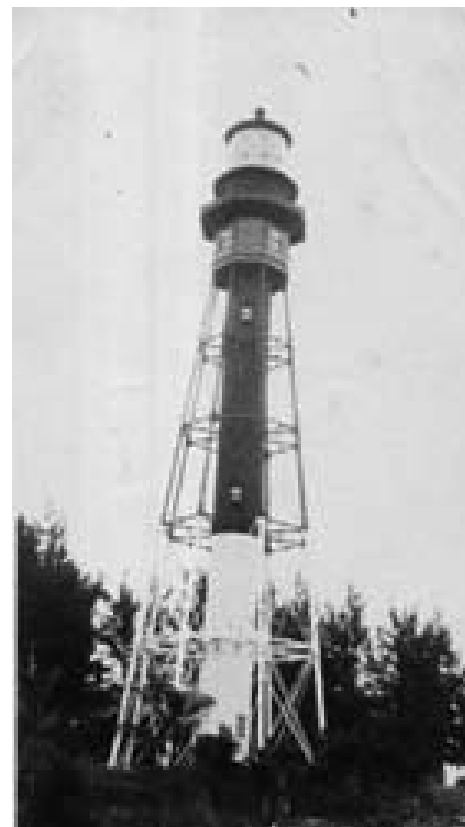
The Hillsboro Lighthouse, 1920s.