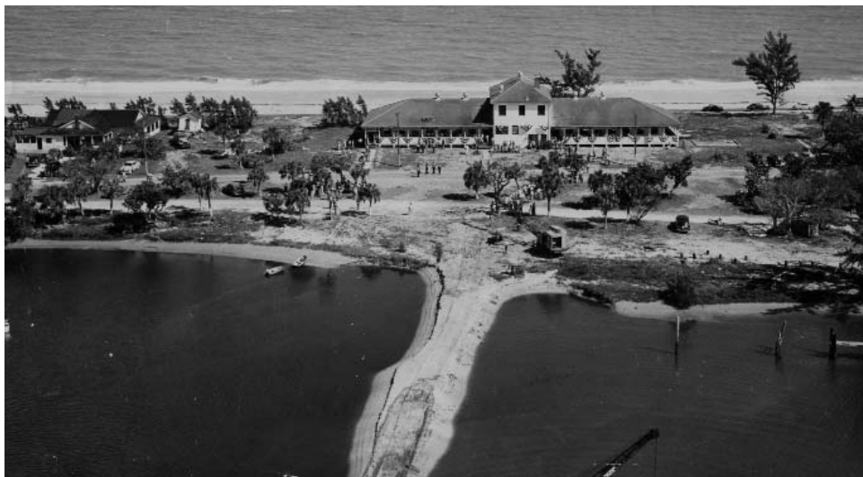
Coast Guard Base Six Fort Lauderdale, Florida, was located where the Bahia Mar beach is today.