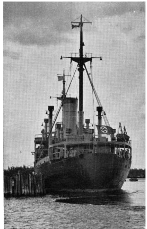
The SS Arauca .

Where 1939 gave journalists the initial frenetic look at the Arauca and its crew, 1940 ushered in a more personal picture of the ship and its stories.