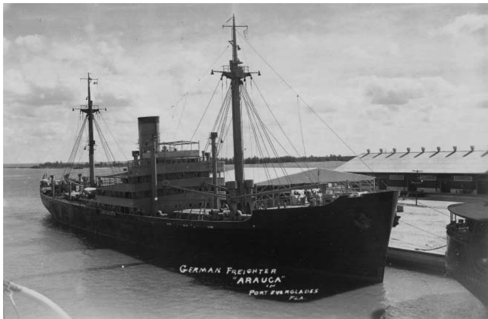
The SS Arauca docked at Port Everglades.

The Arauca faced another libel suit in 1940 as well. While the exact date is unknown, in March 1940, the Asiatic Petroleum Company brought a $150,000 action against Hamburg-American Line, attaching the Arauca in fashion similar to what had been done by Ledward, Bibby & Co., Grumbacher and Imperial Sugar. 75 Later in March, the attorneys for each side presented themselves before Judge Holland in Miami to discuss the filing of additional briefs. 76 The judge granted leave to file and the Fort Lauderdale Daily News reported that the instant controversy was “between two belligerent nations, both of which have passed war measures making it