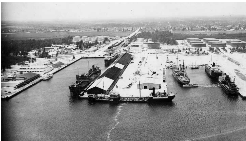
Port Everglades, 1934.