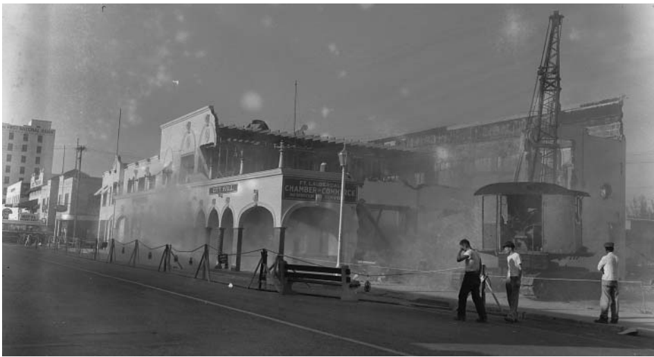
The Fort Lauderdale Chamber of Commerce was located at 115 South Andrews Avenue where the Broward County Government Center is located today.

that the Arauca possessed no crew list when it came to port. 88 As such, the immigration inspector explained, restrictions were necessary for the crew as their intentions in the United States could not be determined. 89 By this time, 24 of the crew were granted shore leave by a board of inquiry, while the remaining seamen were confined to the docks and to bull pen exercise from 1:30 to 5:30 p.m. daily. 90