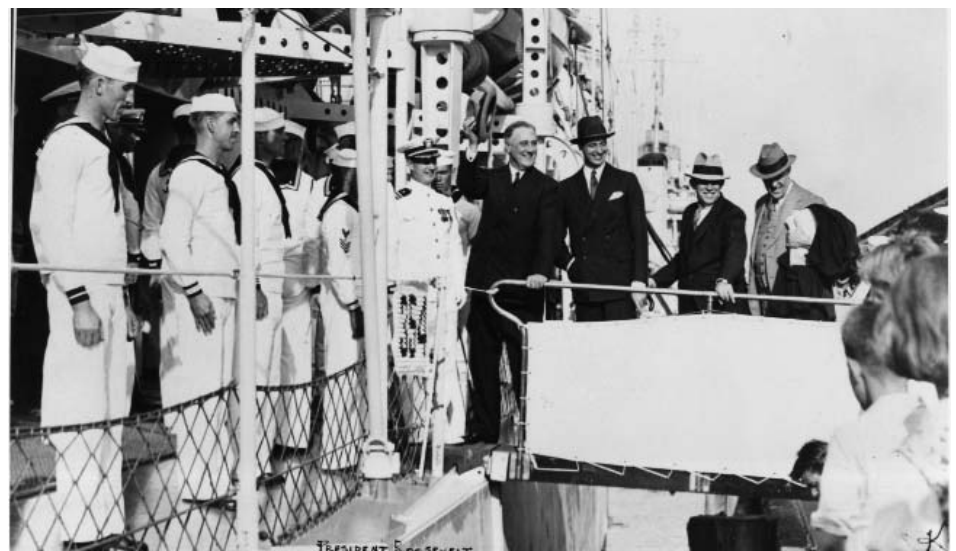
President Franklin Delano Roosevelt in an earlier visit to Port Everglades in 1936.