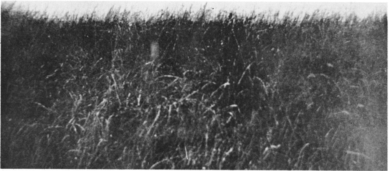
When Governor Broward began to reclaim the Everglades it was mostly an intractable wasteland. In 1915 about nine-tenths of Broward County lay in the Everglades. This is a stand of the heavy saw grass which impeded development of the Glades.

Broward led Davis by a small margin in the voting the next day; thus, the two leaders swung into the second primary. Their loud, mutual denunciations echoed in all the newspapers. Davis and his supporters accused Broward of actively advocating the "insanity divorce bill" which had enabled Flagler to divorce his wife. Further charges were leveled to the effect that this legislation had been bought by Flagler for $20,000. In another move to discredit Broward, one newspaper reported that Broward dyed his moustache every day, while another claimed that he was an Apache Indian.