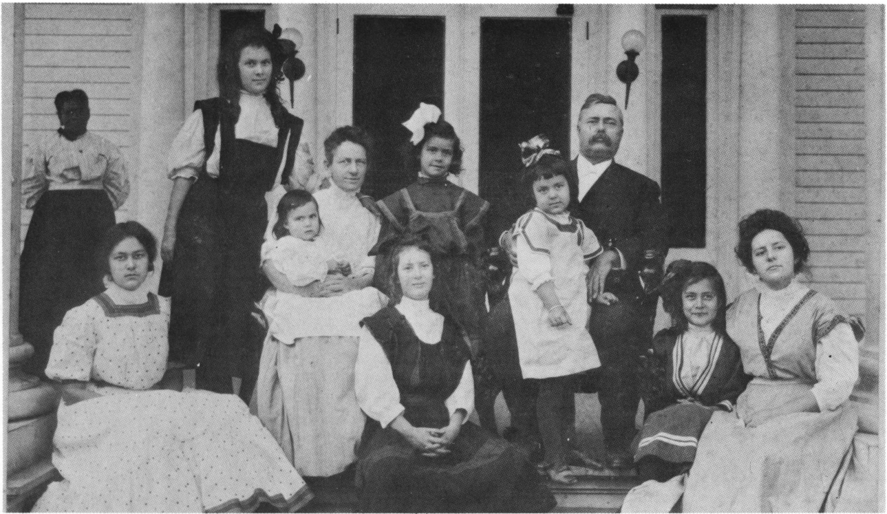
Governor and Mrs. Napoleon B. Broward and their family of eight girls pose on the porch of the governor's mansion.

came known as skipper and part owner of the newest and fastest vessel on the river. Jacksonville was then a resort center with 60,000 tourists during the winter seasons of the mid-1880's.