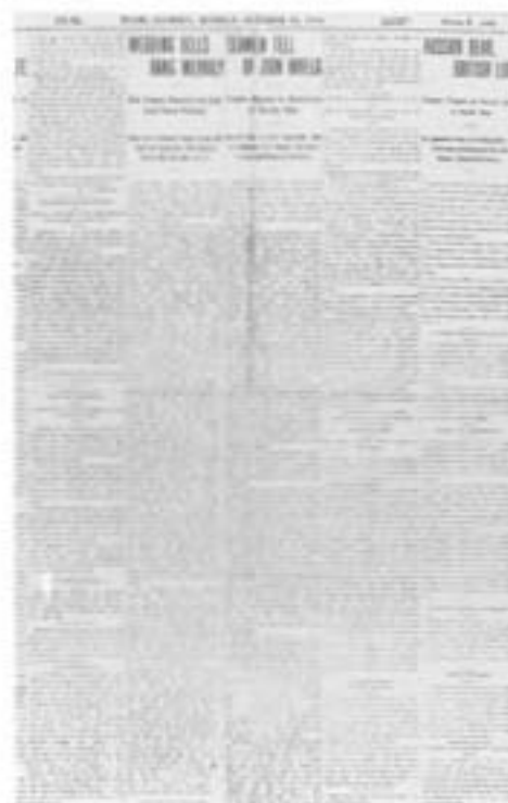
"The Daily Miami Metropolis" reports the "Zion" wreck.