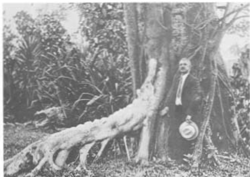
One of Broward County's natural wonders — Commodore A.H. Brook's famous "Two Million Dollar Tree" at Wyldwood Nursery on the north side of the Dania Cut-off Canal, east of U.S. Highway 1. In this 1936 photo, Brook stands next to the tree's "alligator root."