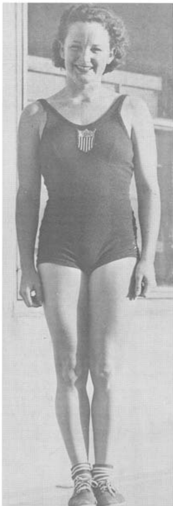
Swimming champion Katherine Rawls was one of Broward County's best-known residents in the mid-1930s. This photo was taken at the Las Olas Beach Casino in 1936, the year she competed in the Olympic games in Berlin.