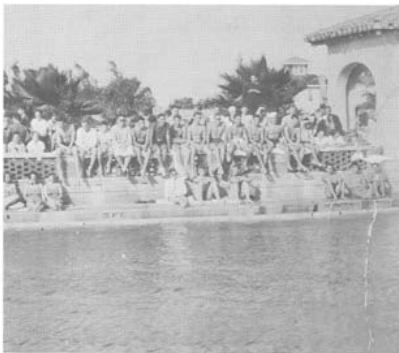
This group of college swimmers and coaches gathered at the casino pool on December 27, 1936, for the Second Annual Aquatic Forum. Note the sign on the pool wall at far right.