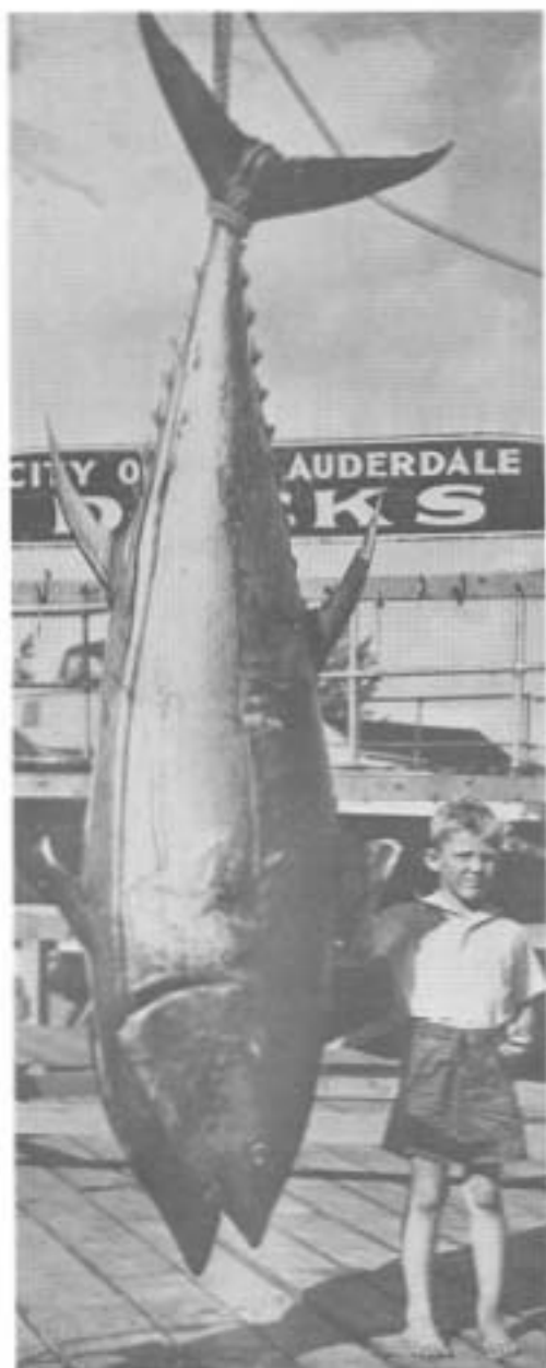
Large tuna and small fisherman at the municipal docks on New River, just northeast of the Andrews Avenue bridge, 1937.