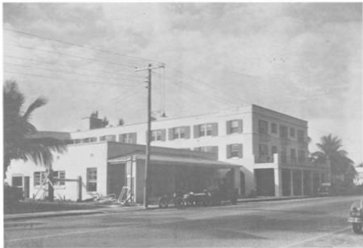
Above is the Champ Carr (now Riverside) Hotel at 700 Las Olas Boulevard, nearing completion in 1936. Below is the hotel's shining 700 Club bar.