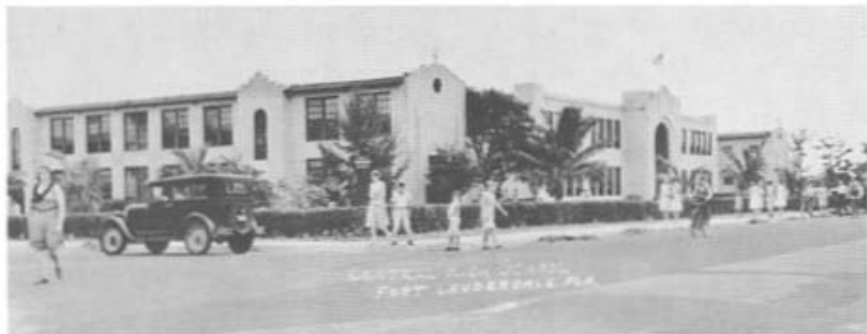
The end of another school day at Fort Lauderdale High School. This view is from the corner of S.E. 2nd Street and S.E. 3rd Avenue, looking northeast.