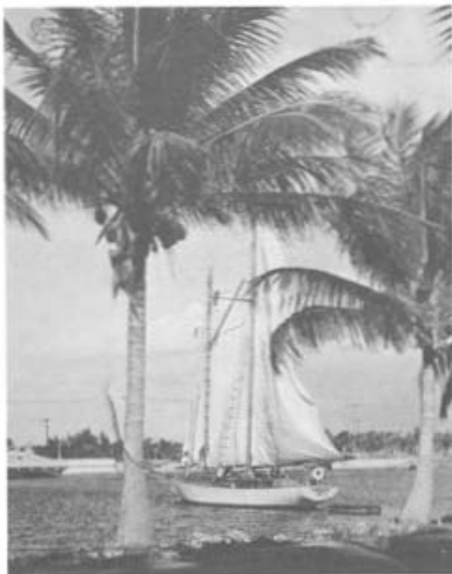
Scenes of tropical beauty, like this view of the Intracoastal Waterway, lured tourists to Fort Lauderdale, even in the Depression years.