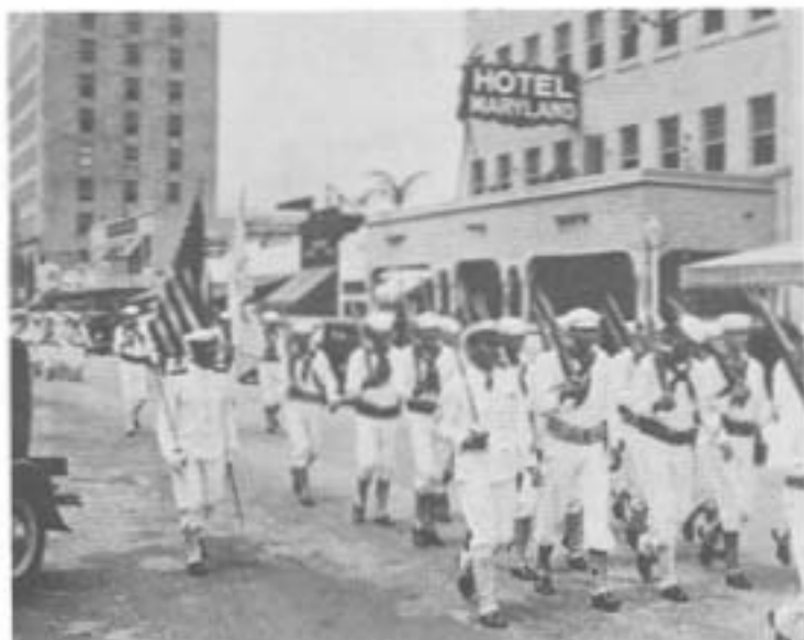
A contingent of Coast Guardsmen marches up Andrews Avenue past the Maryland Hotel as part of the 1937 Fourth of July parade. Other landmarks visible in this photo include the Sweet Building (upper left) and Brown's Good Food Restaurant (right).