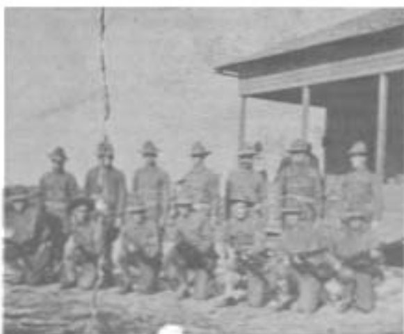
Davie members of the Broward County Guards, 1917. The building behind them was Davie's first schoolhouse, replaced by a new concrete building the following year.

Davie is on the honor roll when it comes to the war. They have 19 men in the Broward Guard, and have sent six men to the front. We have knockers who never do a day's work who will tell you that the glade lands are worth nothing. We do not hesitate to say that they are the best land in the world.