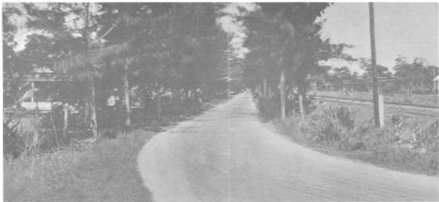
The Dixie Highway, entering Fort Lauderdale from the north, c.1917.