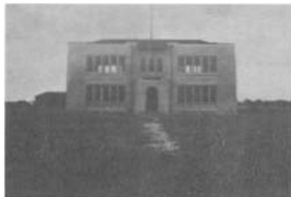
Davie school building, constructed in 1918.