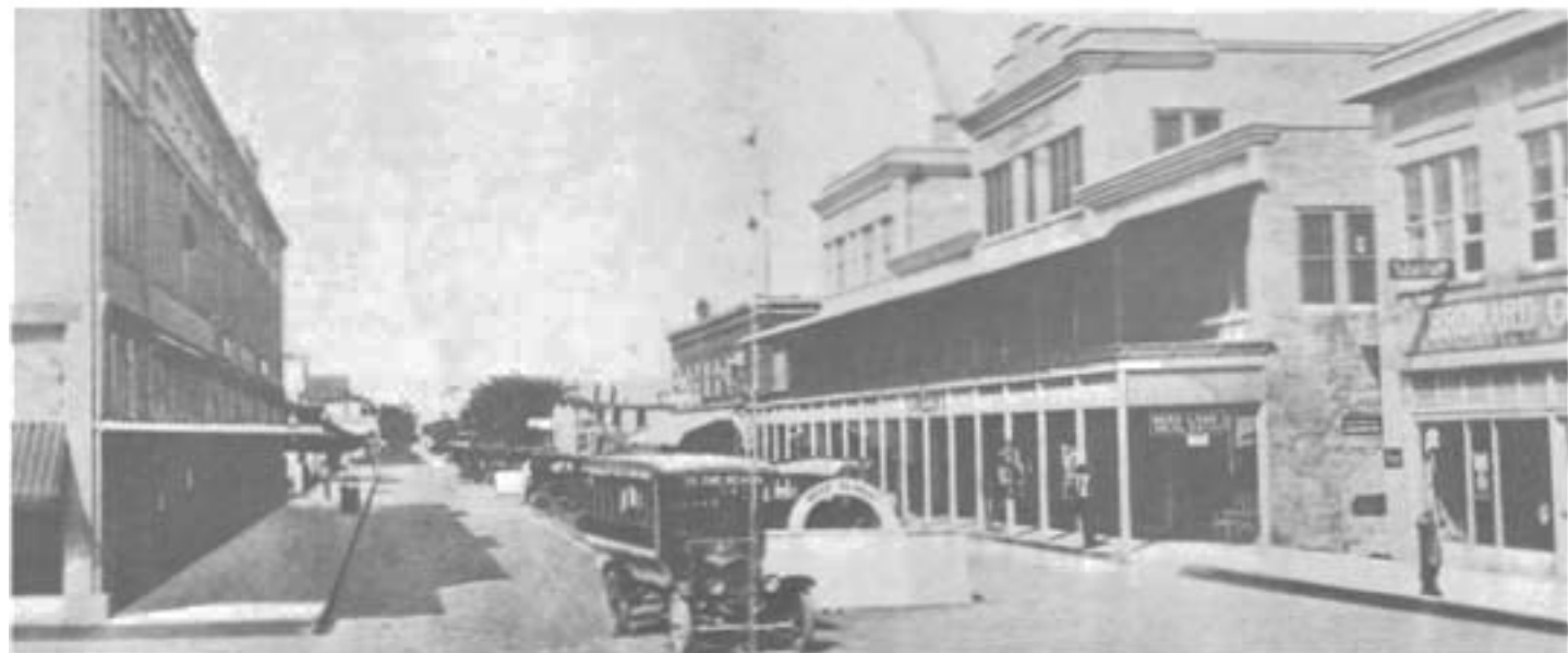
Brickell Avenue was downtown Fort Lauderdale's main street when this 1917 photo was taken. Note

We have a Boulevard to the beach where great improvements have been made lately. The City of Ft. Lauderdale