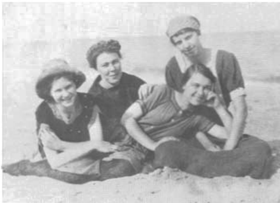
Fort Lauderdale High School girls on the beach, 1918.