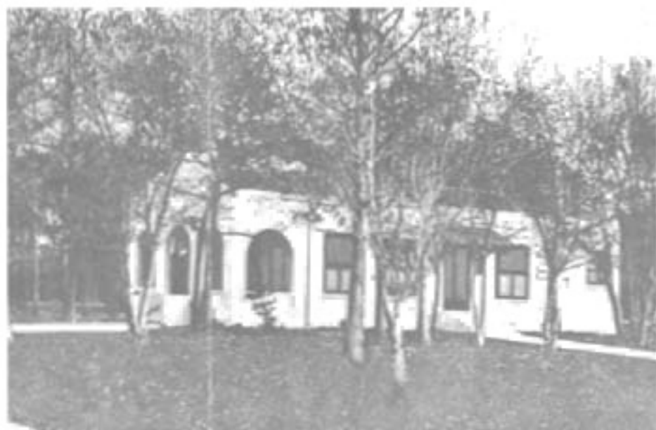
The Fort Lauderdale Woman's Club building in Stranahan Park, shortly after its completion in May 1917.

A valuable reform which took place in this city a little less than a year ago, April 28, 1917, was the closing of the near beer joints in our city. Broward county has been dry territory ever since