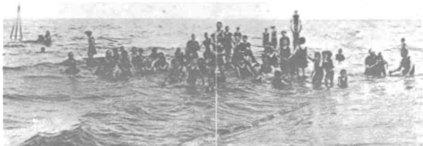
Bathing scene at Fort Lauderdale's Las Olas Beach, late 1910s.

The Harbauer Company, manufacturers of high grade table condiments, leased the old site of the Ft. Lauderdale Lumber Co. the first of January and immediately began the overhauling of the old buildings, the erection of new ones and the installing of machinery so that by the 27th of last month everything was in readiness to begin cooking tomatoes and the following Friday this company shipped their first car load of tomato pulp north to be manufactured into catsup. The plant comes not only as an improvement to the town but is the greatest boom possible for our farmers, for among the thousands of acres of tomatoes regularly planted in this county, the crooks, off