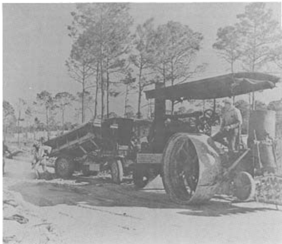
Pioneer road builder S. P. Snyder and crew at work in Broward County, 1915.

The best roads, best schools, the best climate and good health is enough to say for any place. But when we add 1,200 square miles of rich Everglades land we can see the great opportunities awaiting those who come to build a home and accumulate a fortune. We do not advise people to break up where they are prospering to come to Florida. But should they see fit to come to Florida we do not think that they will ever find cause to regret it.