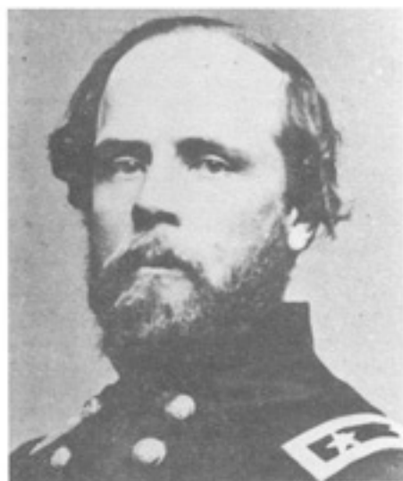
Lieutenant Darius N. Couch, seen here as a Union major general during the Civil War.

selves together at Jupiter, New River, and Cape Florida, for defense." 5