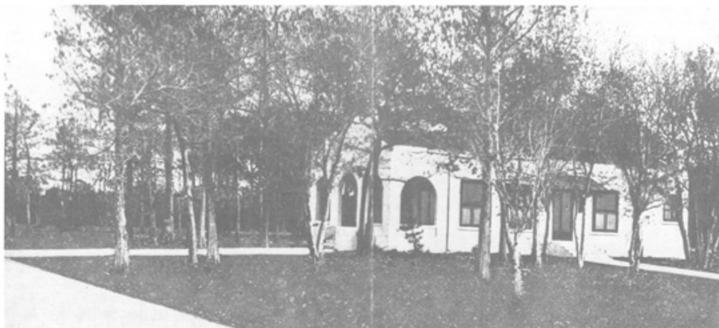
The Fort Lauderdale Woman's Club building in Stranahan Park, shortly after completion, 1917.