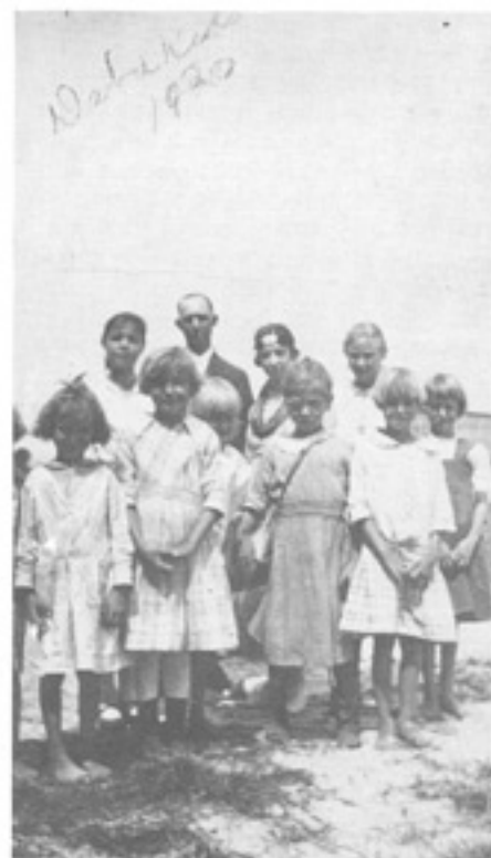
Davie School teachers and students, 1919-1920.