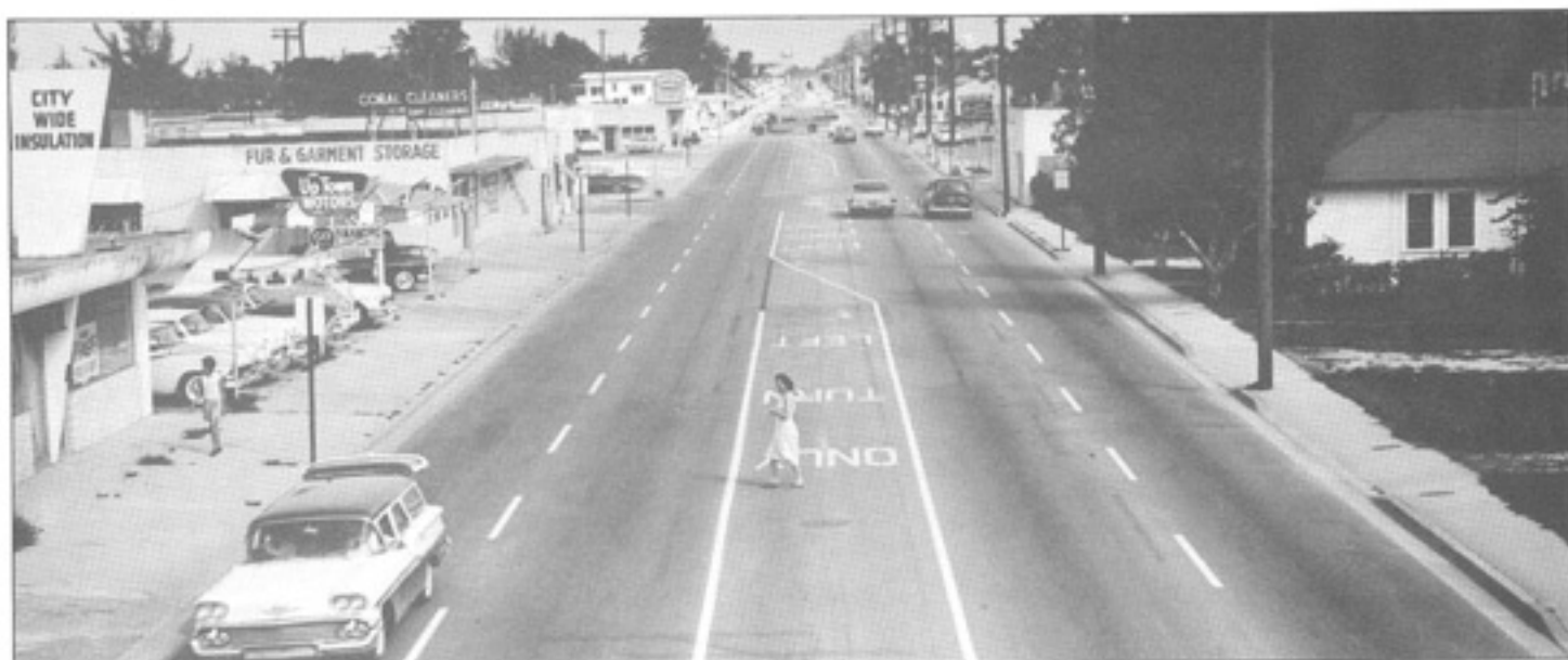
Broward Boulevard, once a narrow, lightly traveled road, was on its way to becoming one of Fort Lauderdale's main thoroughfares by 1960, when this view, looking eastward from West Thirteenth Avenue, was taken.