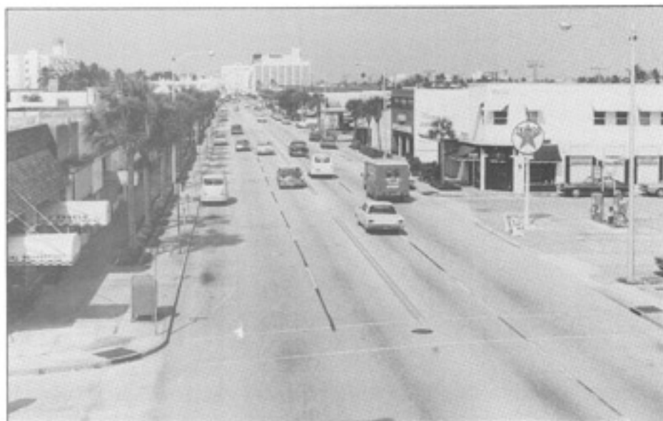
East Las Olas Boulevard, looking west toward downtown from the Himmarshee Canal, c. 1968-69.