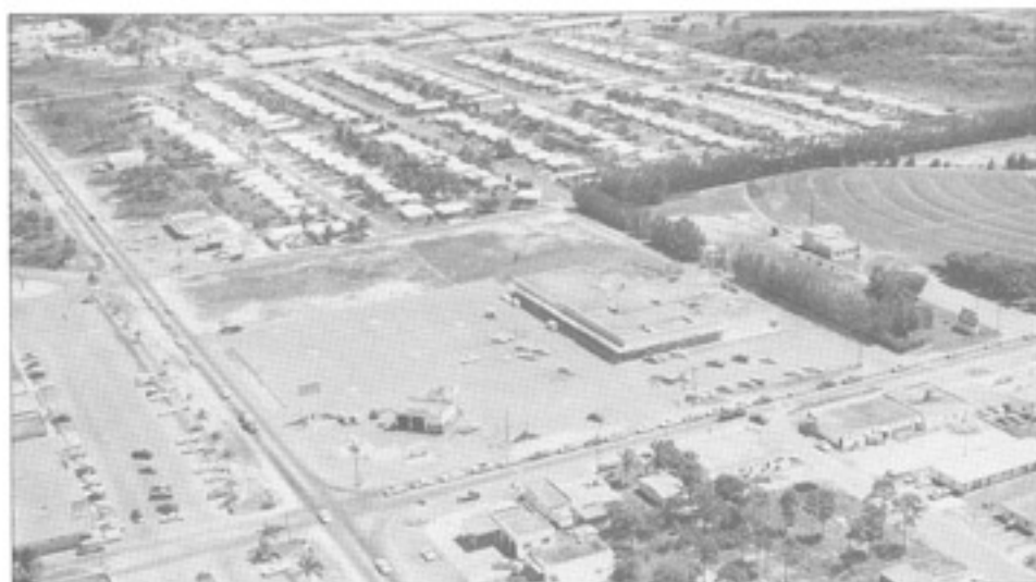
Housing developments and shopping centers cover the land near the intersection of Prospect Road and Andrews Avenue in this winter 1962 scene.