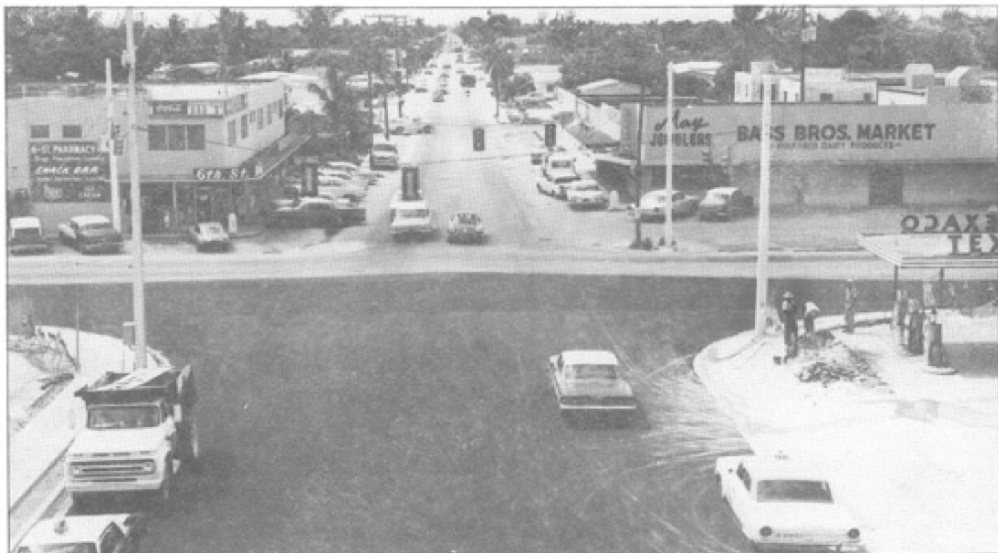
Northwest Sixth Street looking west at Northwest Ninth Avenue intersection, 1966. Sign at Texaco station at far right shows gas selling for 24.9 cents per gallon.