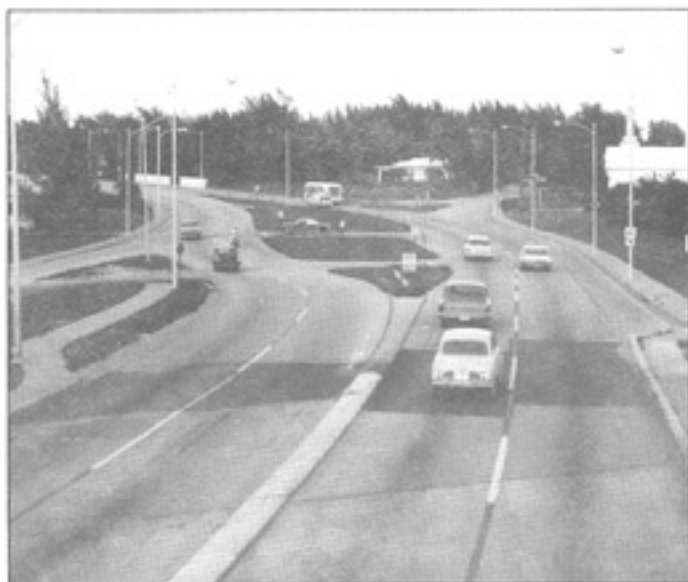
Eastward view of the Southeast Seventeenth Street/A-1-A bend at the Mercedes River bridge, Harbor Isles, 1962.