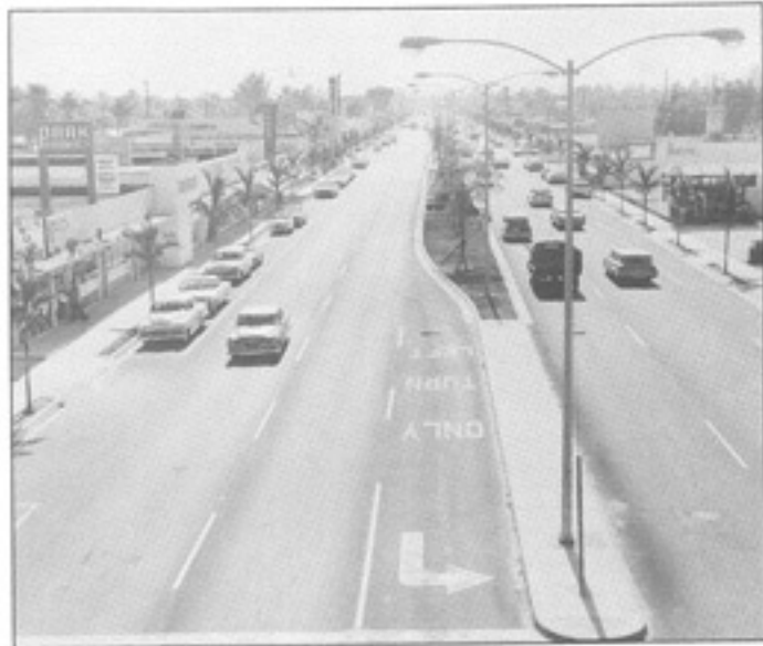
Federal Highway (U.S. 1), looking south from Northeast Sixth Avenue, c. 1962-63.