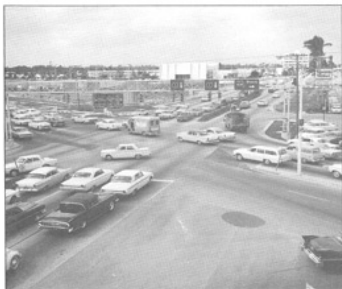
Oakland Park Boulevard and U.S. 1 was a busy intersection, even in 1962.