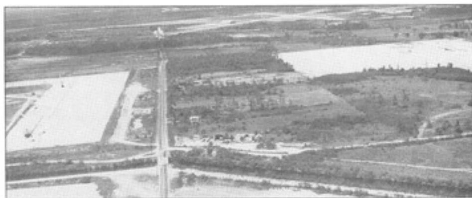
Out in the country — Northwest Twenty-first Avenue (Decker Road) looking north toward Executive Airport, 1962.