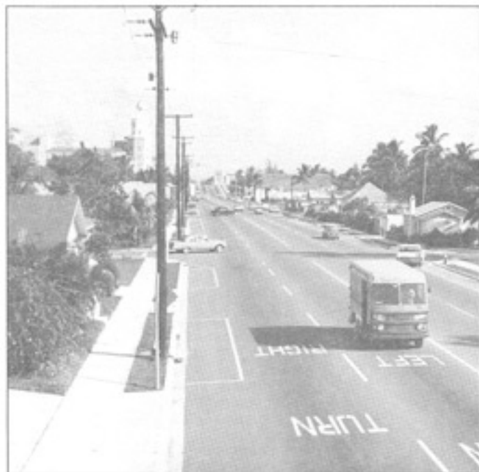
Southeast Third Avenue, looking northward toward the New River bridge, 1960. Note the Broward County Courthouse bell tower, soon to be demolished, at left.