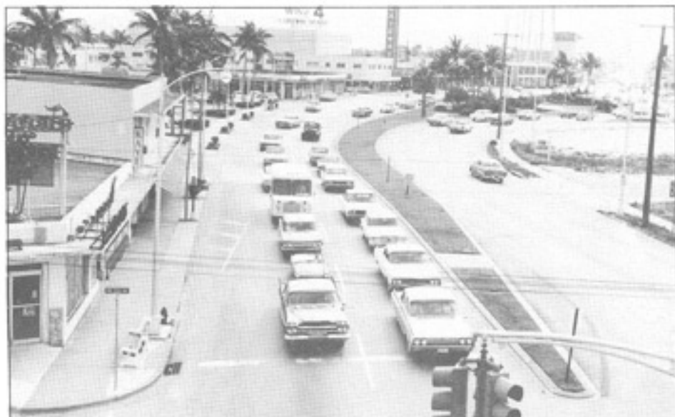
Gateway curve on Sunrise Boulevard, looking west from Northeast Twentieth Avenue, c. 1964.