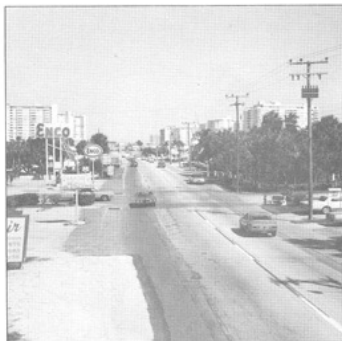
A familiar scene for tourists — view north along A-1-A from the 2900 block, October 1968.