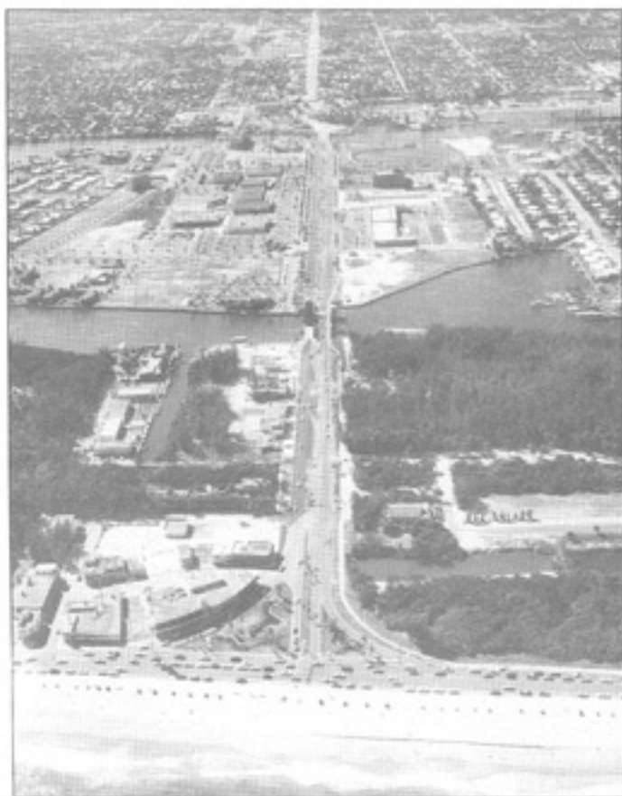
Aerial view of Sunrise Boulevard, showing the Intracoastal Waterway bridge and the intersection with A-1-A, 1960.