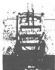
HE CHEATS DEATH ... in Ruffed chair