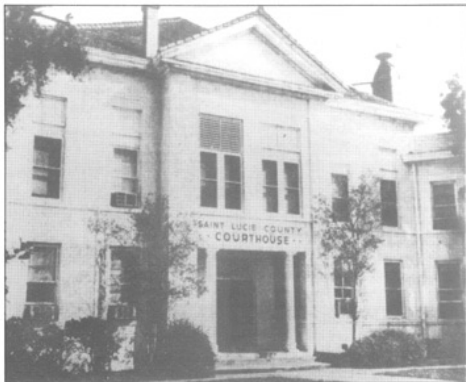
The St. Lucie County Courthouse in Fort Pierce, where the Peel murder trial was held.