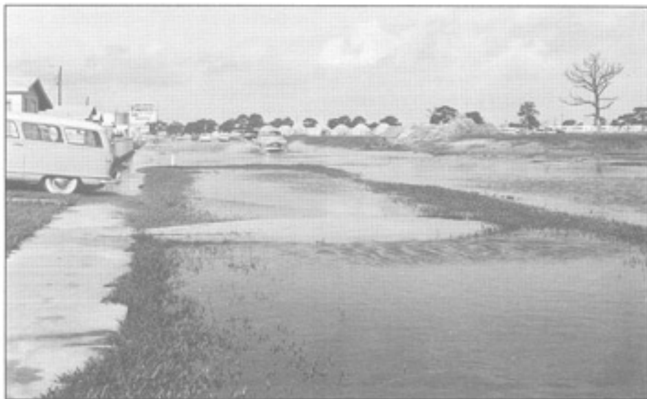
New homes and flooded conditions in Miramar, c. 1960.

I had no idea how large Miramar was going to be. It was much nicer when it was smaller. Everybody was happier, and it was just better, that's all. The residents were more of a family with more of a community feeling. But, of course, we had to grow — you always either go forward or you go backwards. And you adjust with it. Even so, since I moved out here I really haven't had anybody nearby. I'm still almost in the country now. I'm secluded if I want to be.