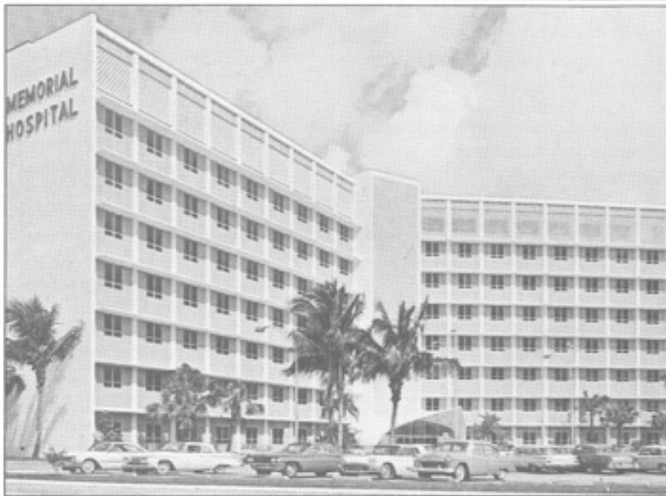
Memorial Hospital, Hollywood, 1960s.

mental in getting that started too, wasn't he?